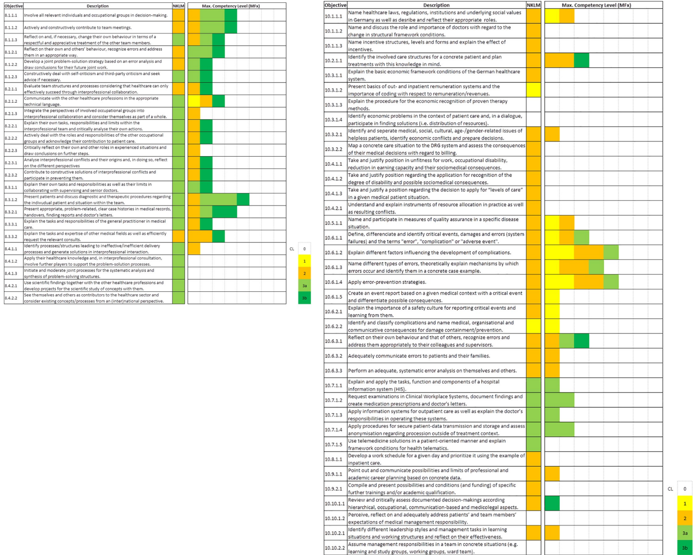
Fig 2. Competency Levels (CL) of learning objectives (O) in surgery across sites. A Collaborator; B Manager. The eight participating sites are represented by a box each. Each faculty's maximum CL opposed to given standard (NKLM). CL: no standard (0, white) knowledge/understanding/basic skills (1, yellow), applied knowledge and skills in training (2, orange), competency in practice, supervised (3a, light green) and independent (3b, dark green). Columns do not represent specific faculties but reveal the cross-site profile.

https://doi.org/10.1371/journal.pone.0233400.g002