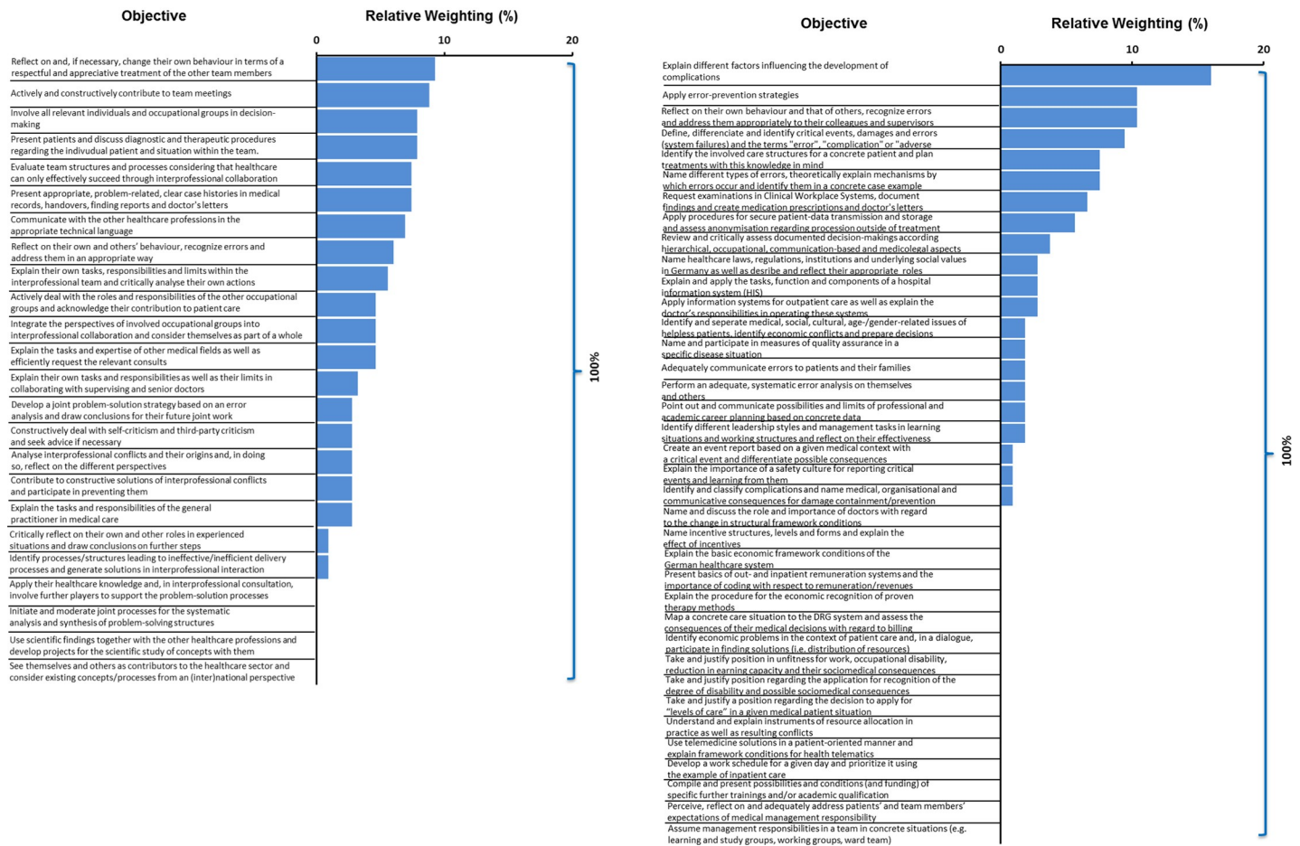
Fig 3. Relative weighting of learning objectives (O) in surgery. A Collaborator; B Manager. Weighted values were calculated based on absolute values of mapping citations multiplied by absolute competency levels. Each faculty's weighted values were put in context of total weighted values for the chapters at all faculties. For ranking of O, relative weightings of all faculties were summed up.

https://doi.org/10.1371/journal.pone.0233400.g003