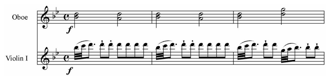
The climax of the primary theme is marked by a combination of two motives from Po in a forte dynamic. While this same phrase proceeds to introduce the transition, a contrasting piano dynamic and lower register articulate the theme.