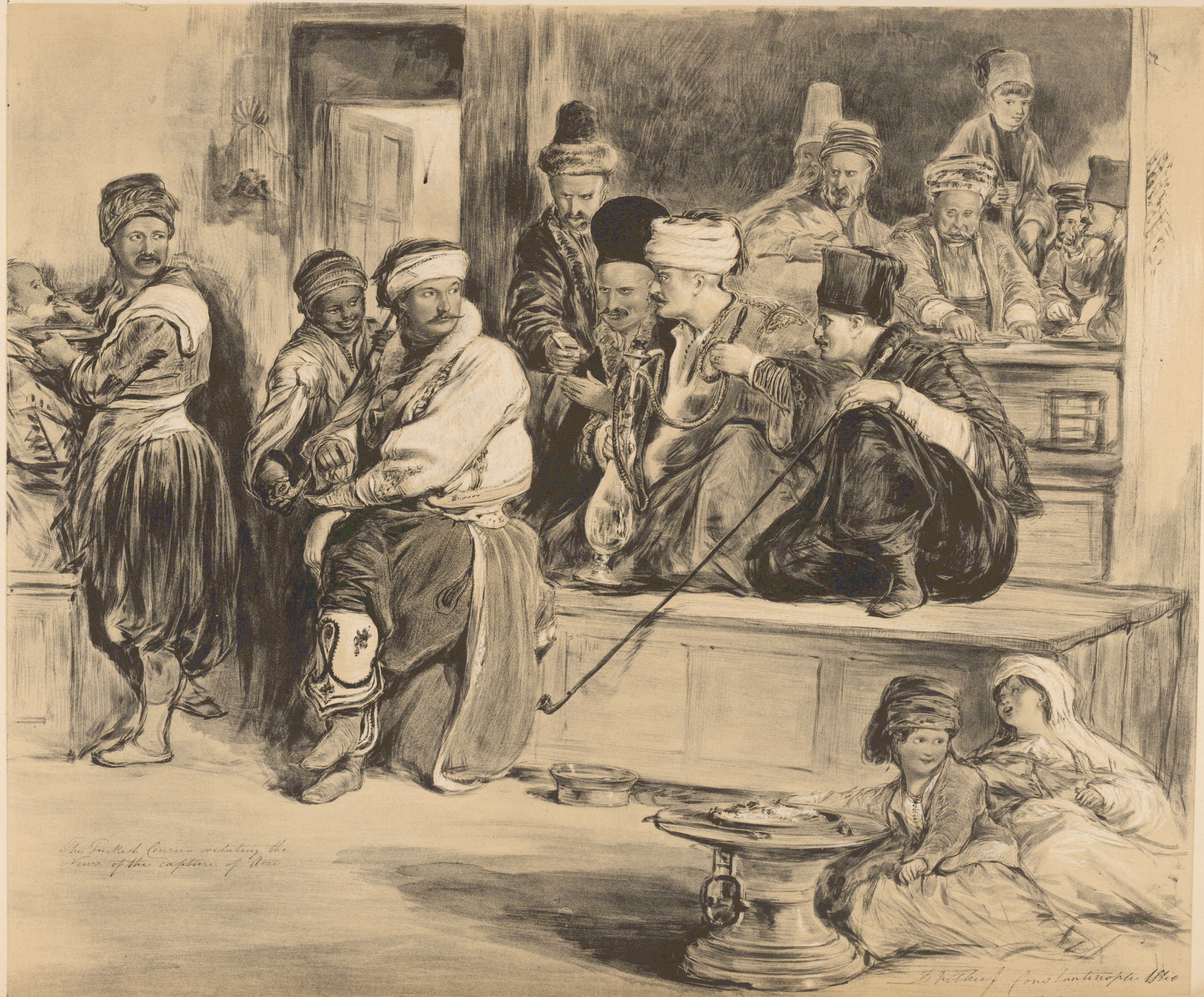
The Turkish Courier relating the news of the capture of Acre