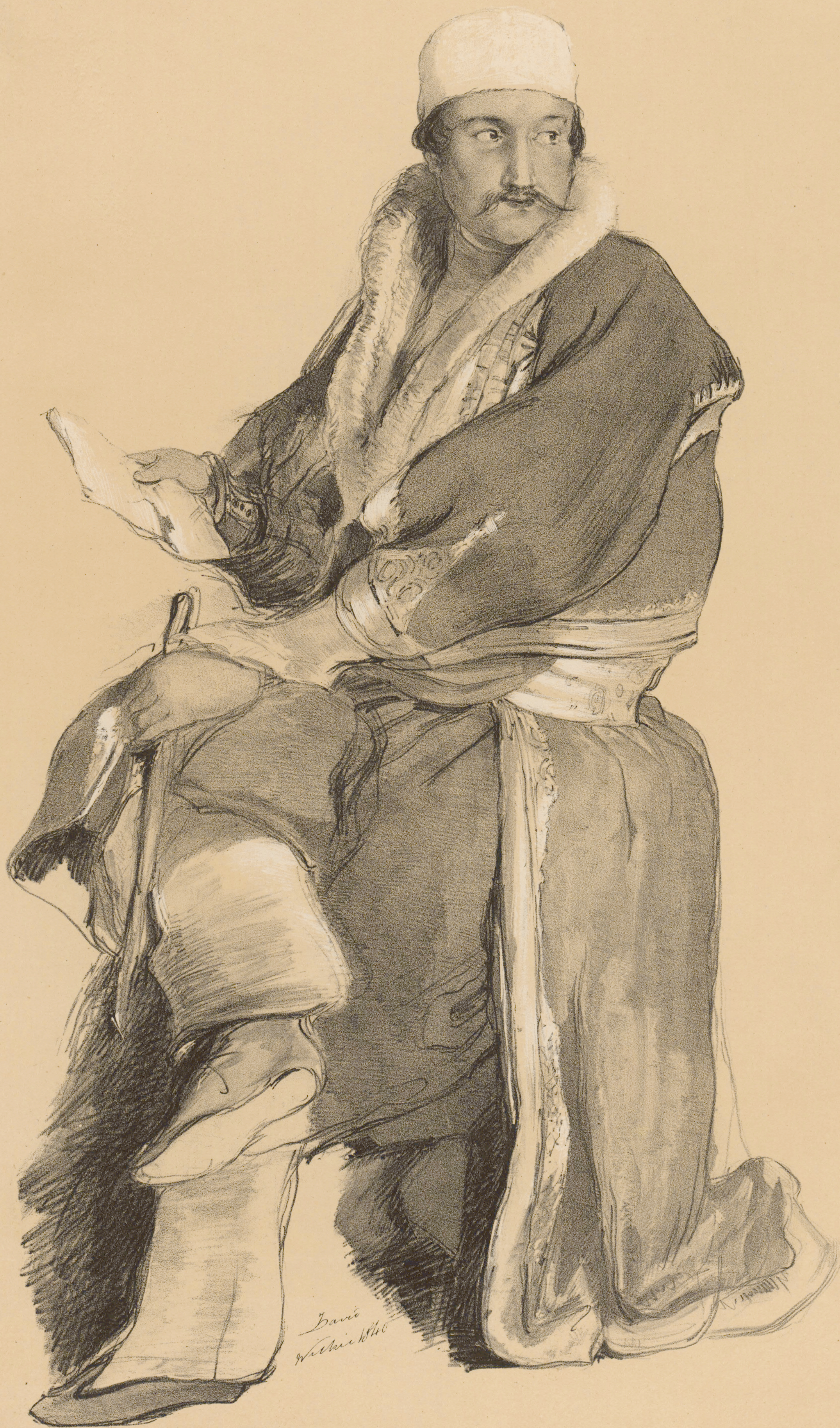
The Travelling Tartar to the Luccini Messenger