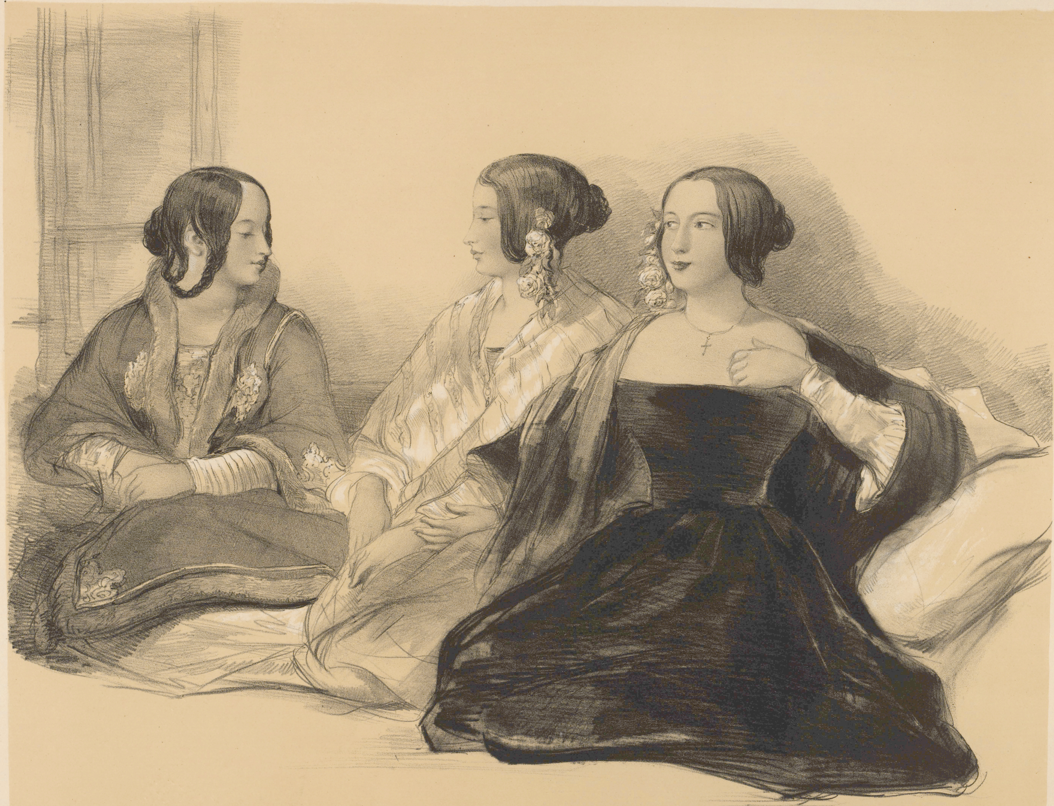
Three Greek Sisters at Therapia