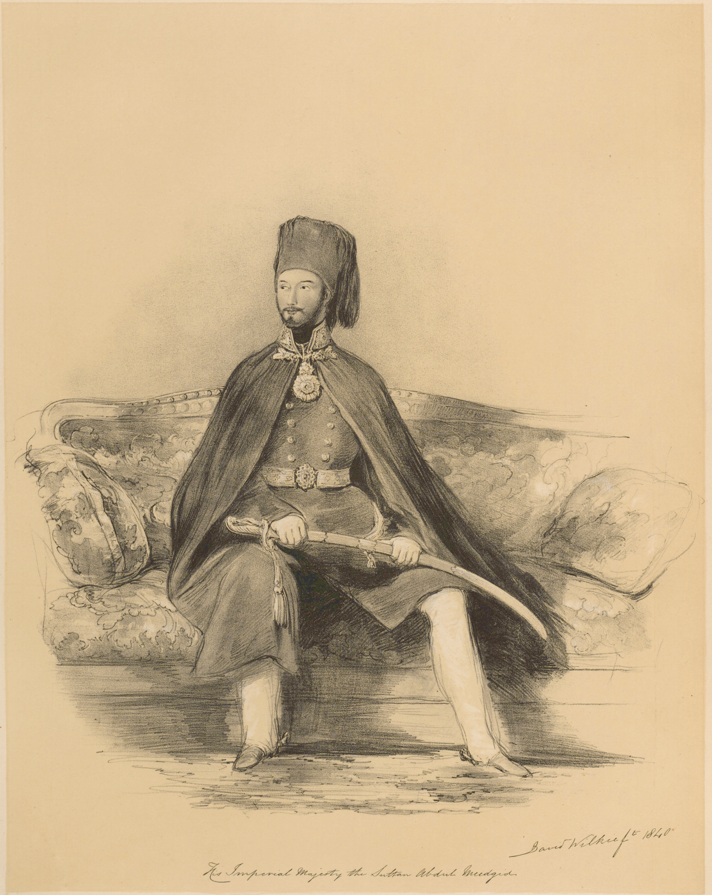
His Imperial Majesty the Sultan Abdul Mejid.