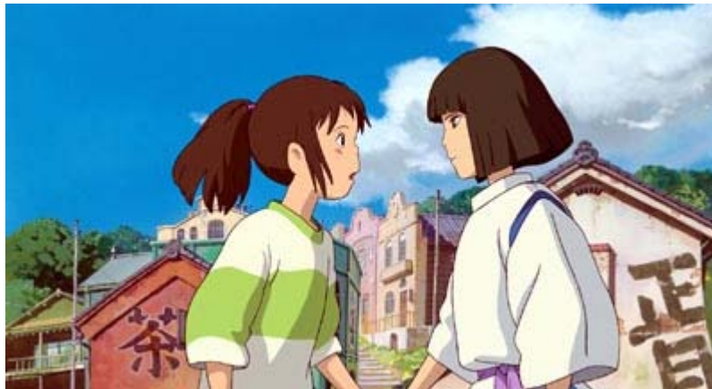
5. Chihiro and Haku as a young boy