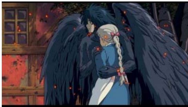
3. Howl as a bird-man bearing angelic wings, Sophie as a young girl with long silver hair