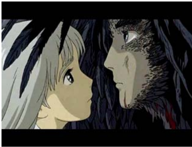
4. Howl as a defeated, frightening bird-man, Sophie as a young girl with short silver hair