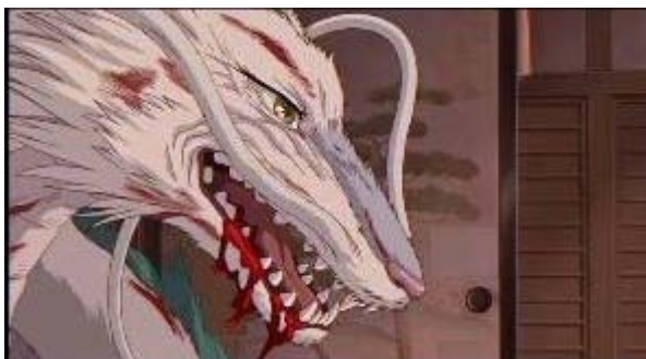
7. Haku as an injured dragon after the attack of the paper-birds