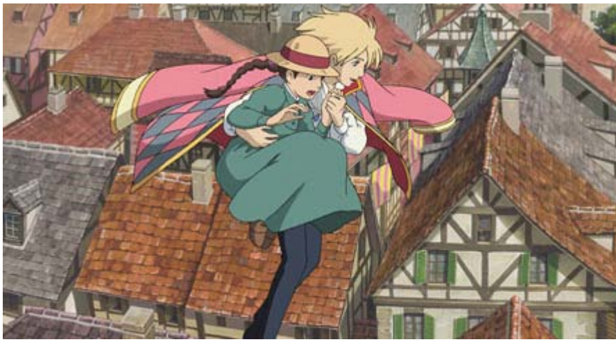
1. Howl as a young man with blond hair, Sophie as a young girl with long brown hair