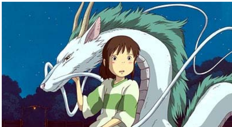
6. Haku as a slender dragon