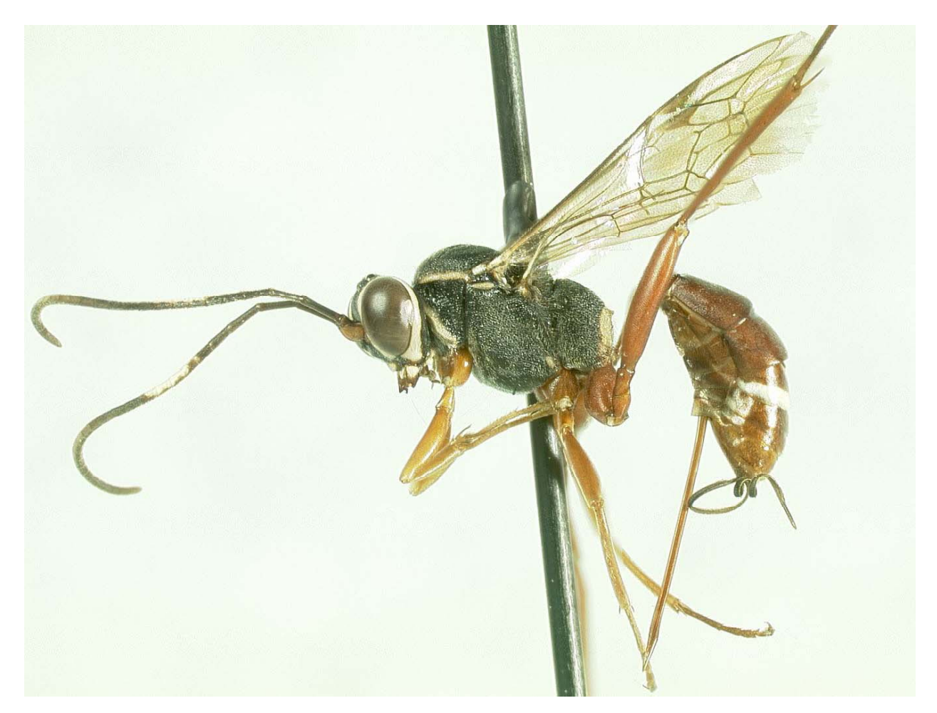
Figure 3. Phycitiplex unicinctus, female, holotype. Santa Vera Cruz, La Rioja, Argentina. Lateral view of entire insect.

Description. Female Holotype . Color: scape light reddish brown, flagellum black with a white band above on segments 5 (at apex) to 9; head and mesosoma with faint reddish staining on mandibles and around clypeus and with white markings as in P. tricinctus except no white on center of face, tegula not wholly white (brownish behind), no white blotch on mesopleural disc, scutellum white only on basal 0.6 with black toward apex, and dorsal metapleuron entirely black; gaster as in P. tricinctus but with a broad white apical band only on tergite 4 and with a little white in and briefly above lower hind corners of