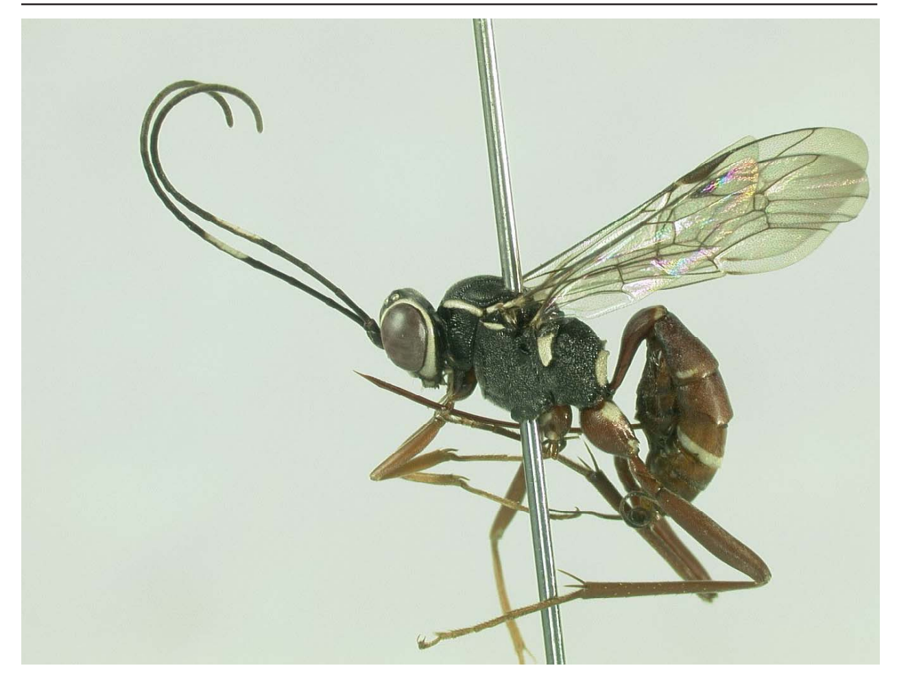
Figure 5. Phycitiplex trichroma , female, holotype. Santa Vera Cruz, La Rioja, Argentina. Lateral view of entire insect.

times s long as forewing; nodus well defined, a little raised; dorsal valve in profile falling off directly from nodus to apex; tip 0.20 times as high at notch as long from notch to apex.