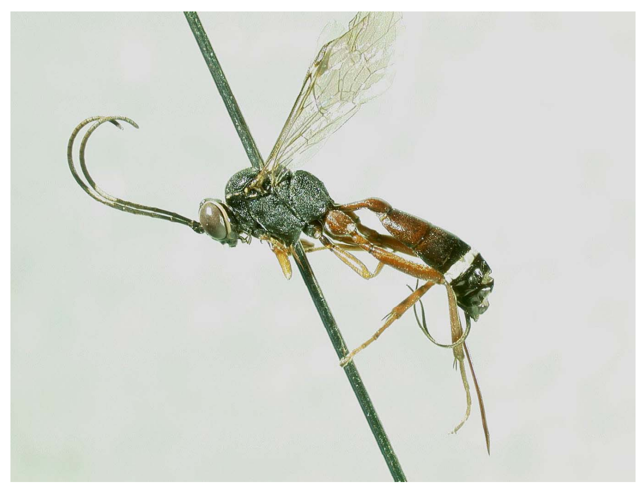
Figure 1. Phycitiplex obscurior , female, paratype. Santa Vera Cruz, La Rioja, Argentina. Lateral view of entire insect.

Specific name. From the Latin comparative adjective obscurior (darker).