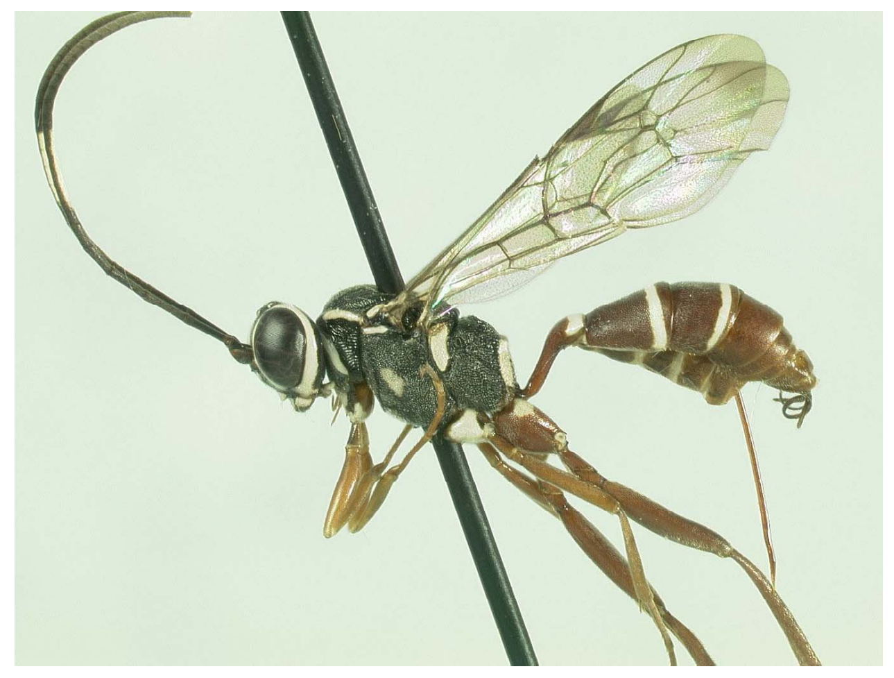
Figure 2. Phycitiplex tricinctus , female, paratype.Santa Vera Cruz, La Rioja, Argentina. Lateral view of entire insect.

than basal and strongly declivous. Malar space 0.66 times as long as basal width of mandible. Wing venation: areolet large with intercubiti very strongly converging above, second abscissa of radius 0.4 times as long as first intercubitus. First gastric tergite: postpetiole short and broad, 2.0 times as wide at apex as long from spiracle to apex, dorsal carinae obsolete, surface smooth and polished with weak micro-aciculation that fades out apicad and with a few, widely scattered, shallow, medium sized punctures. Second gastric tergite: rather mat with abundant, quite small, shallow but well defined subadjacent to adjacent punctures emitting short, mostly a little overlapping setae. Ovipositor: straight, slender, strongly compressed; 0.32 times as long as forewing; nodus weakly defined by presence of a minute notch, profile of dorsal valve between notch and apex evenly tapering, slightly convex, tip 0.18 times as high at notch as long from notch to apex.