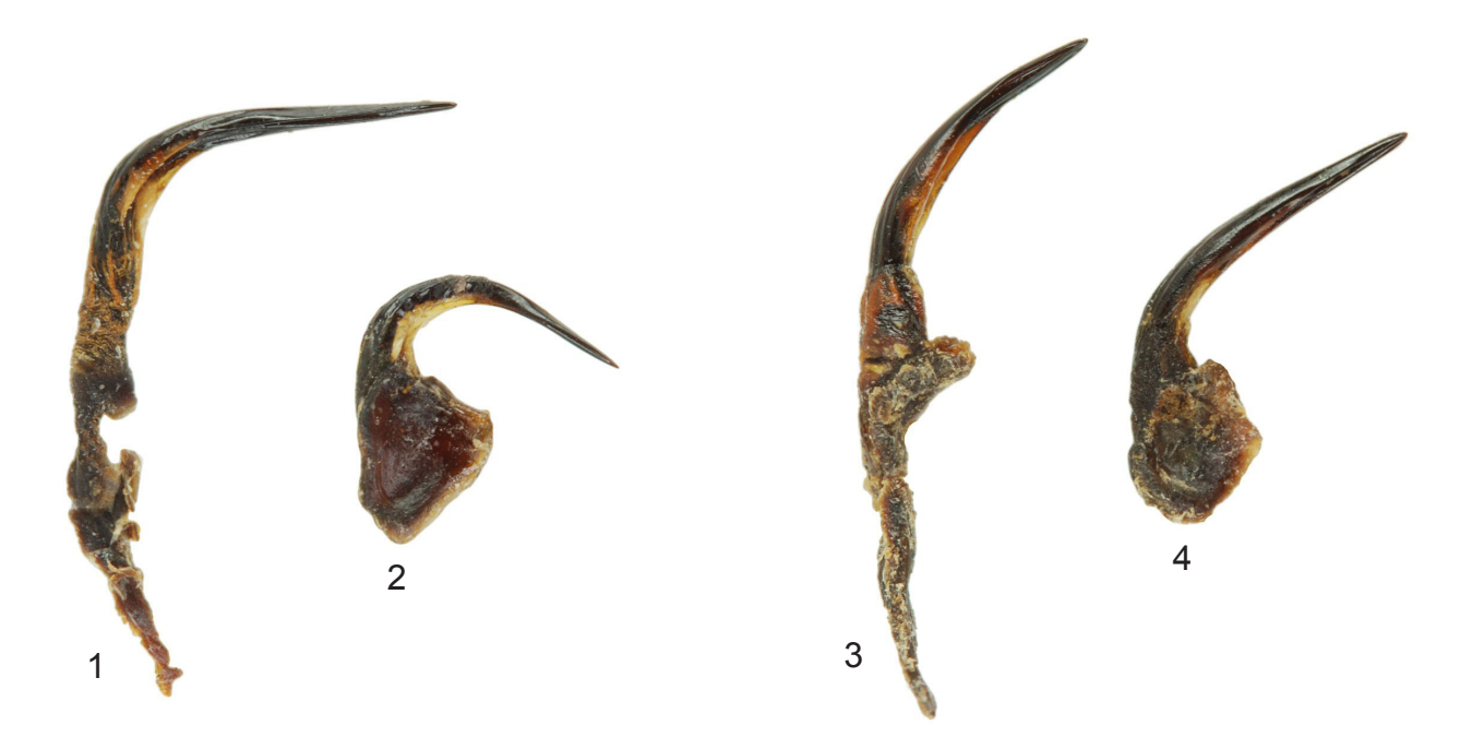
Figures 1-4. Raspulae. 1-2 )X. carinulus sp. nov. 1) Right raspula. 2) Left raspula. 3-4) X. clinias buru ssp. nov. 3) Right raspula. 4) Left raspula.

Distribution. Papua New Guinea, Irian Jaya, Aru Islands.