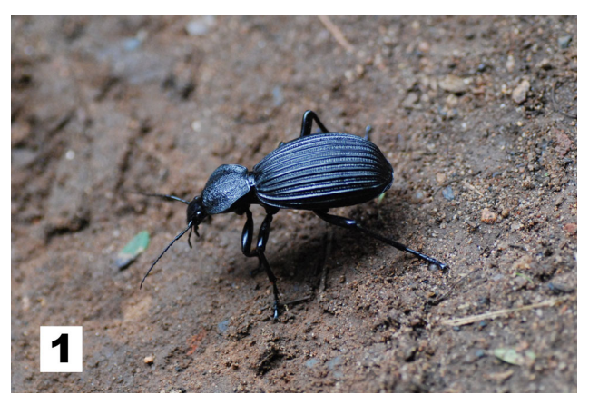
Figure 1. Adult female of Tefflus meyerlei delagorguei , N'waswitshaka Research Camp, Kruger National Park.

Specimens examined are deposited in the following collections: KNPC - Kruger National Park Museum Collection, Skukuza, Republic of South