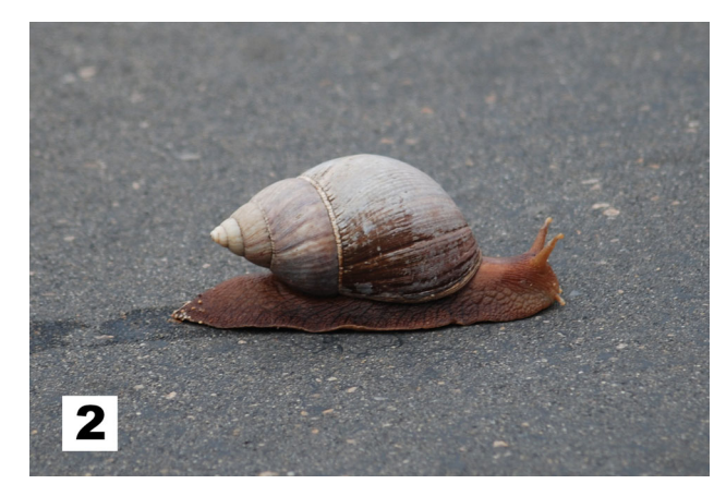
Figure 2. Adult Achatina land snail, Skukuza, Kruger National Park.

Africa; NMNH - National Museum of Natural History, Smithsonian Institution, Washington, D.C., USA; TMSA - Transvaal Museum, Pretoria, Republic of South Africa.