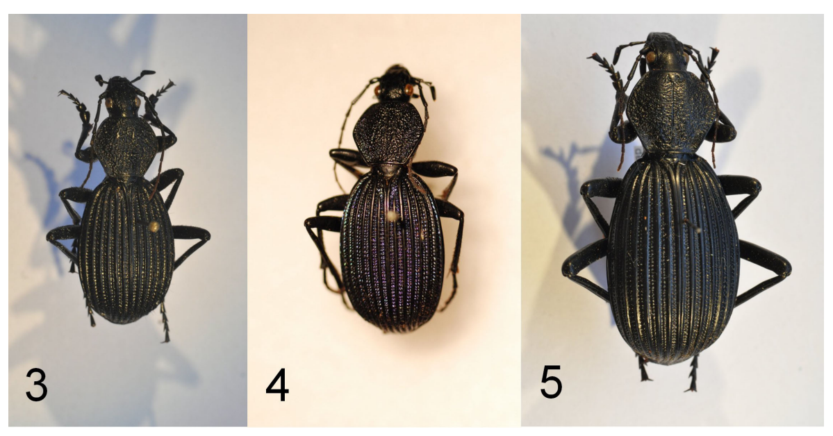
Figures 3-5. Adult males of Tefflus spp. 3) Tefflus carinatus carinatus , Ndumu, KwaZulu-Natal Province, South Africa. 4) Tefflus carinatus carinatus , Nelspruit, Mpumalanga Province, South Africa. 5) Tefflus meyerlei delagorguei , Loskop, Mpumalanga Province, South Africa.

Historical record from South Africa. "Transvaal" (Basilewsky 1946). The species has also been recorded from present-day Democratic Republic of the Congo, Malawi, Mozambique, Tanzania, and Zimbabwe (Basilewsky 1946).