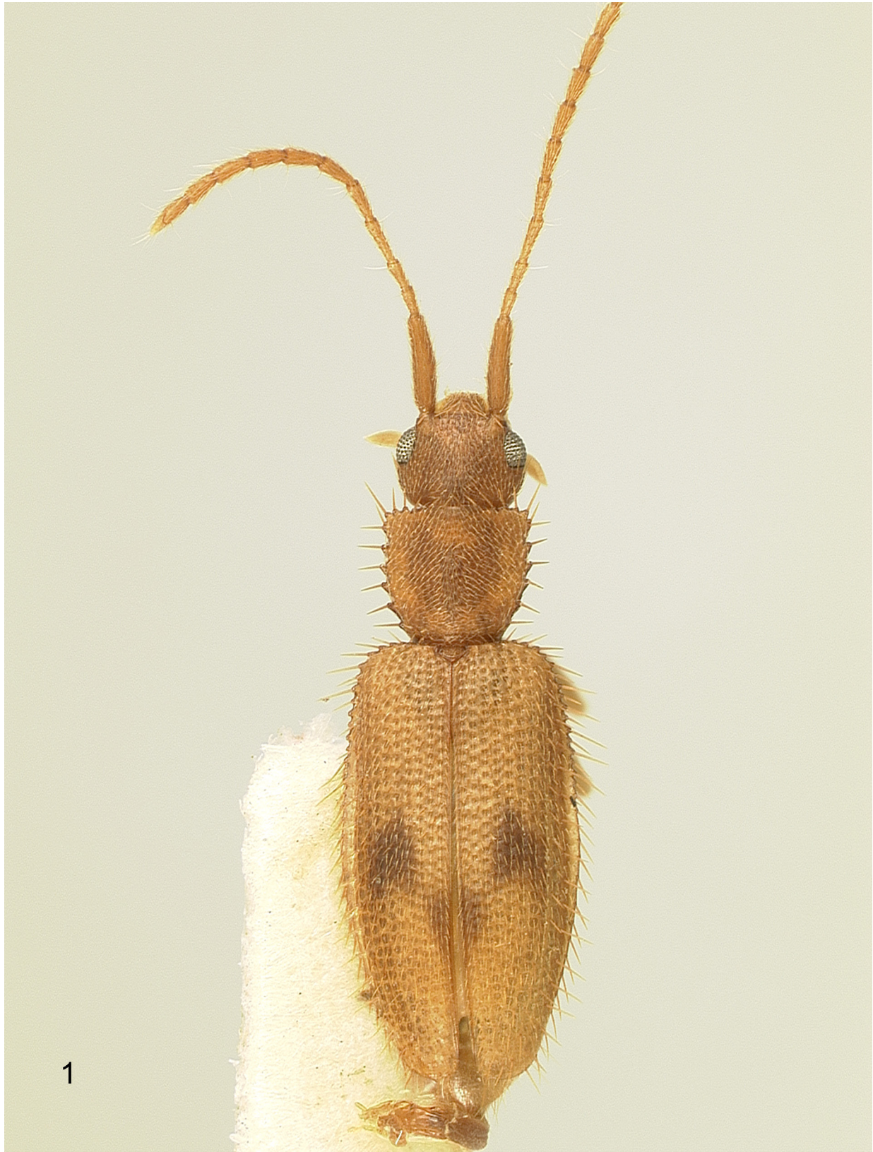
Figure 1. Telephanus serratus Nevermann, habitus.