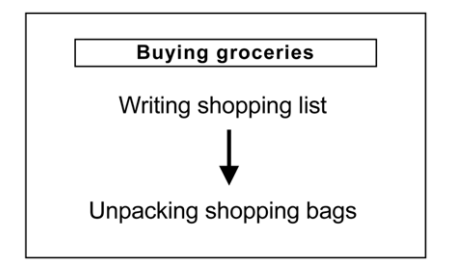
Figure 1. Example of a script card in the script-generation task. Note. The heading indicated the theme of the script. The upper event was always a starting item, the lower event was the ending item of the script. The arrow indicates how the participant had to generate the script: downward direction = chronological order (as shown); upward direction = inverse temporal order (not shown). Cards remained visible during script generation. A sample answer of the depicted script "buying groceries" in chronological order could have been: 1) going to the grocery store by car, 2) getting a shopping cart and entering the grocery store, 3) putting groceries into the shopping cart, 4) looking for a register, 5) getting in line, 6) paying at the register, 7) putting the groceries into shopping bags, 8) putting bags into the car, 9) driving home, 10) unloading shopping bags from the car. doi:10.1371/journal.pone.0026140.g001

Data analyses. The script generation task had a 2 (familiarity) \times 2 (order) \times 2 (group) factorial design with order (chronological,