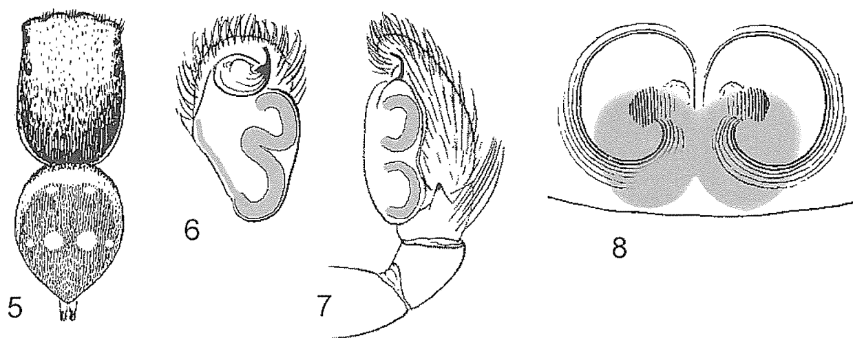
Figures 5-8. Naphrys acerba . 5. male dorsal habitus. 6-7. left palp: 6. ventral view. 7. retrolateral view. 8. epigynum (modified after Peckham & Peckham 1909).

Etymology: A combination of the country which seems to be the center of origin of the genus (Mexico) and the Greek compounding form -gonos (in its latinized form) meaning "born," i.e., born in Mexico; gender is masculine.