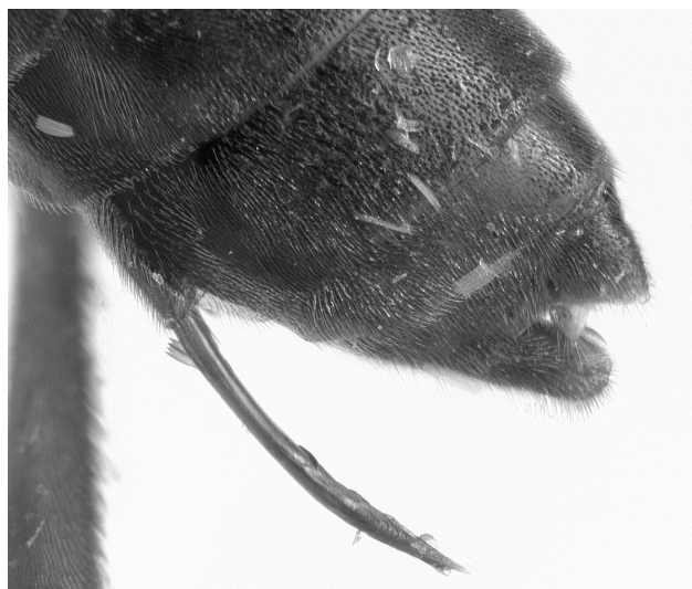
Figure 3. Labium wahli , female holotype. Lateral view of apex of gaster, showing structure of the (displaced) ovipositor.