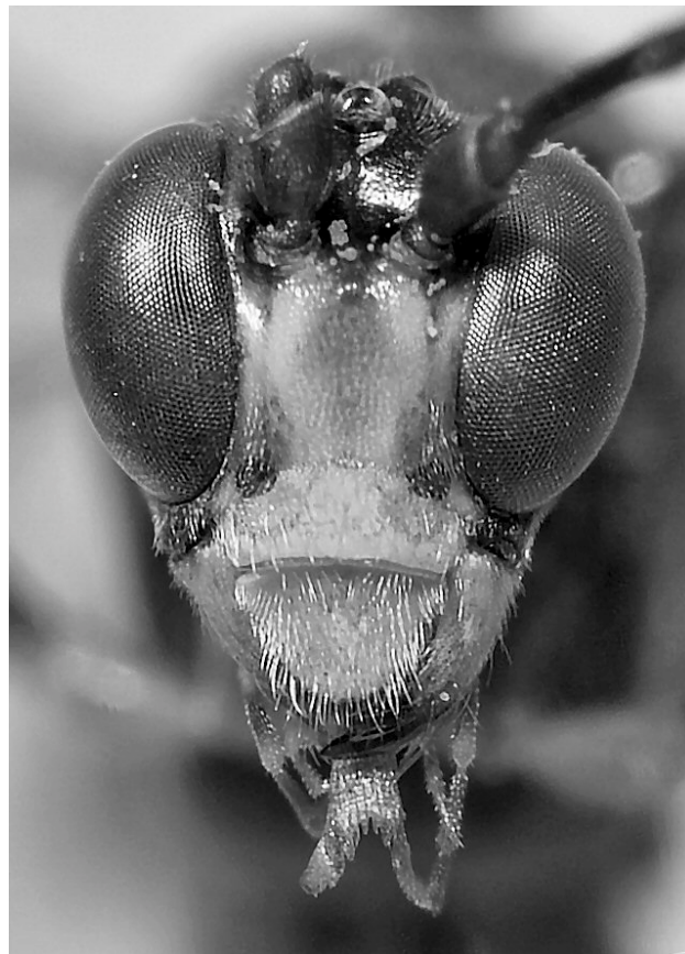
Figure 1. Labium wahl , female paratype. Front view of head showing large exposed labrum, clypeus, and mouthparts.

Length of fore wing: 9.4 mm. Flagellum: very long, 0.9 as long as fore wing, only faintly enlarged toward apex, with 35 segments; 1st flagellomere 3.6 as long as deep at apex and 1.5 as long as 2nd flagellomere. Mandible: elongate, gradually tapered toward apex, with upper tooth strong and elongate but lower tooth very short, less than 0.5 as long as upper.