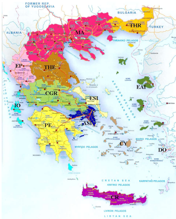
Figure 1: Map of different geographical regions in Greece.

idae – 1, Uloboridae – 1, Nesticidae – 4, Theridiidae – 4, Anapidae – 1, Linyphiidae – 16, Tetragnathidae – 4, Araneidae – 1, Lycosidae – 1, Agelenidae – 21, Amaurobiidae – 4, Gnaphosidae – 6, Philodromidae – 1, Thomisidae – 2, Salticidae – 2 (Table 1). One species is new for the Greek spider fauna: Porrhomma convexum (Westring, 1861) (marked in the list with *), a spider with a Holarctic distribution and widespread in European caves. It is also well represented in the caves of the Balkan Peninsula – and not only established in the caves of Croatia, Romania and Turkey (DELTSHEV 2008). The number of species is high and represents about 13 % of the Greek spiders. This is also evident from a comparison with the number of cave-dwelling spiders recorded from the other countries of the Balkan Peninsula: Bulgaria – 99, Croatia – 63, Serbia – 59, Bosnia and Herzegovina – 52, Macedonia – 44, Montenegro – 44, Slovenia – 43, Albania – 10, Turkey – 8, and Romania – 4 (DELTSHEV 2008). The established number of species, however, depends not only on the size of the regions, but also on the degree of exploration. The most characteristic are the families: Leptonetidae (8.2 %), Pholcidae (9.2 %), Dysderidae (11 %), Linyphiidae (14.6 %), and Agelenidae (19.2 %). The families with largest number of anophthalmic species are Leptonetidae