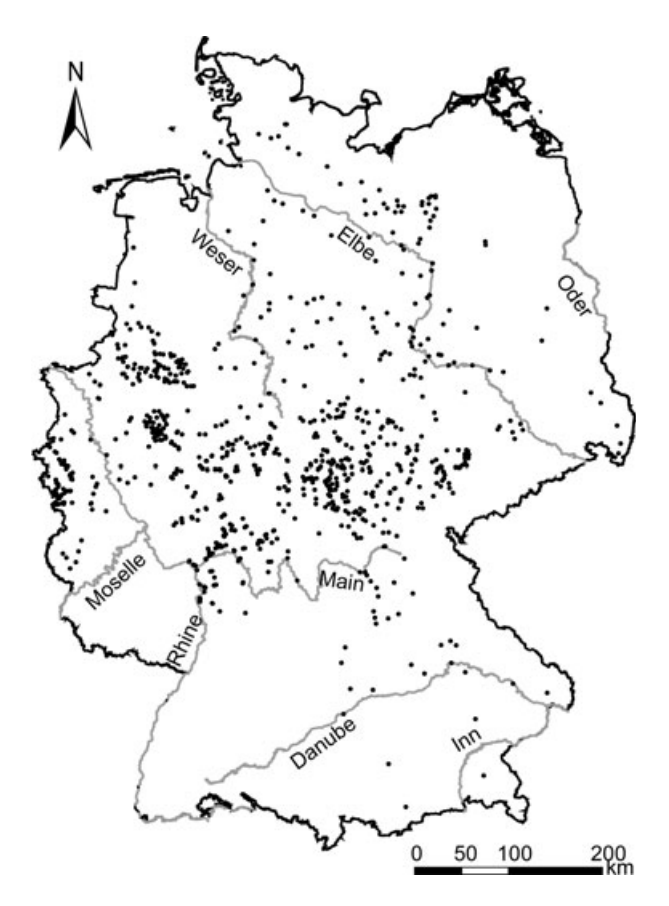
Figure 1. Map of the location of the 981 sampling sites located in small to large rivers in Germany. Additionally, the eight largest German rivers are indicated in the map.

The species were classified as indigenous species or alien species based on the species list published by