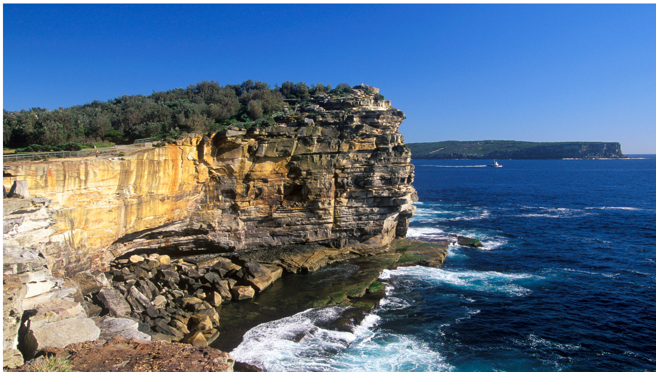
Fig. 2. The entrance to Sydney Harbour, looking from South Head with heath perched above its sandstone cliffs, across to North Head, the largest Sydney Harbour National Park precinct.

The species are not distributed evenly between the seven geographical precincts of the Park. A few species are found in all subregions, many are found at only one (Appendix 1). Though only 2 species, Banksia integrifolia and Allocasuarina distyla , have been recorded at all seven precincts, 62 species (15% of the total list) were recorded to occur at 5,