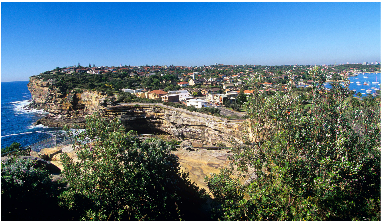
Fig. 5. There are spectacular views over the ocean and harbour from of the tracks and lookouts in Sydney Harbour National Park such as from Watsons Bay near South Head.

For its size Sydney Harbour National Park has a rich diversity of plant species. The list of 416 native species from a 400 ha area is high; compare with Lane Cove National Park with 520 species in 600 ha (Kubiak 1983) or Ku-ring-gai Chase National Park with 566 spp in about 15 000 ha (Thomas & Benson 1985). Sydney Harbour also includes some rare species and locally restricted species, while clues in the lists also highlight the close relationship between native species and habitats, particularly through the fine geological and geomorphic variation originally evident in the landscape. Sydney Harbour National Park is a good example of the coastal sandstone parks of the Sydney Basin, and although its coastal landscape is less extensive than the larger Ku-ring-gai or Royal National Parks, it includes a range of vegetation types similar to the other Parks, and is more accessible.