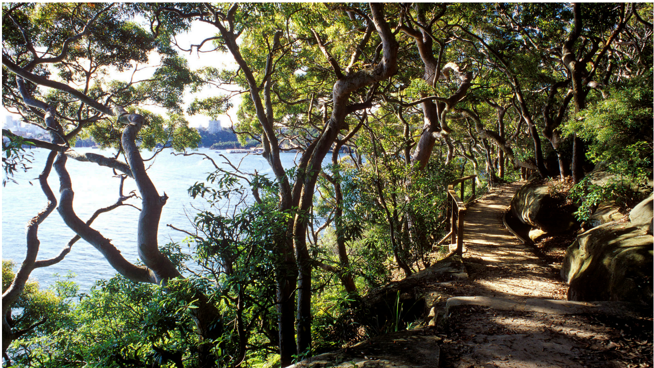
Fig. 3. A well-constructed track leads through Angophora costata woodland on sheltered harbour headland of Bradleys Head.

Changes over the last 100–150 years have clearly influenced the native flora. The clearing and sandstone earthworks associated with the 19 th Century gun emplacements and fortifications, clearly destroyed local vegetation but the absence of exotic species would have allowed native species to colonise disturbed areas or persist in remnant bush, and subsequently recolonise when the areas became parkland. However with the development of adjacent suburbs such as Mosman in the early 20 th Century, propagules of exotics of garden origin would have become available.