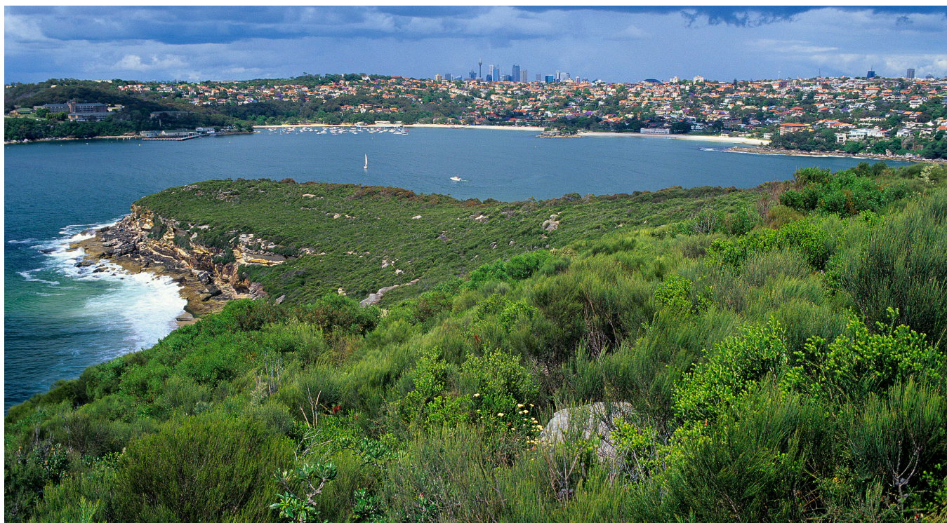
Fig. 4. One of the largest precincts of Sydney Harbour National Park, Dobroyd Head has extensive areas of coastal sandstone heath; shrubs of Allocasuarina distyla and Banksia serrata predominate in the foreground.