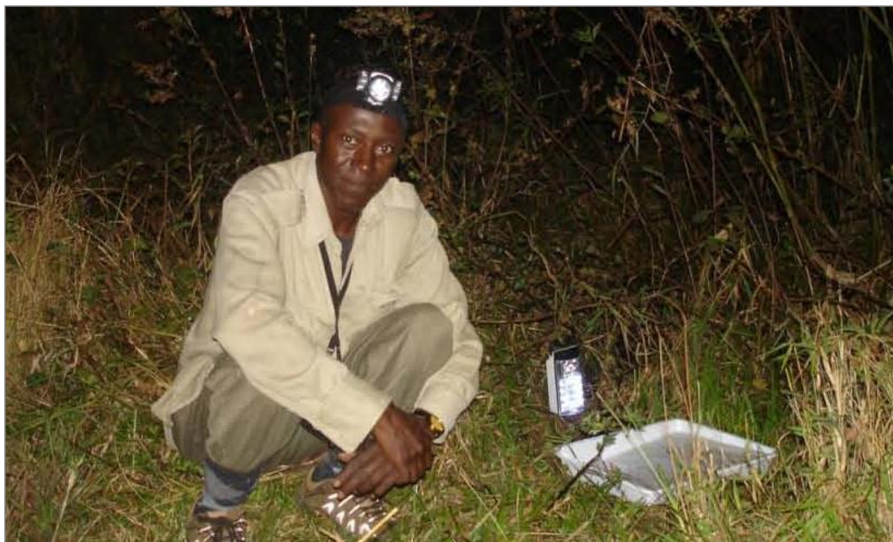
Figure 2. The design of the light traps (picture also shows the primary investigator).

of preservation. Immature specimens were generally identified by the body colour and intensity of the pruinescence on the abdomen, in combination with the hardness of the wing membrane. No detailed discussion was made on these results