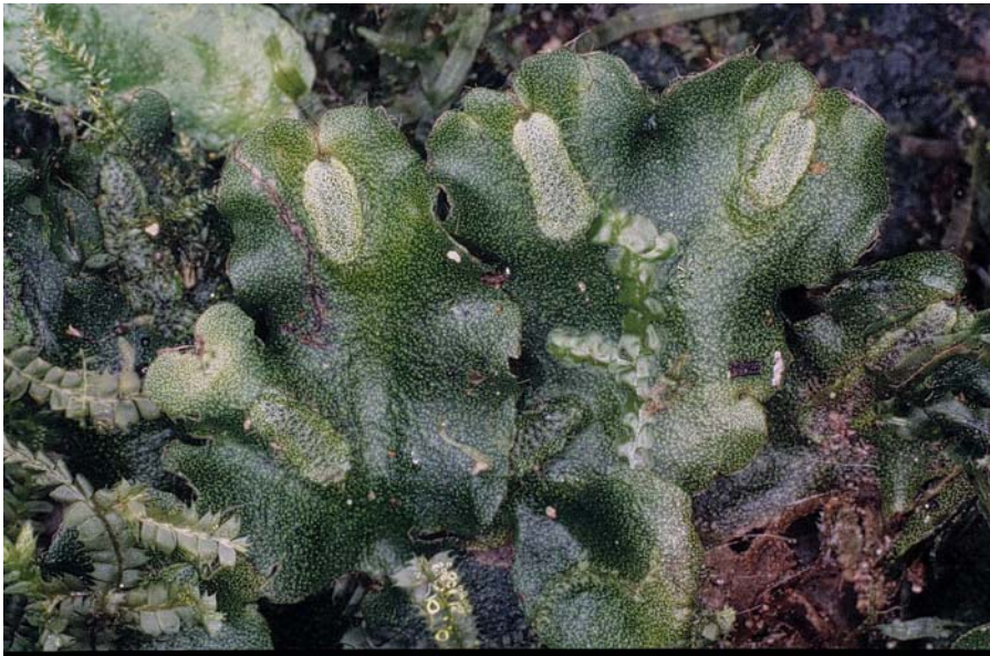
6. Male plants of the thallose liverwort Monoclea gottschei . With a length of up to 20 cm, this species is one of the largest liverworts in the world.