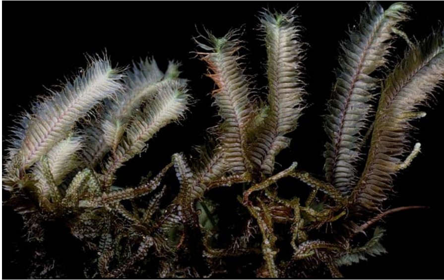
5. A species of Bazzania , a genus of liverworts characteristic for the montane rain forests.