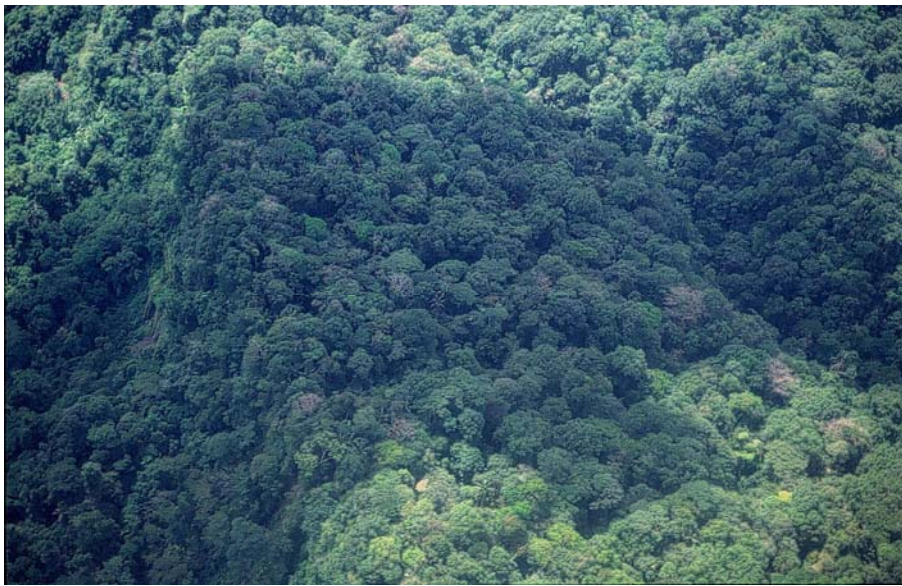
2. The dense, almost undisturbed lowland forest from the plane. Large parts are (still) not accessible by roads and only inhabited by a few indians.