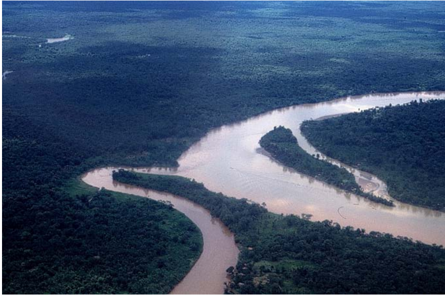
1. The lowland forest with Rio Atrato.