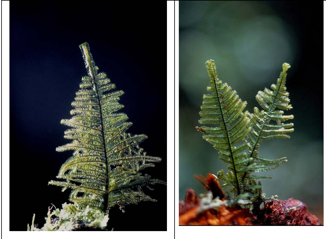
13. The liverwort Fulfordianthus pterobryoides is one of the 4 liverwort species known to be endemic to the Chocó regions. It grows on twigs of treelets in the understorey.