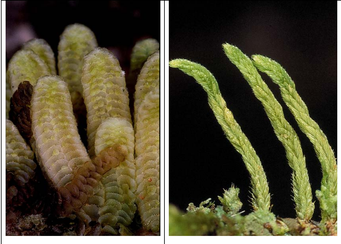
12. Left: Cyclolejeunea produces lentiform broodbodies, which have a sticky surface and are glued on the smooth surfaces of other leaves. Right: The moss Orthostichopsis tetragona characteristically grows on twigs in the canopy.