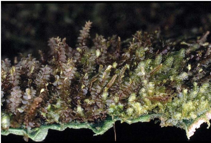
7. Epiphyllous liverworts growing on a leaf in the understory of the Chocó rainforest. The surface of the leaf is densely covered with liverworts as seen from aside. Whereas epiphyllous liverworts usually grow prostrate on the leaves, the liverworts in the Chocó region grow upright because of the high humidity.