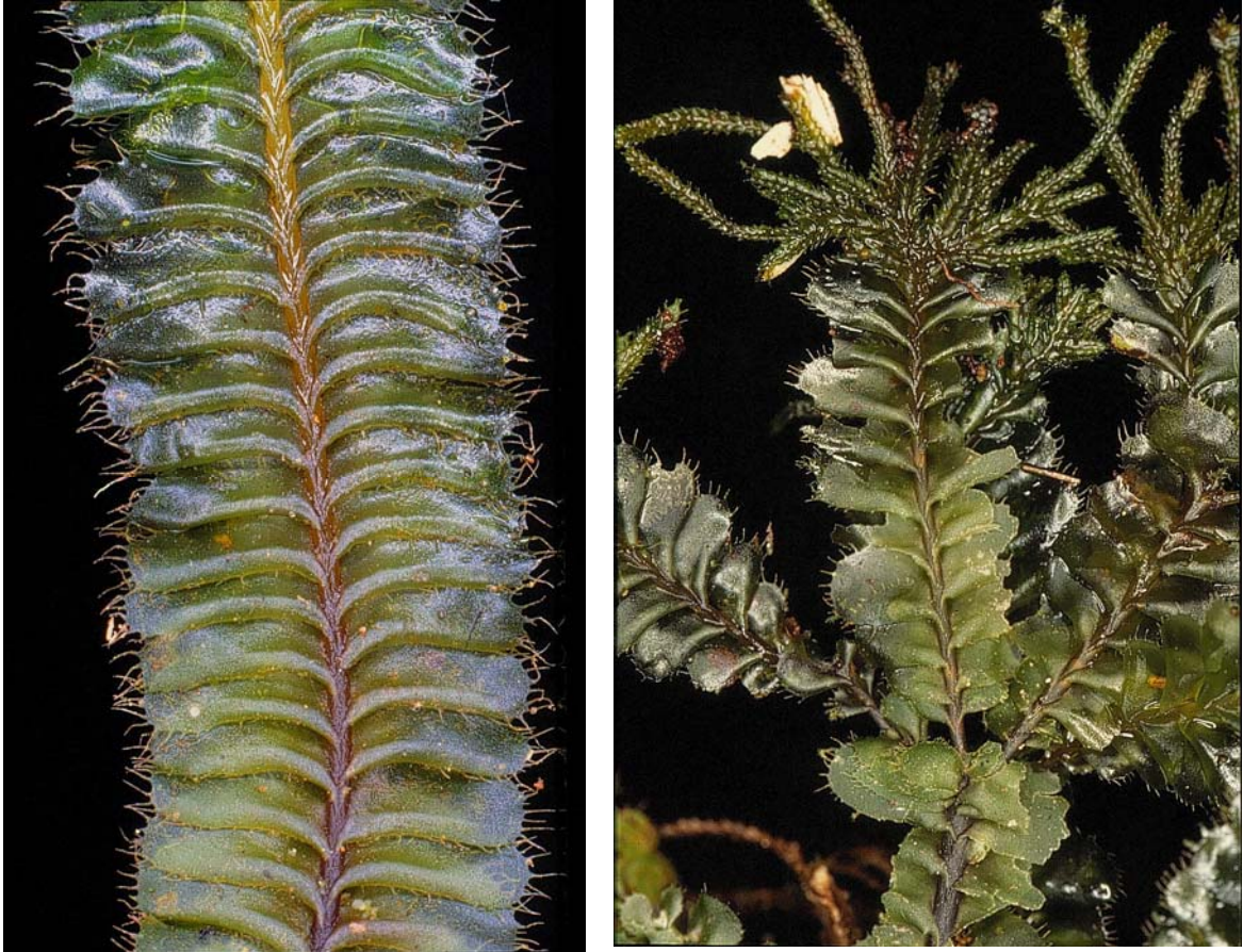
9. Plagiochila is one of the species richest liverwort genera in the Neotropics. Left: Plant of Plagiochila macrotricha . The leaf borders are longly ciliate and seem to function for condensation of water. Right: Male plants of Plagiochila spec. with microphyllous branches bearing the male sex organs (antheridia).