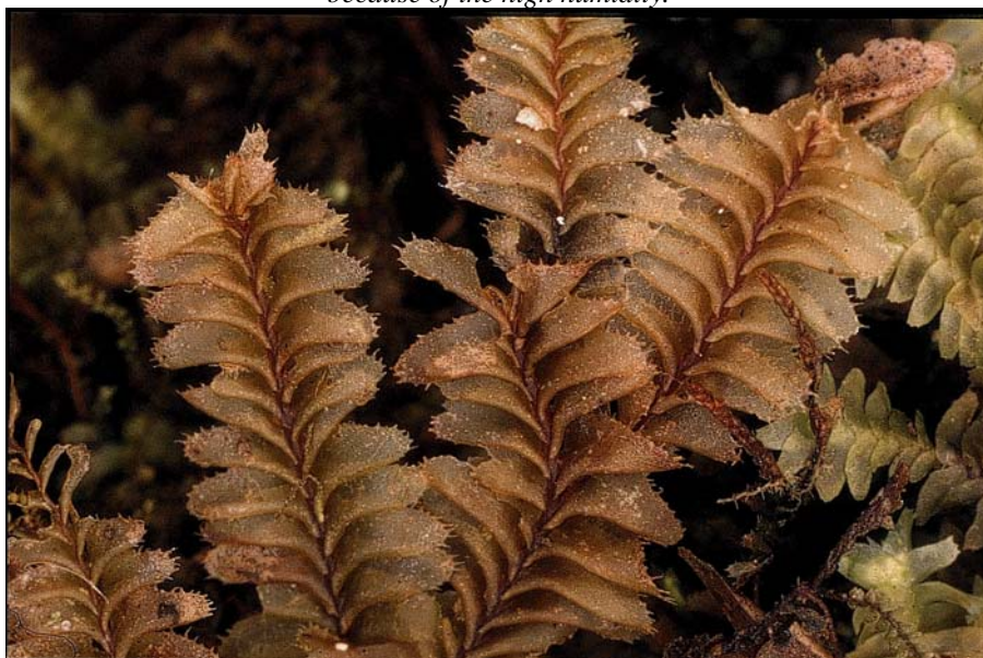
8. A species of Plagiochila with brownish tinge.