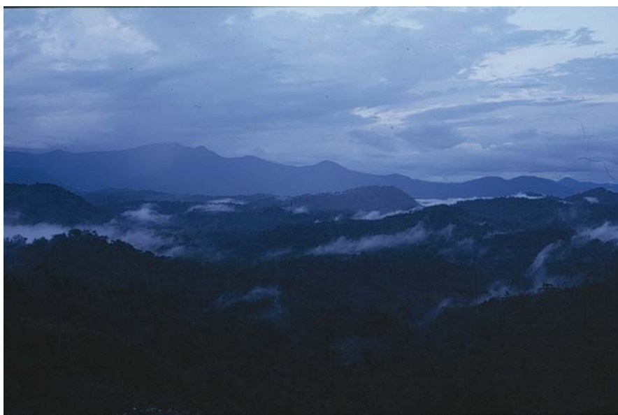
4. Steaming humidity is characteristic for the Chocó region.