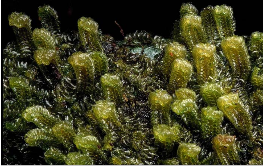
10. Cyclolejeunea peruviana growing in dense mats on a leaf.