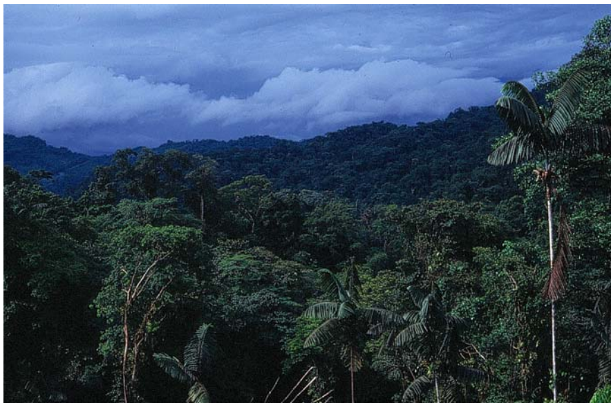
3. Pacific slope of the Andes of the Chocó region.