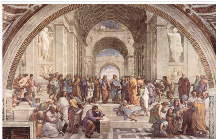
Experts: the dream

Given such phenomena as the dramatic leaks of the last decade, the vibrant and inflammatory discourse about 'cyberwar' and the conflation of the Anti-Counterfeiting Trade Agreement with the 'backbone of the European economy', regulation of what the Internet is supposed to be and what people are allowed to do in it is always and everywhere about security, whether users like it or not. And that regulation comes from people, special people we like to think of as experts.