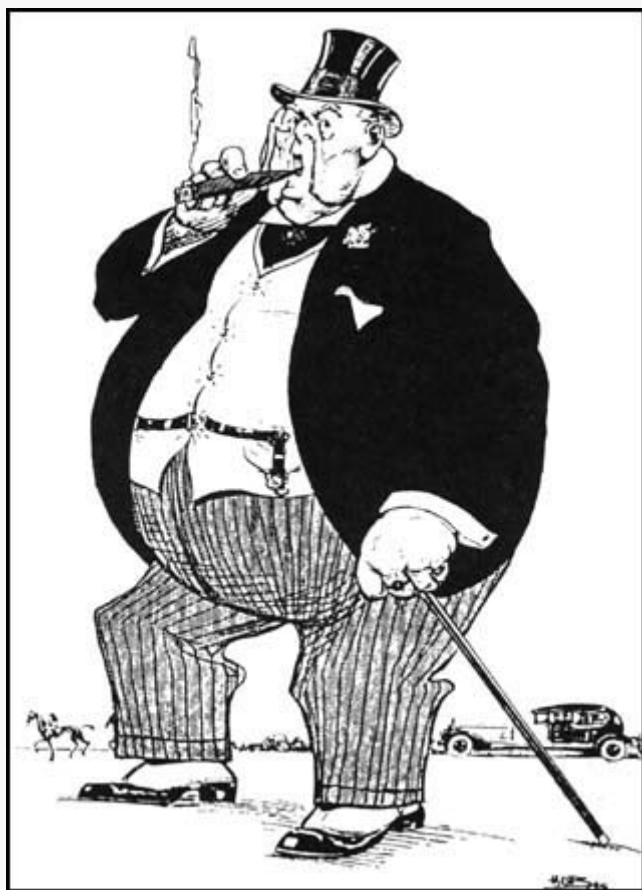
Experts: the reality

*There is a vain tendency in the discipline of International Relations for its self-assigned members to write the term with capital letters, reserving lower-case letters, i.e. 'international relations', for what actually happens between states in the world – things like war, structural adjustments, arms sales, and – less frequently – arms control.