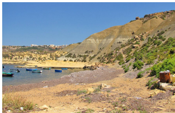
Fig. 5: Locality of Menemerus fagei .