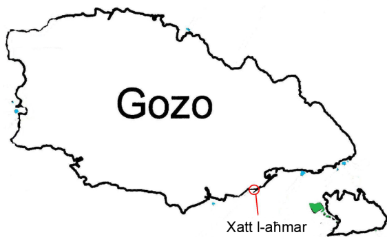
Fig. 4: Map of Gozo with collection area.