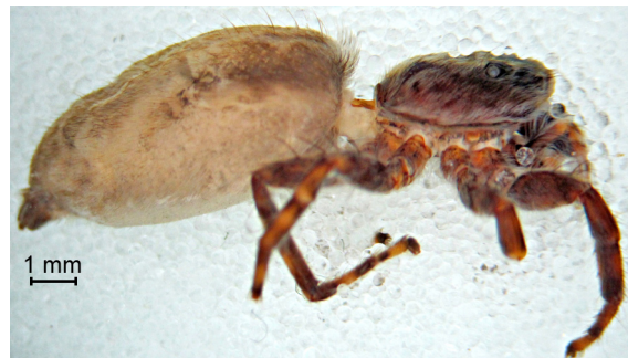
Fig. 2: Menemerus fagei , habitus lateral. – Photo: M. Freudenschuss