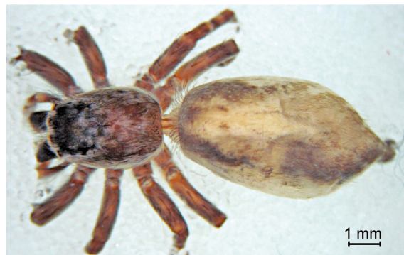
Fig. 1: Menemerus fagei , habitus dorsal.

(Fig. 4), 15 m a.s.l., Xatt l-Ahmar pocket Beach, under Limbarda crithmoides in a clayish habitat (Fig. 5), M. Freudenschuss det., W. Wesołowska vid.