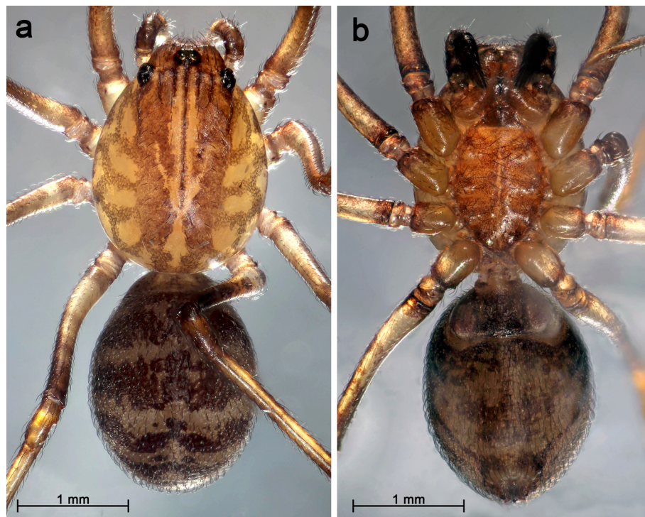
Fig. 4: Juvenile habitus of Scytodes fusca . a) dorsal view; b) ventral view.

Mello-Leitão 1918). Besides the tropics, it was also introduced to less suitable regions like the Nearctic (Paquin et al. 2008) and Palearctic (Wang et al. 1985, Ono 2009, Cardoso 2011), although it appears restricted here to Botanical Gardens (Singapore: Brignoli 1976; Slovakia: present paper) and similar artificial tropical ecosystems (Canada: Paquin et al. 2008; Germany: present paper). Van der Hammen (1949) found a single specimen of a