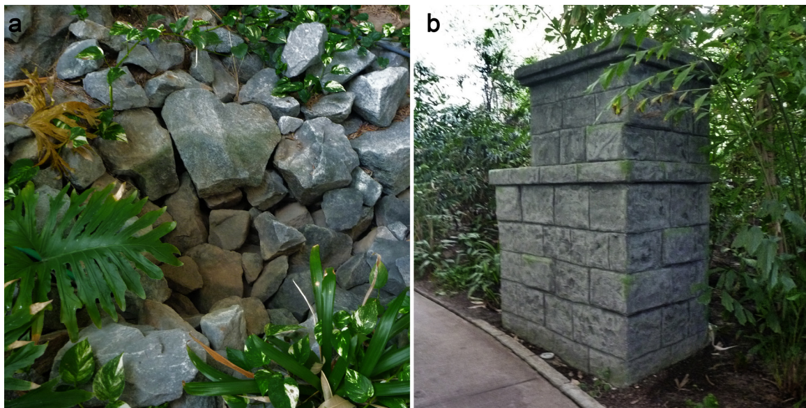
Fig. 6: The specific habitat in the artificial tropical ecosystems of “Tropical Islands”, Krausnick (Germany). a) stones; b) stone sculpture.

tion about the habitat preferences of the Portuguese specimen were not published, we found that it was collected living in low garrigue vegetation near Monte Gordo in the Algarve during April, 1982 (Murphy pers. comm.). Moreover, Murphy mentioned he collected this species in many countries with a similar habitat to that in Portugal in the Mediterranean region, but never published these records. Thus a revision of the records of the similar-looking species S. velutina should be undertaken. Specimens from Slovakia were found numerously in only one of the three tropical rooms of the greenhouse. The primary reason for this could be the presence of stones around the paths, as these were missing in the other rooms. Brief observations in other Botanical Gardens in Košice and Brno suggested an absence of this species. Although both gardens had a factor in common – too few stones – the real reason could be simpler: the species S. fusca was never introduced there.