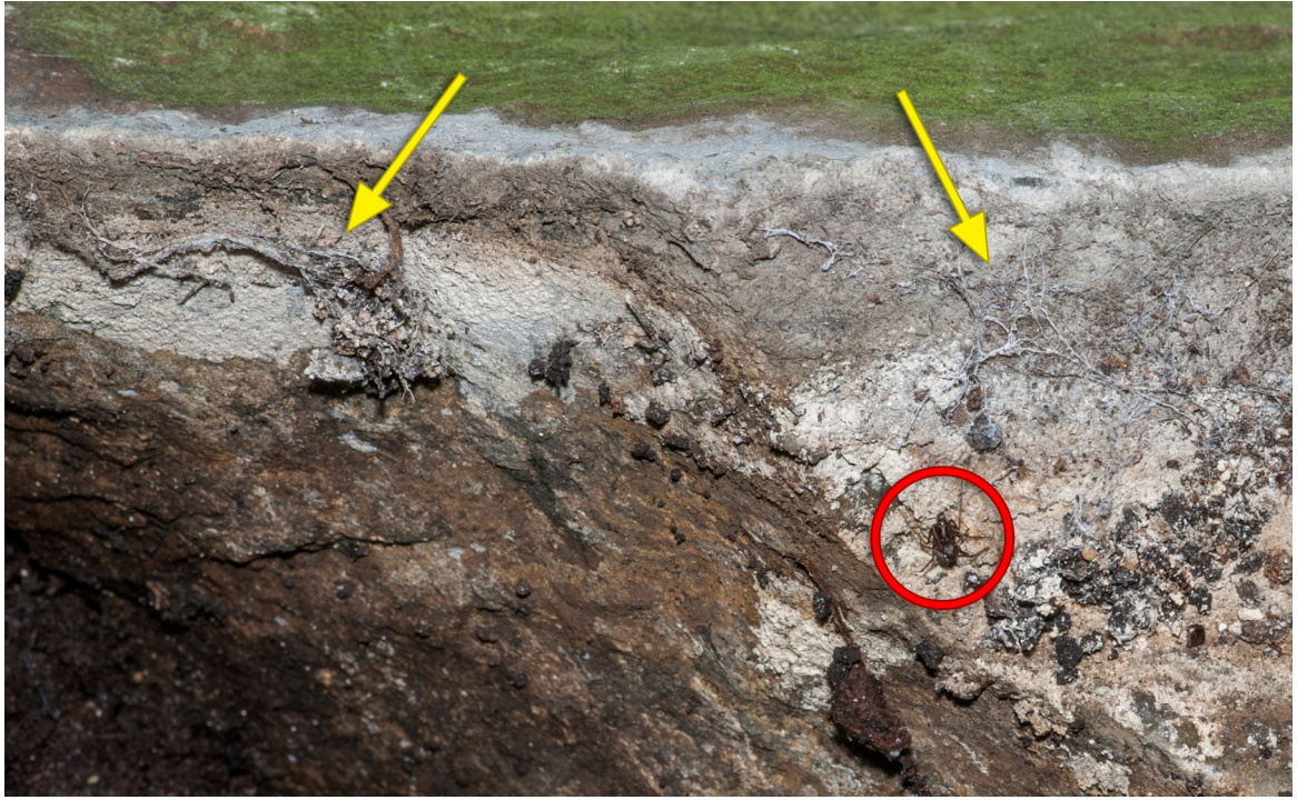
Fig. 5: Underside of a stone showing one female of Scytodes fusca (circle) with two webs (arrows) belonging to female and juvenile.

Scytodes species, identified as S. fusca , in the greenhouse of the Botanical Garden in Leiden (the Netherlands). According to van Helsdingen (1999) it was misidentified with S. venusta . This species has never been found again in the Netherlands (van Helsdingen pers. comm.).