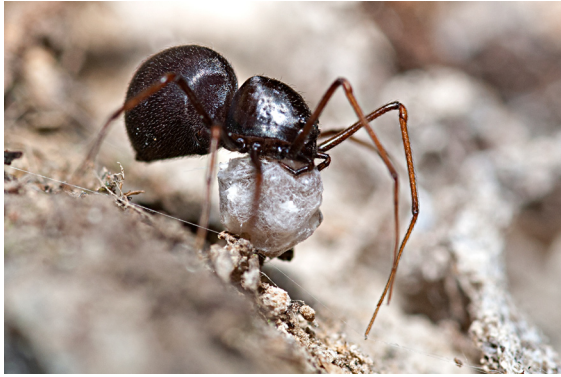
Fig. 1: Female of Scytodes fusca with egg sack.

and a Canon EOS 1100D digital camera connected to a Zeiss Stemi 2000-C stereomicroscope. Digital images were montaged and edited using Photoshop CS6. The material is preserved in 70 % ethanol and deposited in the The Western Slovakian Museum in Trnava and in the private collections of Nils Reiser and Jonathan Neumann. One female was sent to Arno Grabolle (Weimar) and one to Tobias Bauer (Stuttgart).