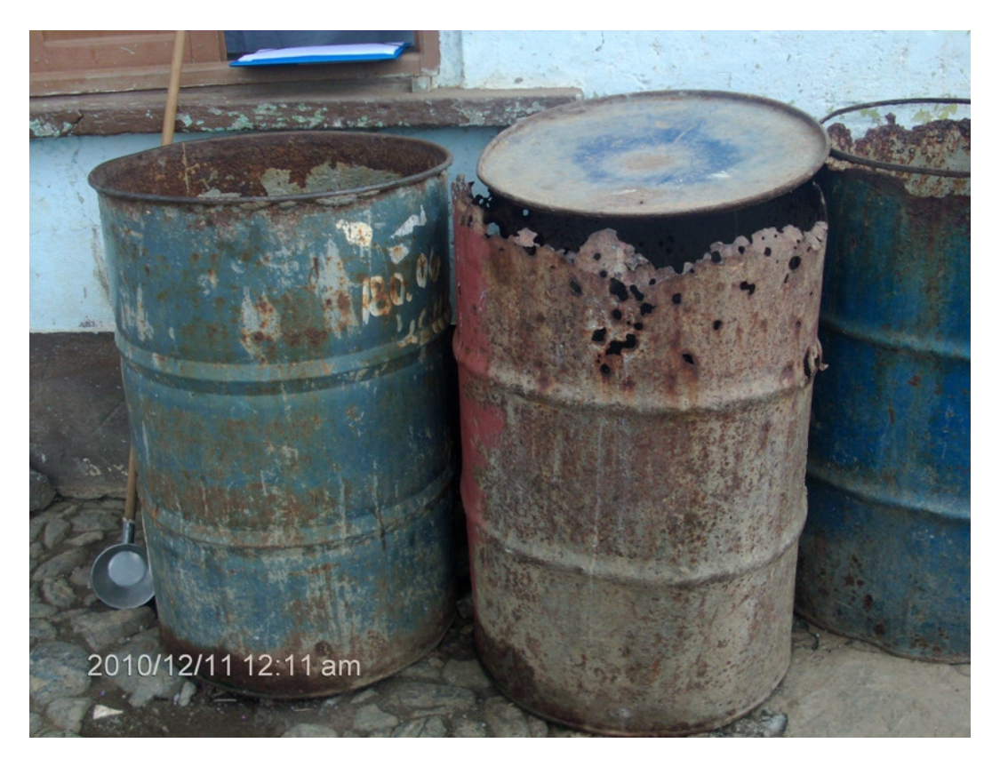
Fig. 3. Degraded drums, Achada Bel-Bel, Santa Cruz, Santiago, 11 December 2010.

Only two parameters evaluated in the logistic regression did not present any effect in container positivity. Container placement, when tested alone, showed no effect in container positivity (ANOVA, p>0.05), but in interaction with container type, a moderate significant effect was demonstrated (p<0.05). This interaction augments the drums oddsratio (OR) of 3.36 to 8.67, when compared with barrels (OR=1). We believe that this interaction is caused by socio-economic factors, because this interaction represents the number of containers indoors or outdoors of