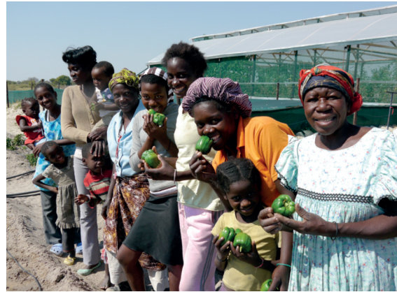
Figure 3: Harvest of green peppers at a rainwater harvesting site (village of Epyeshona, central-northern Namibia).