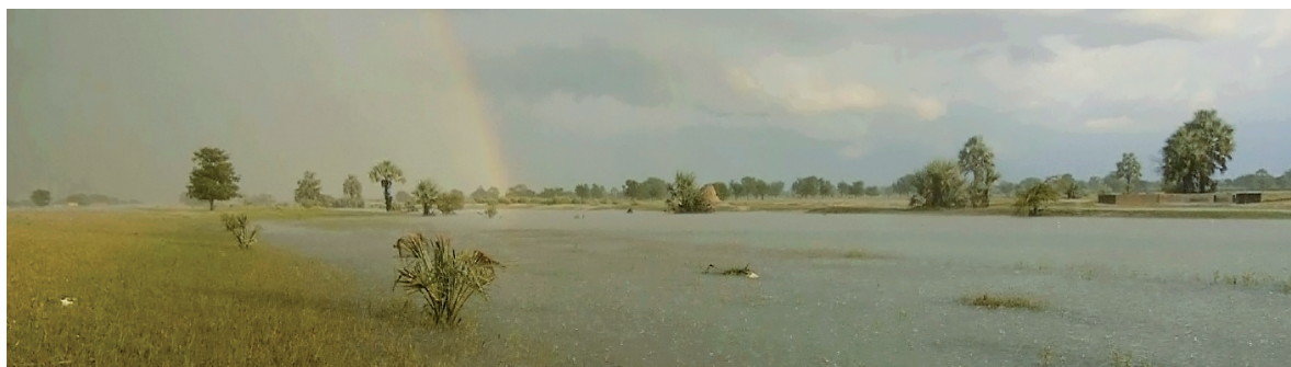
Figure 1: Ephemeral river during the rainy season (Oshana) in central-northern Namibia