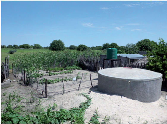
Figure 2: Rainwater harvesting facilities with tank, greenhouse, field and drip irrigation system. The rain is collected from the roof of a house and piped to the tank (village of Epyeshona, central-northern Namibia).