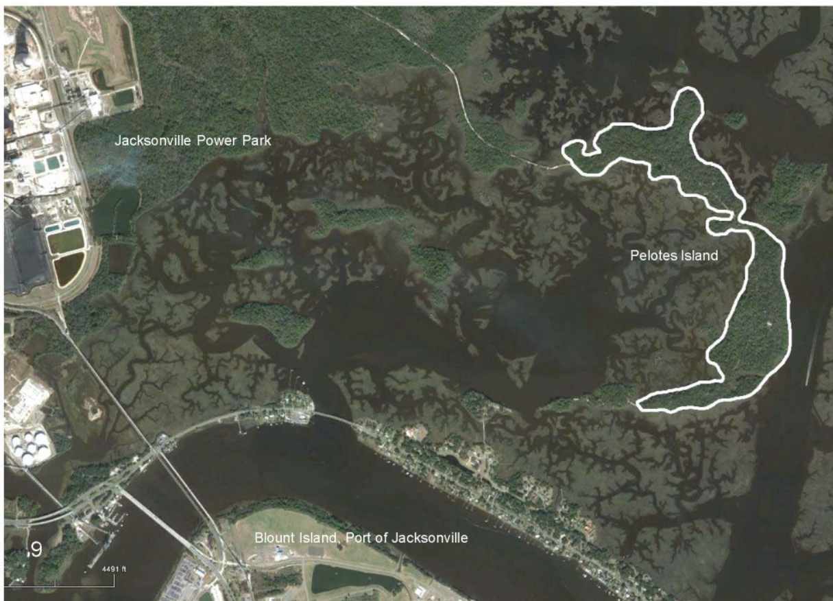
Figure 9. Google Earth image of Pelotes Island (outlined in white) and vicinity.

Chrysobothris scitula Gory. Alachua Co., Gainesville, Univ. of Florida, 6-10-V-2010, in burrow of Cerceris fumipennis , A.J. Silagyi, D. Saeger (1); Leon Co., Tall Timbers Research Station, Malaise trap #2, "06-8-20-1993" (1).