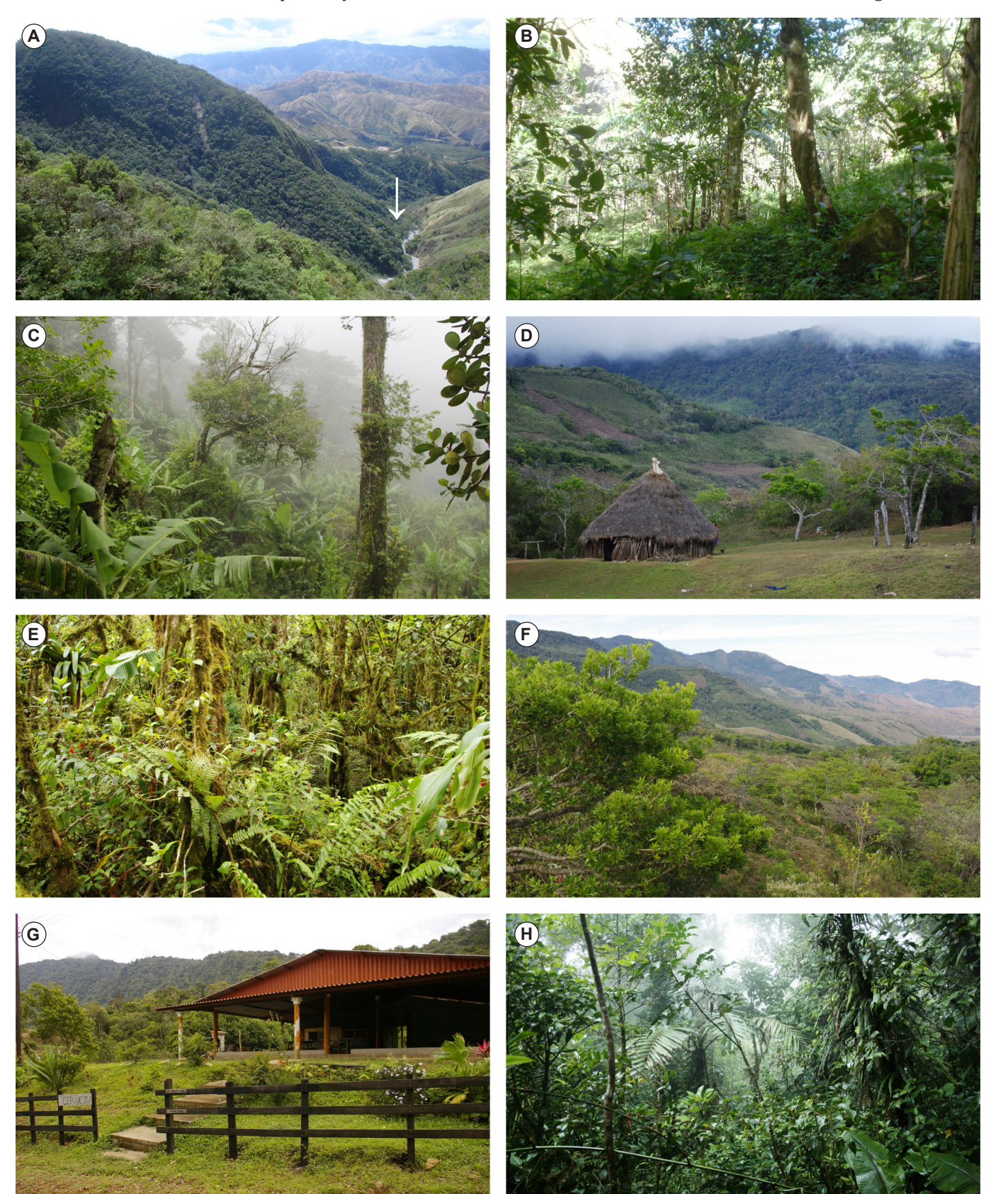
FIGURE 3. Habitats of Anolis gruuo along the Serranía de Tabasará in western Panama: (A) view over headwaters of Río San Félix, arrow indicates type locality at 900 m; (B) coffee plantation at type locality; (C) mixed vegetation along road to Cerro Colorado north of Hato Chamí, 1480 m; (D) looking north into the valley of Río Rey from the road leading to Buabidí at approximately 900 m; (E) forest along trail to Río Rey near Quebrada Ardilla; (F) looking east along the Serranía de Tabasará from Buabidí, 1240 m; (G) Restaurant at Alto de Piedra, 860 m, the easternmost and lowest locality for A. gruuo , with Cerro Mariposa in the background; (H) forest on Cerro Mariposa, 1280 m.

The known range of Anolis gruuo stretches over 80 airline km from 81°07'W to 81°50'W at premontane elevations between 860 and 1530 m along the Pacific