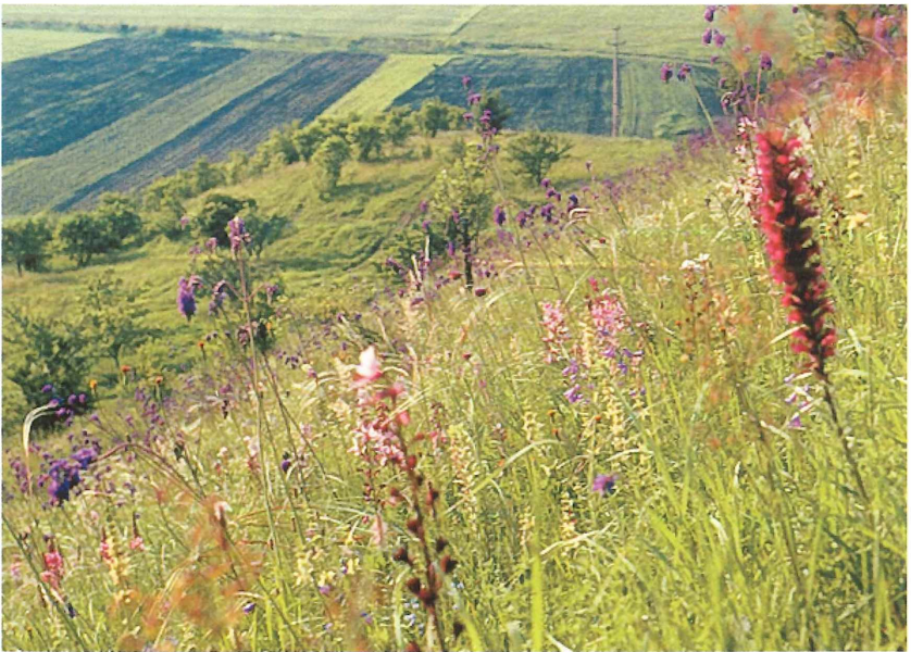
Fig. 3: Species-rich stand of the Stipetum pulcherrimae with Echium russicum , Salvia nutans , Dictamnus albus , Stachys recta , Verbascum phoeniceum , and Campanula sibirica near Mociu (Photo: Eszter Ruprecht, May 2001).