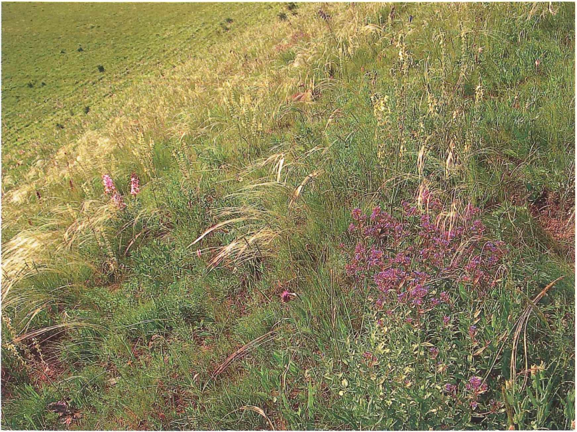
Fig. 2: Extensively grazed stand of the Stipetum lessingianae with Nepeta ucranica near Valea Florilor (Photo: András Kun, May 2003).