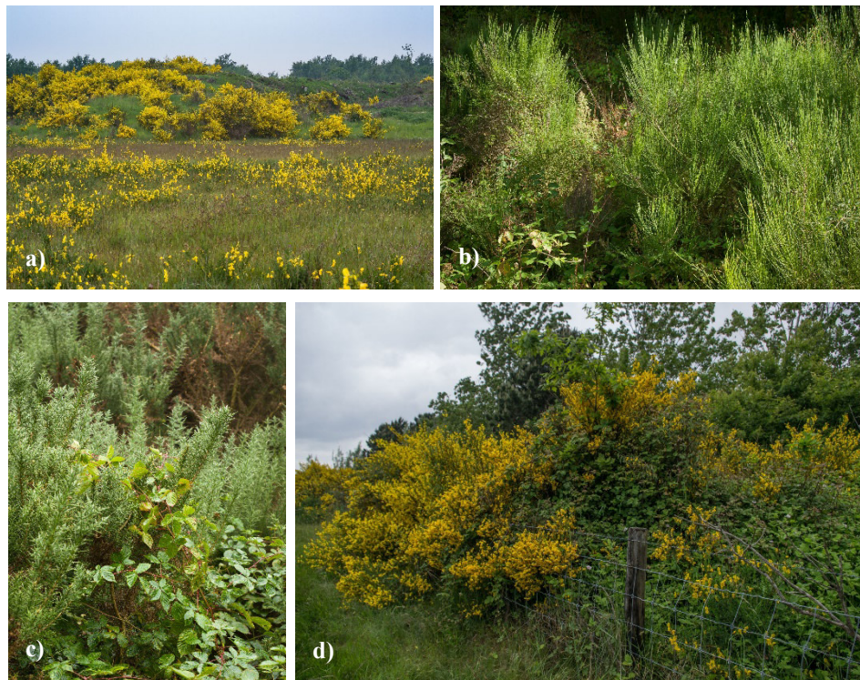
Fig. 2. (a) The Rubo plicati-Sarothametum scoparii at the military air base Woensdrecht. Cytisus scoparius is invading the Nardetea grassland in the foreground (Photo: R. Haveman); (b) the Crataego monogynae-Cytisetum scoparii with Rosa canina and Rubus macrophyllus in the 'Curfsgroeve' near Geulhem (Photo: I. de Ronde); (c) the Frangulo alni-Ulicetum europaei with Rubus plicatus at the A12 highway near Bennekom (Photo: I. de Ronde); (d) the Rubo ulmifoli-Ulicetum europaei with Rubus ulmifolius and Cytisus scoparius in the dunes near Vrouwenpolder (Photo: R. Haveman).