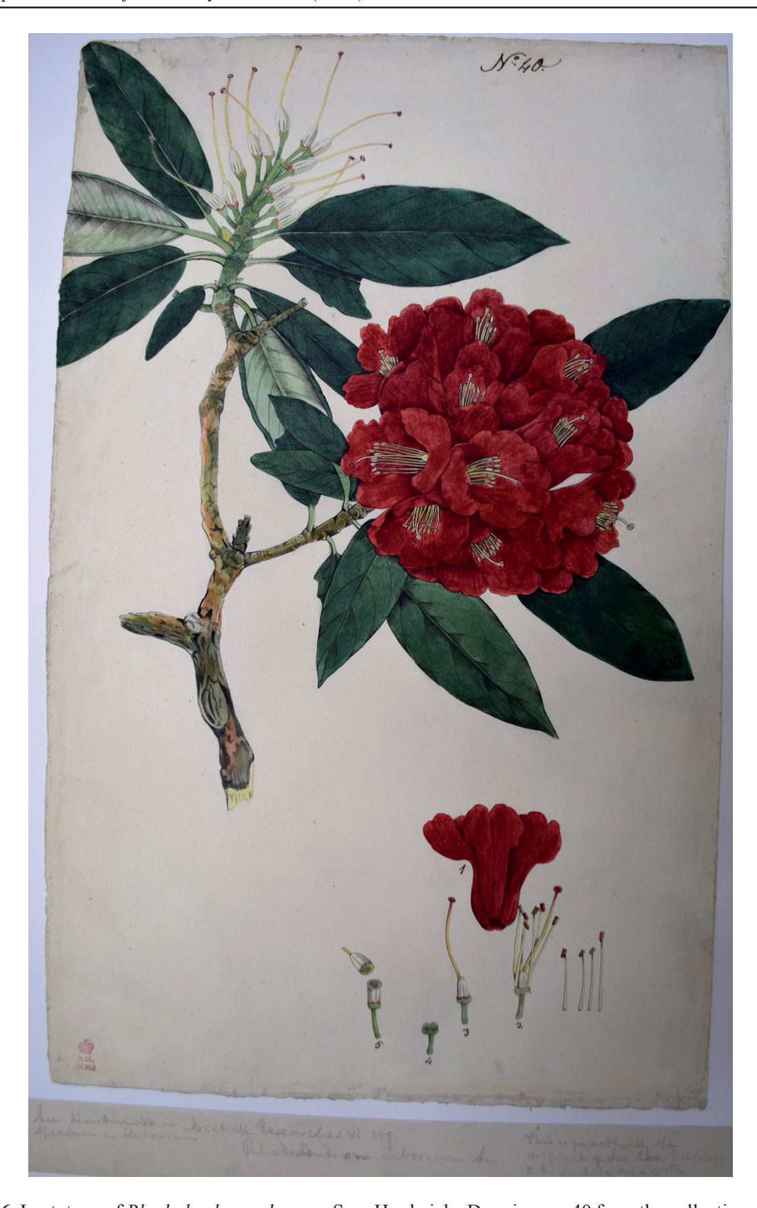
Fig. 6. Lectotype of Rhododendron arboreum Sm., Hardwicke Drawing no. 40 from the collection of the Botany Library, Natural History Museum.