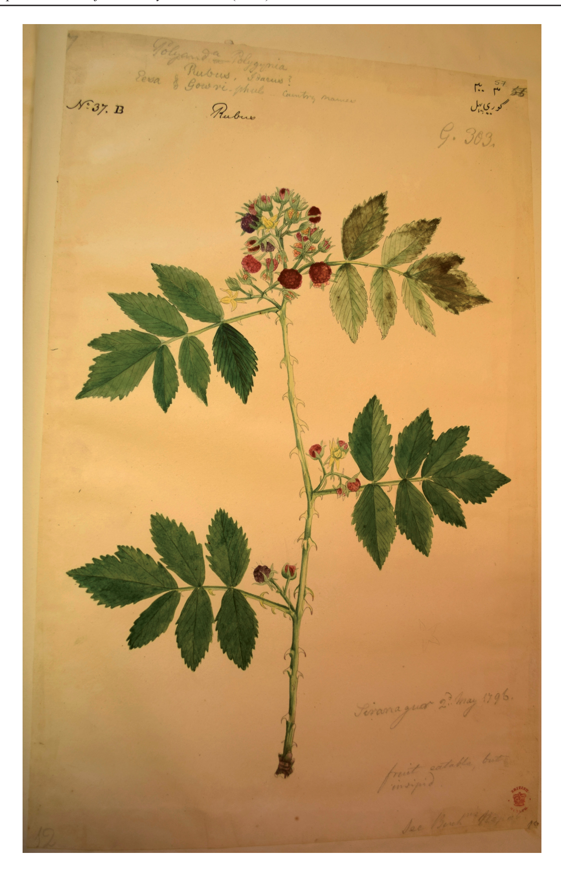
Fig. 9. Lectotype of Rubus rosiflorus Roxb., Hardwicke, Plants of India Vol. X (Add MS 11019): drawing no. 58. Reproduced with permission of the British Library Board.