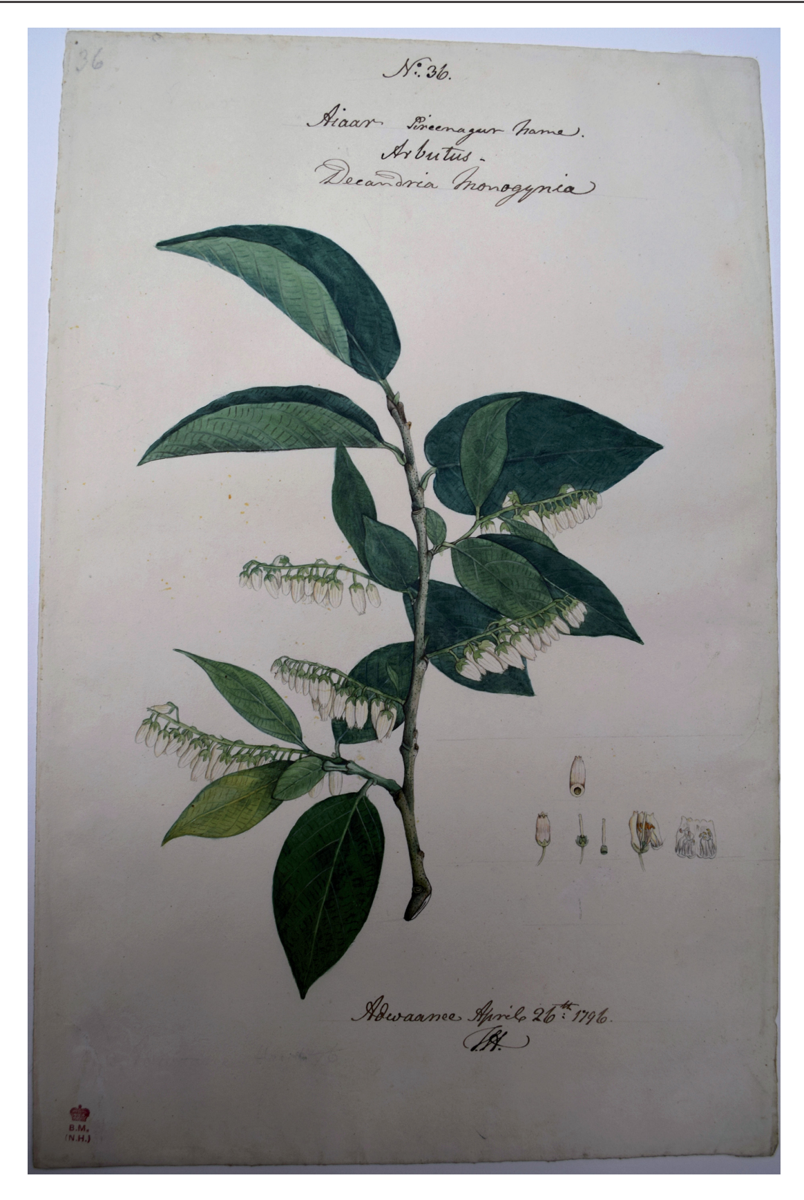
Fig. 8. Lectotype of Arbutus herpetica Coleb. ex Roxb., Hardwicke Drawing no. 36 from the collection of the Botany Library, Natural History Museum.