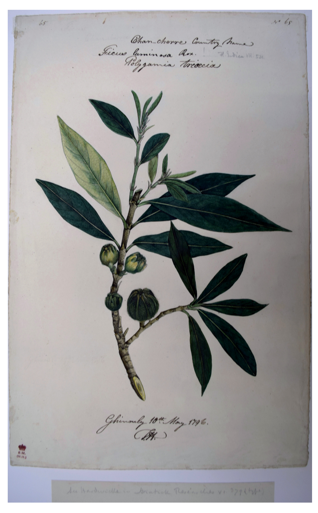
Fig. 5. Lectotype of Ficus laminosa Hardw., Hardwicke Drawing no. 65 from the collection of the Botany Library, Natural History Museum.