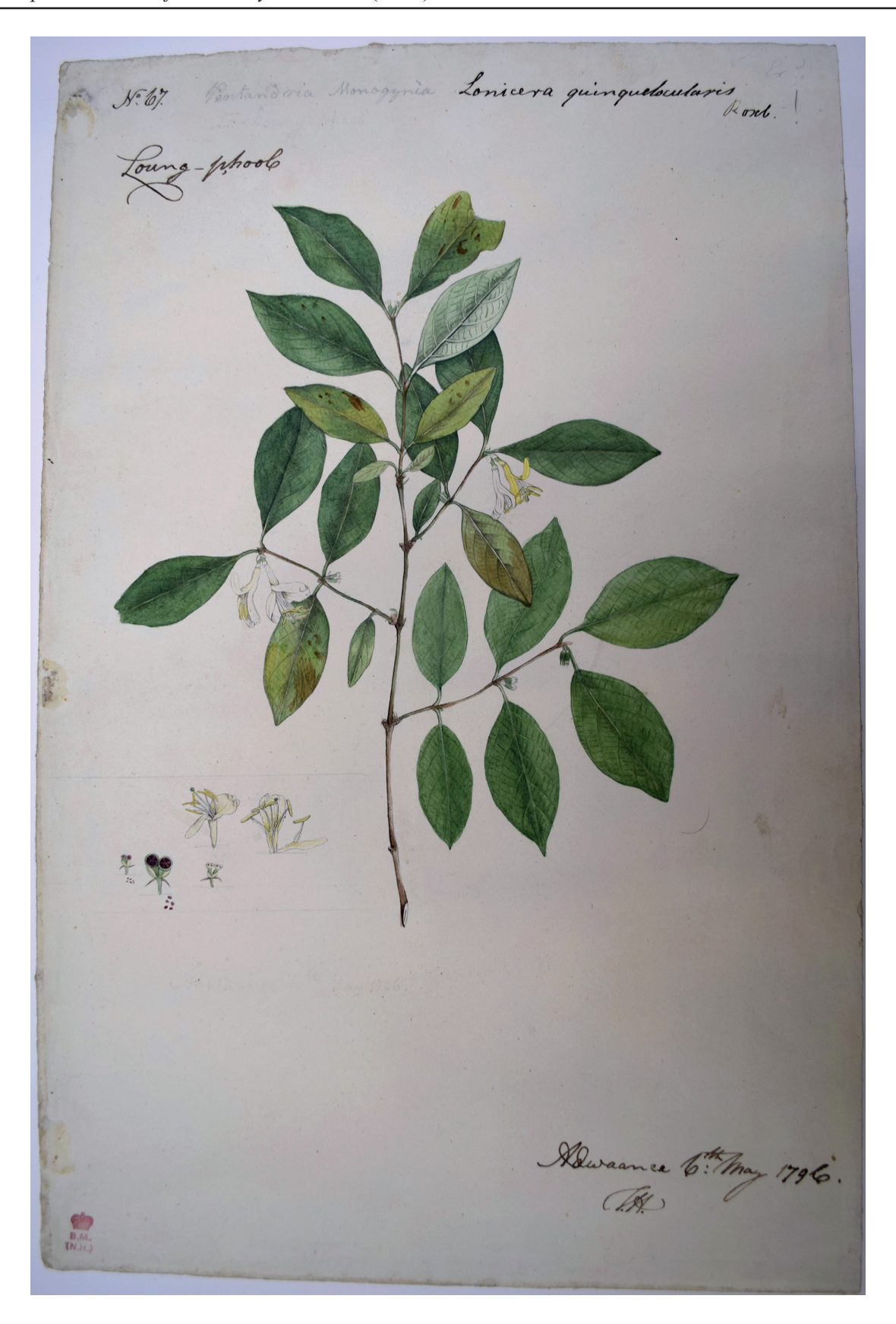
Fig. 3. Lectotype of Lonicera quiquelocularis Hardw., Hardwicke Drawing no. 67 from the collection of the Botany Library, Natural History Museum. © The Natural History Museum, London.