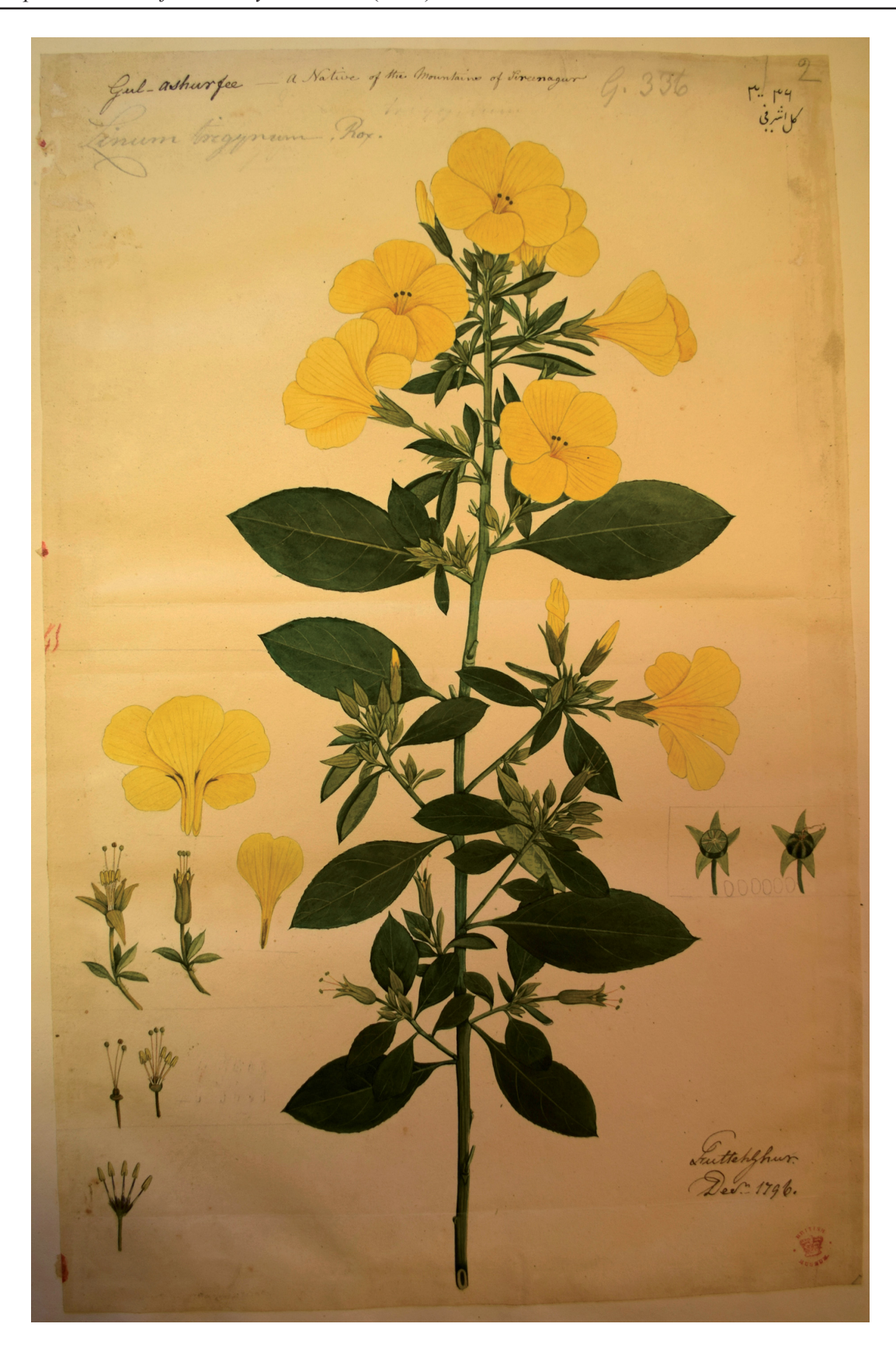
Fig. 4. Lectotype of Linum trigynum Roxb. ex Hardw., Hardwicke, Plants of India Vol. XVI (Add MS 11025): drawing no. 2. Reproduced with permission of the British Library Board.