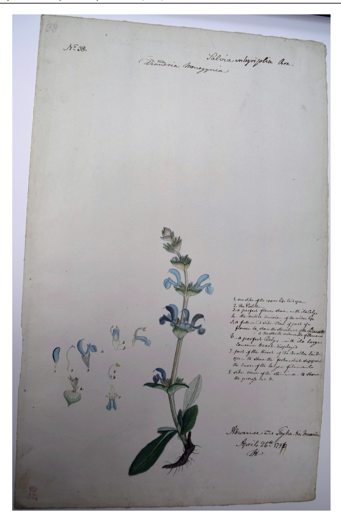
Fig. 2. Lectotype of Salvia integrifolia Roxb. ex Hardw., Hardwicke Drawing no. 38 from the collection of the Botany Library, Natural History Museum.