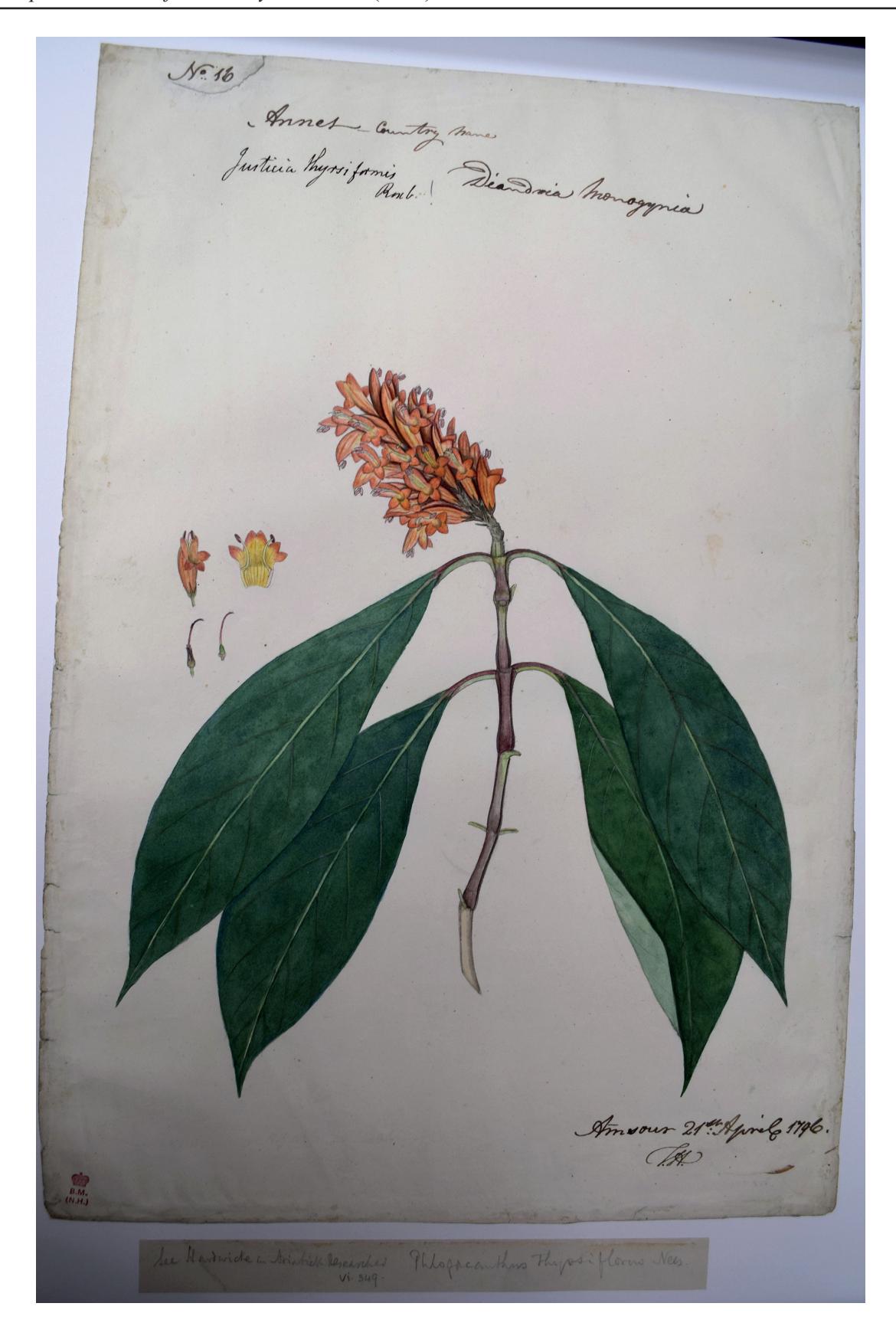
Fig. 1. Lectotype of Justicia thyrsiformis Roxb. ex Hardw., Hardwicke Drawing no. 16 from the collection of the Botany Library, Natural History Museum.