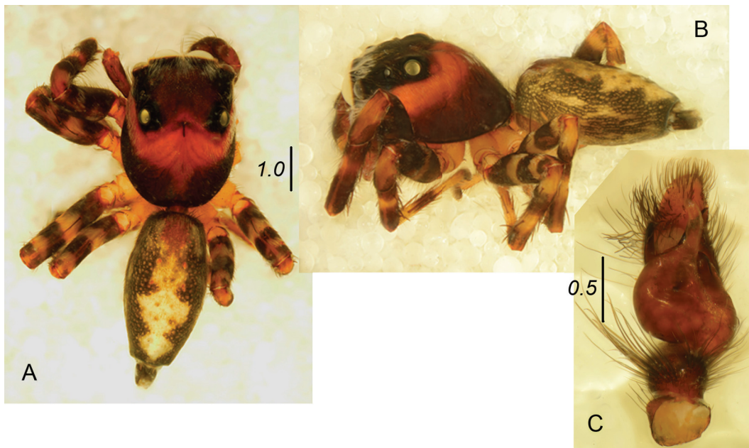
Fig. 1. Thiratoscirtus oberleuthneri sp. nov., holotype, male. A. General appearance, dorsal view. B. General appearance, lateral view. C. Palp, ventral view. Scale bars: A–B = 1 mm, C = 0.5 mm.