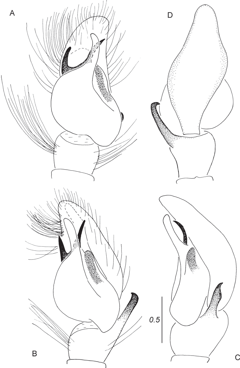
Fig. 2. Thiratoscirtus oberleuthneri sp. nov., holotype, palpal organ. A. Ventral view. B. Ventrolateral view. C. Lateral view. D. Dorsal view. Scale bar for all figures = 0.5 mm.