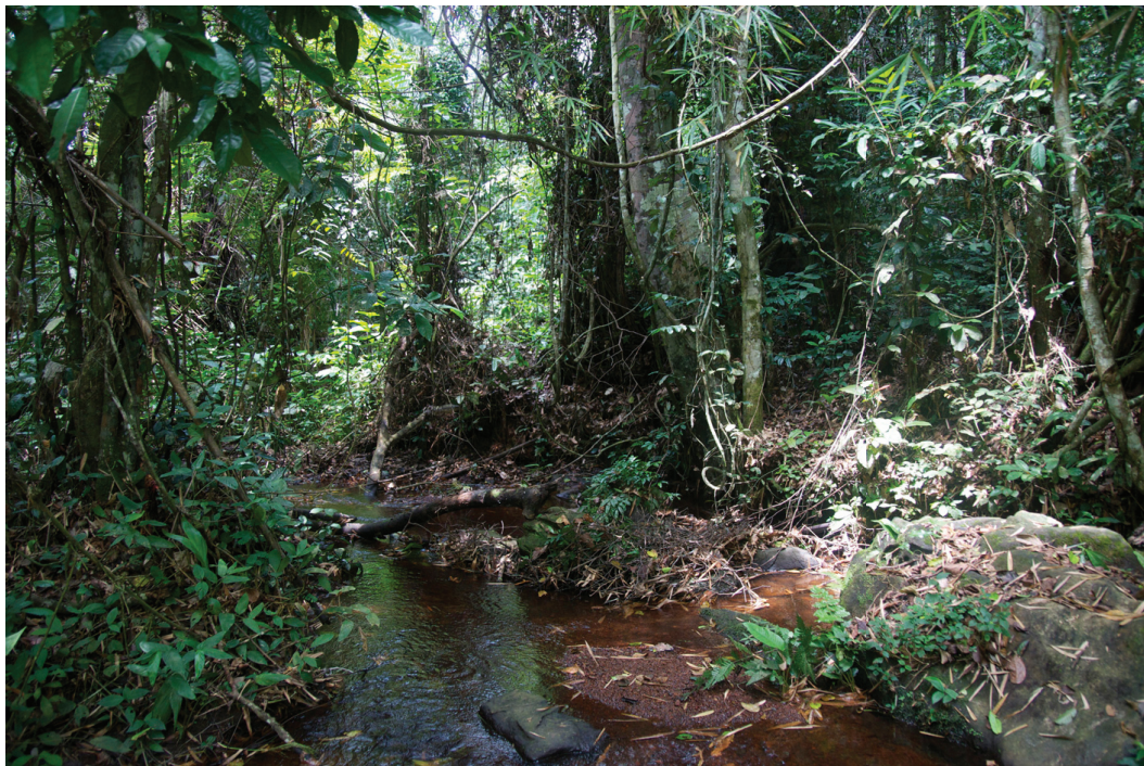
Fig. 3. Natural habitat of Thiratoscirtus oberleuthneri sp. nov. in Midzic, Gabon.