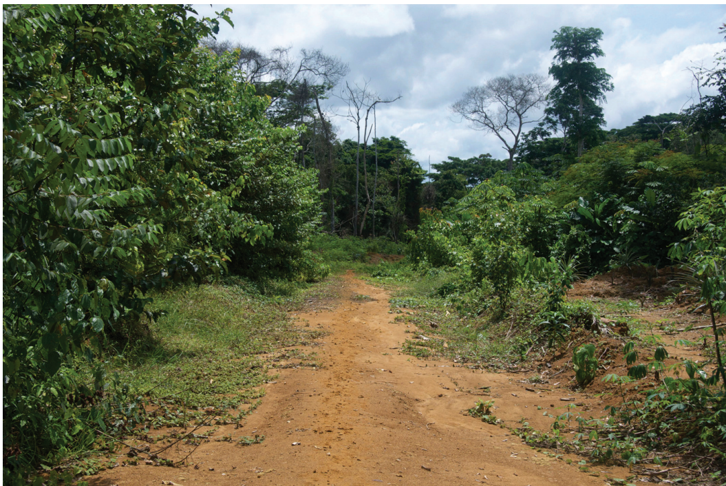
Fig. 6. Natural habitat of Thiratoscirtus lamboji sp. nov., 122 km south of Makokou, Gabon.