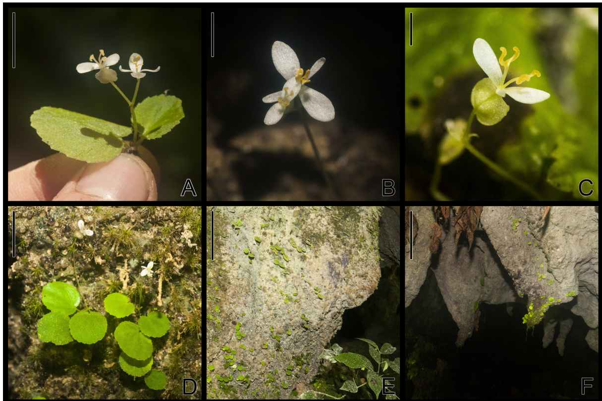
Fig 3. Begonia elachista Moonlight & Tebbitt sp. nov. A. Whole plant. B. Male and female flower, front view. C. Female flower, side view. D. Habit and associated vegetation. E–F. Habitat and wild population. Scale bars: A = 1 cm; B = 5 mm; C = 2 mm; D = 2 cm; E–F = 10 cm. All from P. Moonlight & A. Daza 318 (E).

Caulесcent, tuberous herb. Tuber subglobose, 1–2 mm in diam. Stems 1–3 per tuber, erect, ca 0.2 mm in diam., 5–30 mm long, unbranched, internodes 1.5–7.5 mm long, glabrous, light green. Stipules persistent, narrowly lanceolate, 0.5–1.5 × 0.2–0.5 mm, apex acuminate, aristate, terminal hair ca 0.4 mm long, margin entire, with 1–2 ciliate hairs to 0.2 mm on each side. Leaves 1–4, alternate, basifixed; petiole orientated in same direction as the main vein of blade, 8–25 mm long, glabrous, blade symmetrical to subsymmetric, ovate to suborbicular, 8–30 × 7–25 mm, membranous, apex obtuse, base cordate, basal lobes not overlapping, sinus 0.5–2 mm deep, margin irregularly crenate, ciliate, the hairs to 0.3 mm, upper surface glabrous, light grey-green, lower glabrous, light grey-green, veins palmate, 5–7, secondary veins indistinct. Inflorescences 1–2, axillary, arising from axis of each leaf, erect, an asymmetric dichasial cyme, with 1–2 branches, bearing up to 2 male flowers and up to 2 female flowers, usually protandrous but basal-most female flower often opening concurrently with the apical male flower; peduncle 5–40 mm long, glabrous; pedicels of male flowers 2–6 mm long, glabrous; pedicels of female flowers 1–5 mm long, glabrous; bracts persistent, elliptic, 1.5–2.5 × 0.1–0.3 mm, apex acuminate, margin entire, glabrous or with up to 2 ciliate hairs to 0.2 mm on each side, dark brown.