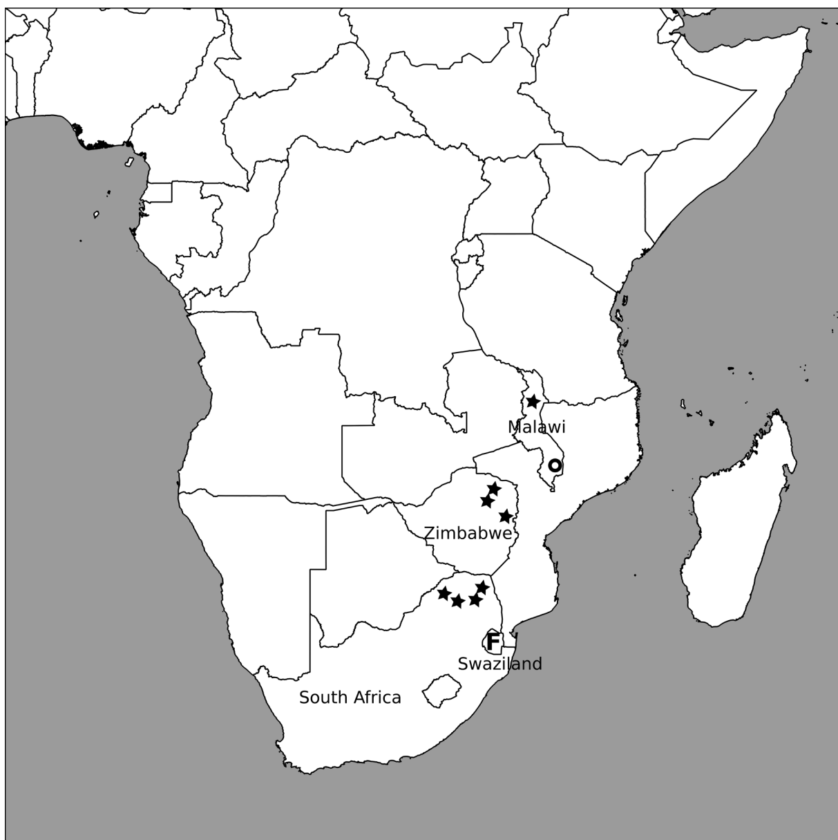
Fig. 4. Collection localities of males of Dorsomitus neavei (Kimmins, 1949) gen. et comb. nov. (circle), D. tjederi sp. nov. (stars) and Dorsomitus sp. ♀ in Swaziland (F).

belongs to an unidentified genus. This latter specimen, with tip of abdomen missing (possibly dissected by van der Weele), was designated by van der Weele as the male of the female S. buyssoni . Concerning this last specimen, it should be noted that the third abdominal sternite harbors a marking very similar to the one of Dorsomitus gen. nov. and its relative length is also the same as in male Dorsomitus gen. nov. However, if the sex determination made by van der Weele is correct, we consider that the shape of the first abdominal tergite, which is weakly sclerotized and divided along the dorsal midline into a pair of dorso-lateral plates and not developed dorsally into a forked projection, clearly differentiates it from Dorsomitus gen. nov. Examination of this specimen shows that the color pattern of the third abdominal sternite in Dorsomitus gen. nov. is very probably shared with another genus. In the case of females, the separation of both genera is currently not possible and necessitates the examination of additional material.