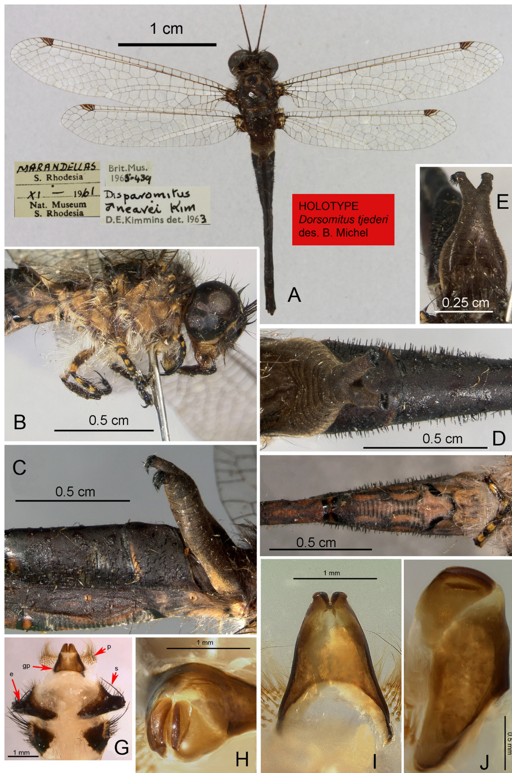
Fig. 2. Dorsomitus tjederi gen. et sp. nov., holotype, ♂ (NHMUK 1963-439). A. Habitus with associated labels. B. Lateral view of head and thorax. C. First to third abdominal tergites, right lateral view. D. Same as previous, dorsal view. E. First abdominal tergite, front view. F. Base of abdomen, ventral view. G. Terminalia and genitalia, dorsal view. H. Gonarcus-parameres complex, caudal view. I. Same as previous, dorsal view. J. Same as previous, left lateral view.