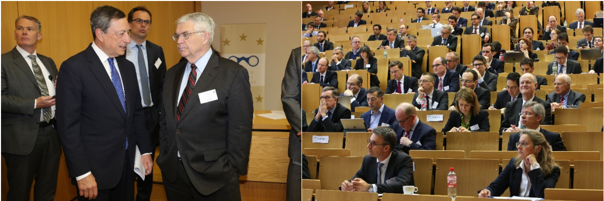
ECB President Mario Draghi and John B. Taylor; participants in the main lecture hall (from left to right)

Central bankers, market participants and academics have been debating current issues of monetary policy and financial stability at this forum since 1999. The eighteenth edition of this conference series for the first time took place at Goethe University’s lecture hall building and was simultaneously available for the general public on the internet via Goethe University’s live stream.