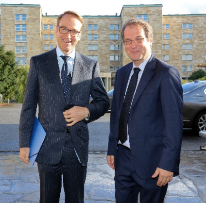
Bundesbank President Jens Weidmann arriving for his IMFS Distinguished Lecture

During his IMFS Distinguished Lecture on September 14, Jens Weidmann, President of Deutsche Bundesbank, reminded the European Central Bank not to miss the exit from quantitative easing (QE) even though the expansionary monetary policy is still adequate currently. “We’re not talking about slamming on the brakes but rather about no longer constantly putting our foot down on the accelerator”, Weidmann said, speaking to more than 350 guests and media representatives.