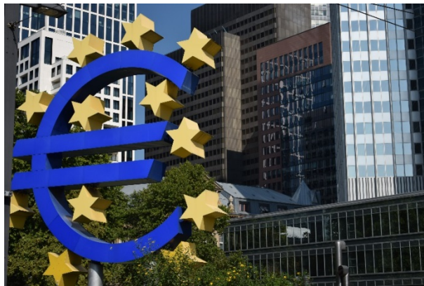
The European Central Bank and the national central banks constitute the Eurosystem

This field of research centers around the stability of financial markets, financial institutions and public finances from a legal perspective. Its focus is on the European Monetary Union encompassing the European system of central banks (ESCB); the legal aspects of money and monetary policy; provisions of European and national law to secure sound government finances including government deficits and debt, support mechanisms, and fiscal federalism. Supervision and control of the financial sector is included as well.