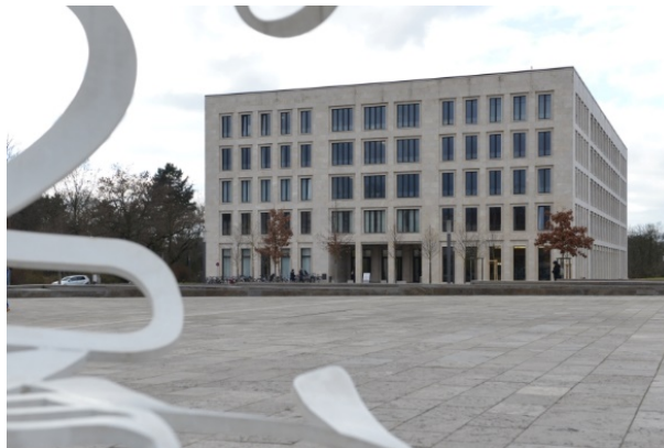
House of Finance, located at Goethe University’s Campus Westend