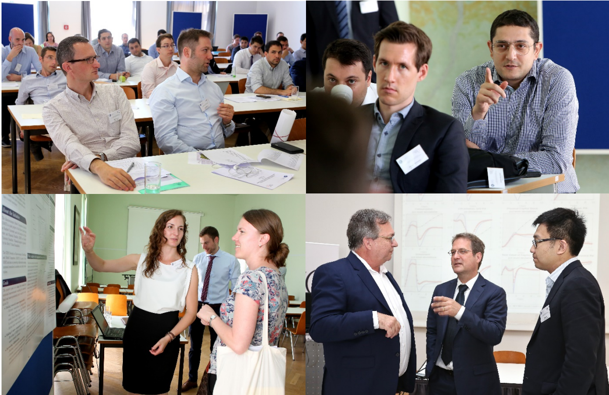
Impressions from the first MMCI research conference on the effects of quantitative monetary policy in structural models

Quantitative macroeconomic models play an important role in informing policy-makers about the consequences of monetary, fiscal and macroprudential policies. The Macroeconomic Modelling and Model Comparison Network (MMCN) is a new research network that aims to make progress in this area by promoting collaboration among researchers in academia and policy institutions in cooperation with the Centre for Economic Policy Research (CEPR). It forms part of the Macroeconomic Model Comparison Initiative (MMCI) by the Hoover Institution at Stanford University and the IMFS . The MMCI initiative is supported financially by the Alfred P. Sloan Foundation (for more information see section on Major Research Projects, p. 31).