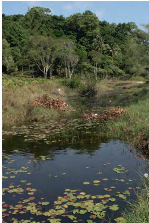
Figure 13. A natural channel between the Long Beach and a woody ridge at the SW bank of Koh Rong Island, locality KR4, a habitat of Ischnura senegalensis , Pseudagrion microcephalum , Diplacodes nebulosa , Neurothemis fluctuans . 29.03.2015.

KR3. Several small freshwater pools among bushes behind the Long Beach eastern end, obviously fed by ground springs. 10°40'30" N 103°15'35", 5 m a.s.l., 29.03.2015.