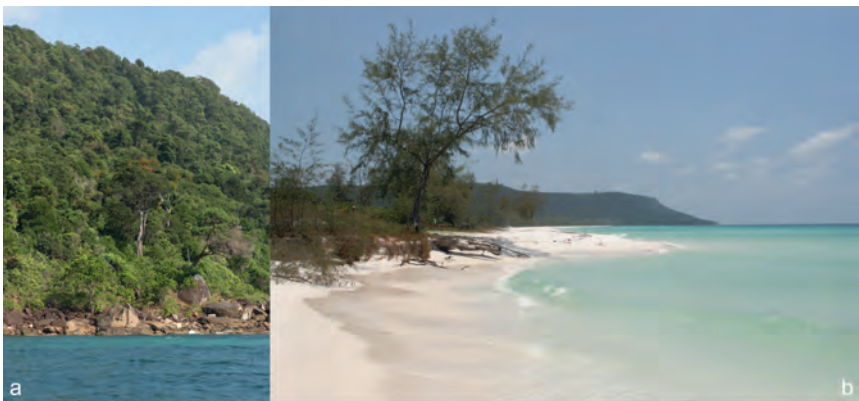
Figure 12. The western bank of Koh Rong Island as seen from the sea (a) and Long Beach at its south-western bank (b). 29.03.2015.

This is one of the remote islands 25 km W of Sihanoukville, sized ca 15x15 km. Its nature is close to pristine, although more disturbed than at the twin island Koh Rong Sanloem. There are few roads on the island. Even the beach with a line of guest-houses and restaurants at the SE tip has no road, so that goods are transported by trolleys over the sand. The opposite, SW bank is still almost not explored and is famous for the Long Beach (7 km long) (Fig. 12b) with a pure white sand and incredibly clean water, so that boats seem to hang in the air. However, there is already a bulldozer there. Most of the west bank, of rather an intricate shape, is rocky (Fig. 12a), with few other beaches. The island interior is hilly (up to 318 m), in its southern part the hill range has a gentle western and rather steep eastern slope. The hills and rocky banks are covered with evergreen forest which is not tall, obviously a coastal version, crossed by several pathways, on SW and NW banks