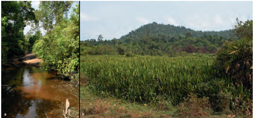
Figure 4. Two rivulets at Ream Peninsula crossed by the road before entering the Ream National Park: a – locality R2, the shown reach is a habitat of Vestalis gracilis , Diplacodes trivialis Neurothemis fluctuans , N. tullia , Orthetrum chrysis , O. neglectum , O. sabina , 26.03.2015; b – locality R3, the habitat of Agriocnemis pygmaea , N. fluctuans , Orthetrum chrysis , O. sabina , Potamarcha congener , 27.03.2015.

R2. A rivulet at hilly land crossing the road between Ream settlement and the Ream National Park border, with brown water: upstream the road slow, ankle to knee