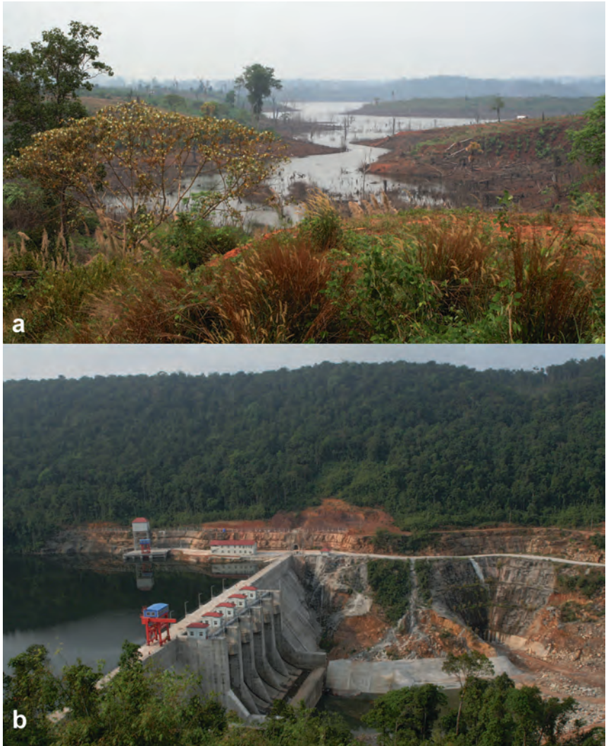
Figure 17. Newly made water reserves at O'Som village (a) and along the road from Koh Kong to there (b). 24.03.2015.

extension and some smaller deeper pools upstream the bridge; some ground springs at banks. 12°04'40-45" N 103°12'21-35", 524-531 m a.s.l., 24.03.2015: 9:00-12:50.