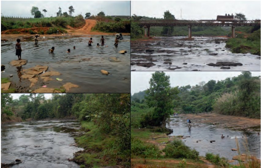
Figure 19. The river in front of the village of O'Som, locality OS1, a rich habitat of Neurobasis chinensis , Vestalis gracilis , Dysphaea gloriosa , Heliocypha biforata , Acia-grion borneense , Agriocnemis pygmaea , Pseudagrion australasiae , P. pruinosum , P. rubriceps , P. williamsoni , Copera marginipes , Pseudocopera ciliata , Prodasineura autumnalis , Ictinogomphus decoratus , Merogomphus parvus , Brachythemis contaminata , Crocothemis servilia , Diplacodes trivialis , Hydrobasileus croceus , Neurothemis tullia , Onychothemis testacea , Orthetrum chrysis , O. neglectum , O. sabina , Rhyo-themis phyllis , R. plutonia , Tholymis tillarga , Trithemis aurora , T. festiva , T. pallidinervis , Urothemis signata . 24.03.2015.

under the leaves of Allocasia , shady and fast downstream the road, upstream of the road dammed to a large pond with remnants of burnt out forest at banks (Fig. 20), \sim 12^{\circ}01'15'' N 103^{\circ}11'39'' (GPS data, recent Google Earth photo and hence intervals not available), \sim 508 m a.s.l., 24.03.2015: 13:00-14:30.