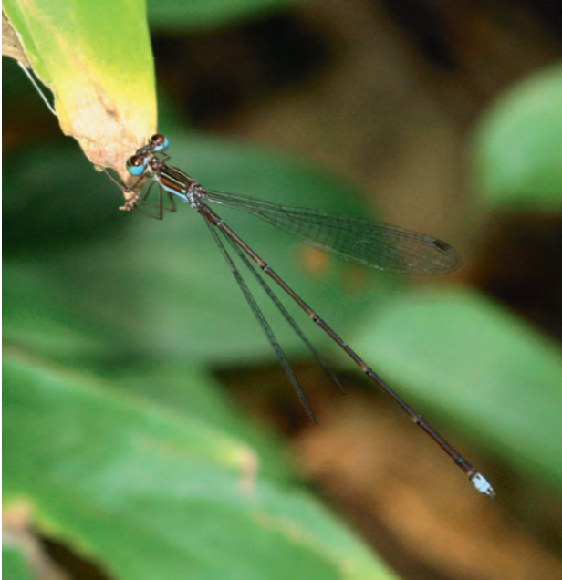
Figure 15. A male of Coeliccia kazukoae , at the premature colourational stage, at a shady and rocky rivulet temporarily with scanty water, locality KR2, at Koh Rong Island. 28.03.2015.