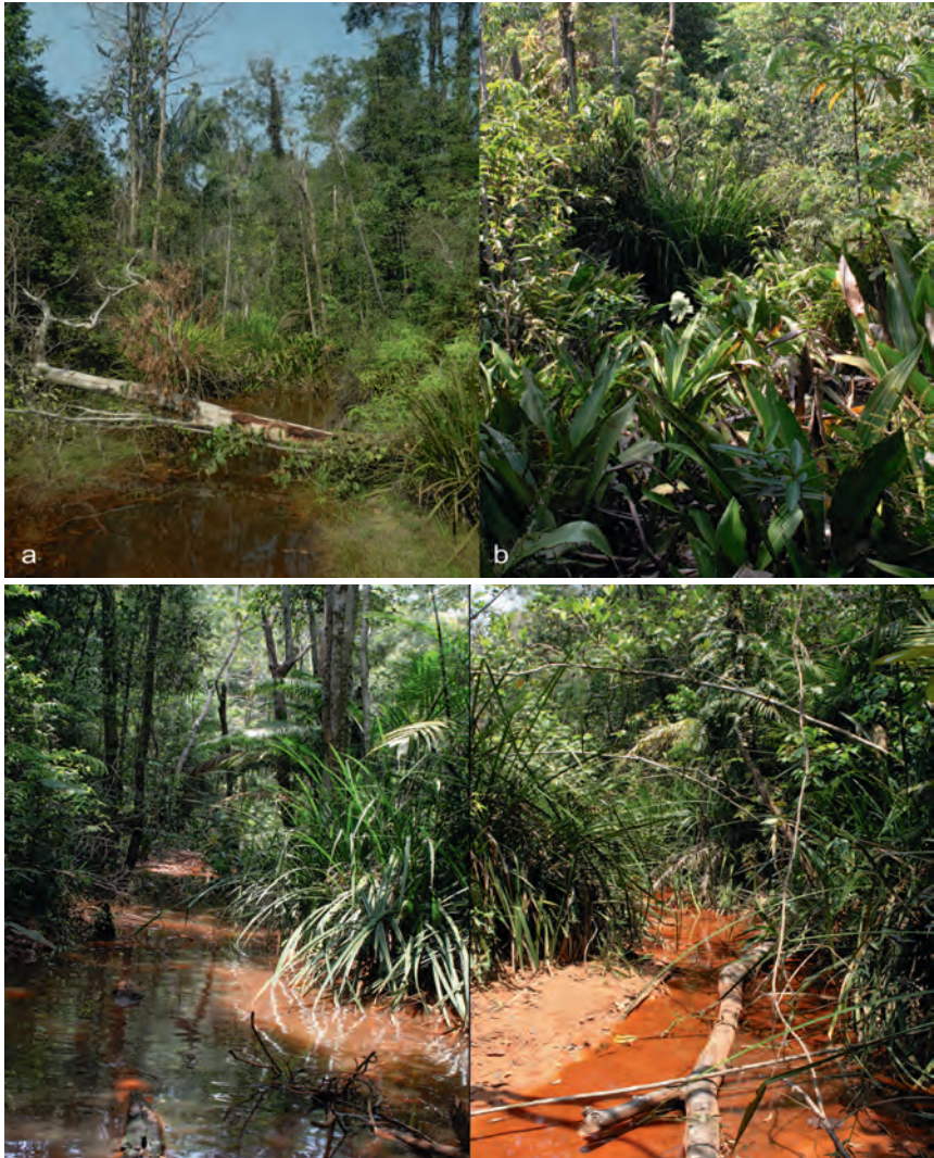
Figure 8. A contaminated rivulet, locality R8, in the Ream National Park, with roadside pools (a) and tall semiaquatic ginger in shaded reaches (b), a habitat of P. microcephalum , Brachydiplax chalybea , Neurothemis fluctuans , Orthetrum chrysis , O. sabina , Urothemis signata . 27.03.2015.