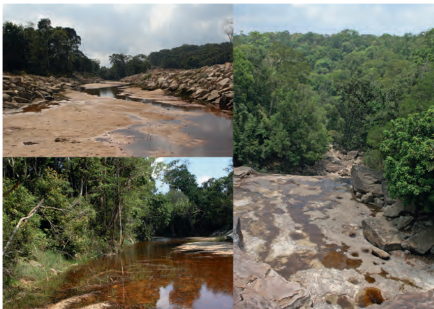
Figure 22. The Popokvil River at Bokor Hill Station, almost devoid of water because of the dry season and of forest because of the development: left – flat section, locality B1, 31.03.2015; right – the (dry) waterfall, locality B4. 1.04.2015.

B5. Bush thickets at the top of the plateau crossed by roads, sometimes with roadside ditches with current water, at Black Palace, Catholic Church and Wat. ~10°37-38-' N 104°01-05', 965-1035 m a.s.l., 31.03-1.04.2015