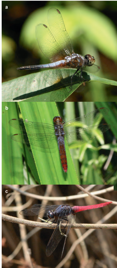
Figure 11. Common libellulids at Ream Peninsula: a – Brachydiplax chalybea , a male, at locality R9; b – Orthetrum chrysis , a female, at locality R9; c, Orthetrum neglectum , a male, at locality R2. 26.03.2015.