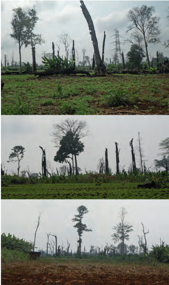
Figure 18. Landscapes in the vicinity of O'Som village: young banana plantations among stumps of burnt forest. 24.03.2015.