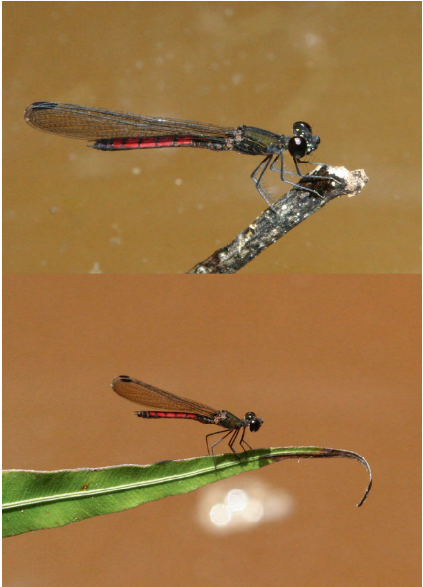
Figure 10. A male of Libellago hyalina at locality R6, a rivulet in the Ream National Park. 26.03.2015.