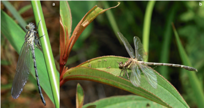
Figure 21. Teneral males of rheophyllous Odonata species at the river at O'Som village, locality OS1: a – Dysphaea gloriosa ; b – Merogomphus parvus .

strips left at the very banks (Fig. 22), now accompanied with asphalted roads. Downstream the hotel, a large (1x0.3 km) lifeless water reserve is made, with ugly swan-shaped boats for rent and dead forest at sides. The sites are advertised 7 km apart which is called Veal Srae Moy Roy "one hundred paddy fields" and the one 17 km apart called 'Five Hundred Paddy Fields', with intricate and picturesque sandstone rocks, a lot of Nepenthes bokorensis etc.; there is an asphalted road there. We did not figure out to visit them but from the advertisement they look like Bokor Hill Station as it was still five years ago.