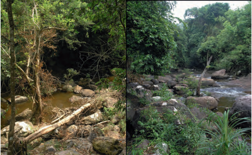
Figure 2. Saphonin 'Waterfall' at Laem Klat Town, Trat Province, Thailand (locality T1). Habitat of Vestalis gracilis , Euphaea masoni , Copera vittata , Prodasineura autumnalis , Neurothemis fluctuans , Orthetrum glaucum , Zygonyx iris . 17.03.2015.