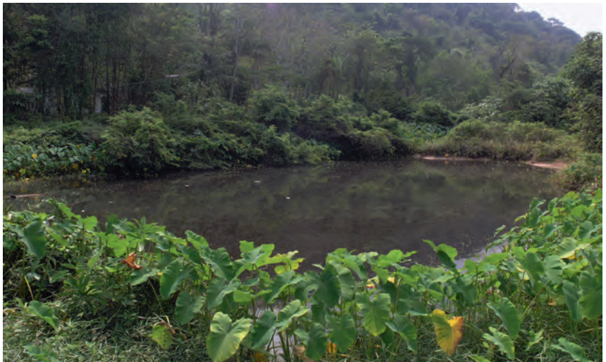
Figure 3. A pond between the towns of Laem Klat and Mai Rut, Trat Province, Thailand (locality T6). Habitat of Agricnemis pygmaea , Ischnura senegalensis , Pseudagrion australasiae , Ictinogomphus decoratus , Brachydiplax farinosa , Hydrobasileus croceus , Neurothemis fluctuans , Orthetrum sabina , Rhyothemis phyllis/variegata , R. triangularis , Trithemis aurora . 17.03.2015.