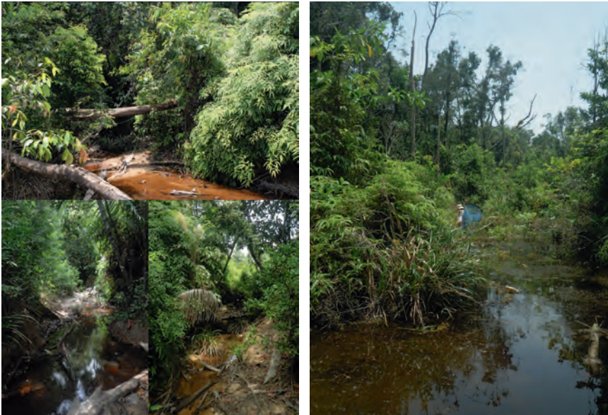
Figure 6 (left). A rivulet, locality R6, crossed by the main road in the Ream National Park, a habitat of Vestalis gracilis , Libellago hyalina , Archibasis viola , Ceriagrion cerinorubellum , Pseudagrion rubriceps , Prodasineura verticalis sp., Gomphidia sp., Brachygonia oculata , Cratilla lineata , Nannophia pygmaea , Neurothemis fluctuans , Orthetrum chrysis . 27.03.2015.

A male of Gomphidia sp. at R6 superficially looked like G. abbotti I saw elsewhere. It kept to a sunlit broadening of the rivulet ravine where perched on the same small dead branch at about 2.5 m above the ground. Twice I managed to approach a net to it almost to a stroke but missed. After disturbance, the dragonfly disappeared but revisiting this place in 15-20 min I found it on the same, rarely another nearby perch. I experienced this at ca 11:30 a.m. - 1:45 p.m. and did not find this dragonfly when returned to the same place at ca 3:20 p.m. Curiously, on the same branch I