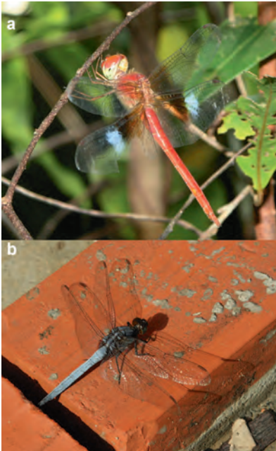
Figure 16. Males of common libellulids at Koh Rong Island: a – Tholymis tillarga at locality KR2; b – Orthetrum glaucum at locality KR1.