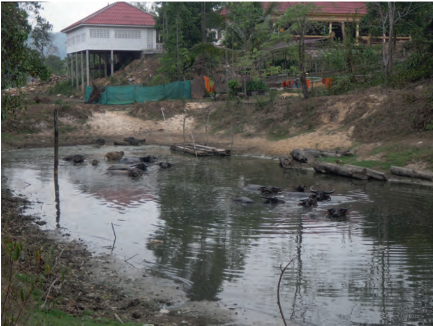
Figure 24. A buffalo pond at the temple at Phum Doung village, Tatai commune, Koh Kong Province (part of locality KK4), a habitat of Diplacodes trivialis , Orthetrum sabina , Pantala flavescens , Potamarcha congener. 21.03.2015.