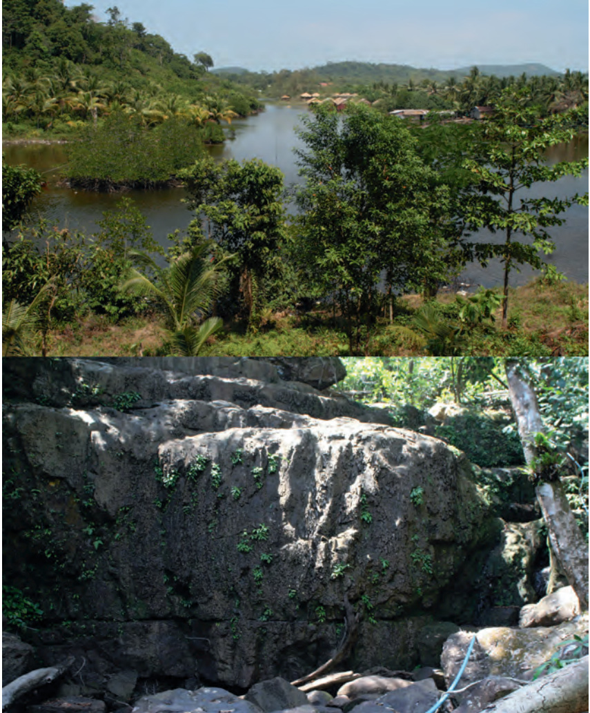
Figure 14. The brackish lagoon at the mouth (top) and a dry waterfall of a river (bottom) at the NE end of the Long Beach at Koh Rong Island, locality KR5, the habitats of Ceriatrion cerinorubellum , Copera vittata , Prodasineura verticalis sensu Asahina , Neurothemis fluctuans , Orthetrum chrysis . 29.03.2015.

KR4. A long and narrow freshwater natural channel some 150 m long between Long Beach and a low woody ridge parallel to it, close to the village at the Long Beach western end, about knee-deep, warm, with a muddy bottom full of gastropods, the surface is covered with very abundant Nymphoides with flower buds (Fig. 13). 10°42'12-14" N 103°14'45-48", 9 m a.s.l., 29.03.2015.