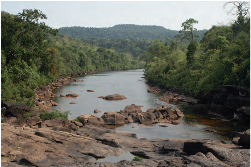
Figure 23. The Tatai Waterfall, Koh Kong Province, locality KK2, very low of water at the dry season end. 20.03.2015.