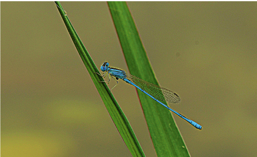
Figure 26: Amphiallagma parvum (Selys, 1876) male.