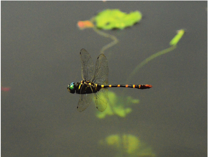
Figure 32: Epophthalmia vittata Burmeister, 1839 male.