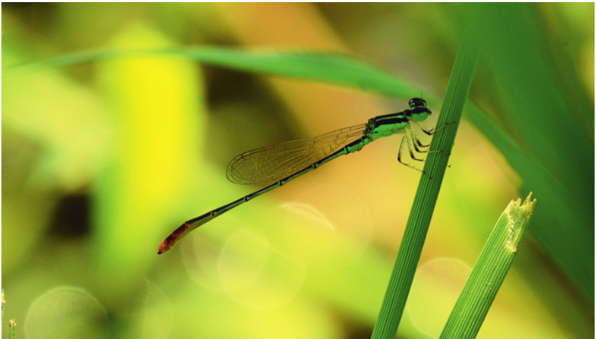
Figure 24: Agriocnemis femina (Brauer, 1868) male.