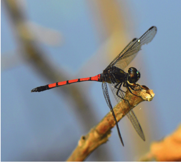
Figure 8: Agrionoptera insignis (Rambur, 1842) male.