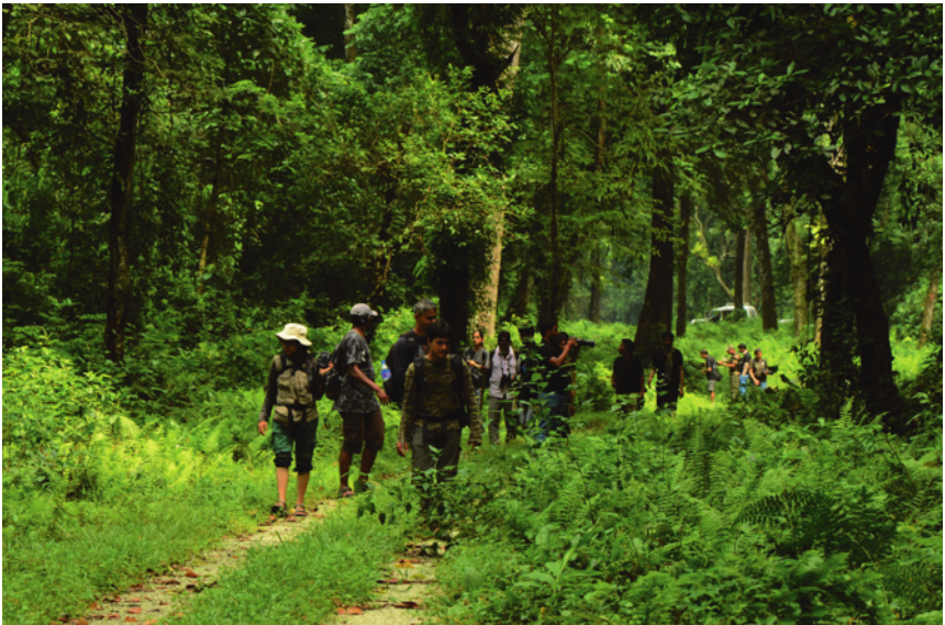
Figure 4: Field visit to the forest in Gorumara National Park.