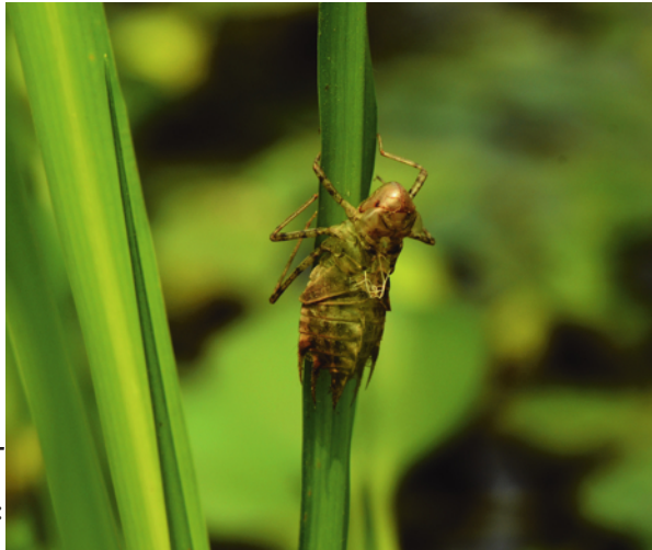
Figure 17: Exuvia of Hydrobasileus croceus Brauer, 1867.

Aciagrion hisopa sensu Fraser nec (Selys, 1876) – Taxonomic note: Oleg Kosterin (in lit., 09-vi-2015) stated that the specimens from India are not A. hisopa (see Fig. 23). "Fraser had a misconception of A. hisopa . The true hisopa is missing from India. However, Indian Aciagrion are not revised."