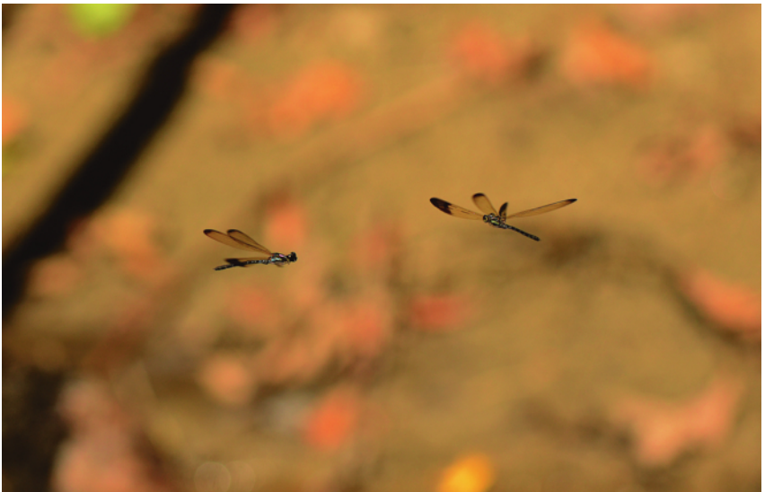
Figure 20: Two male individuals of Heliocypha biforata exhibiting the territorial display in flight.