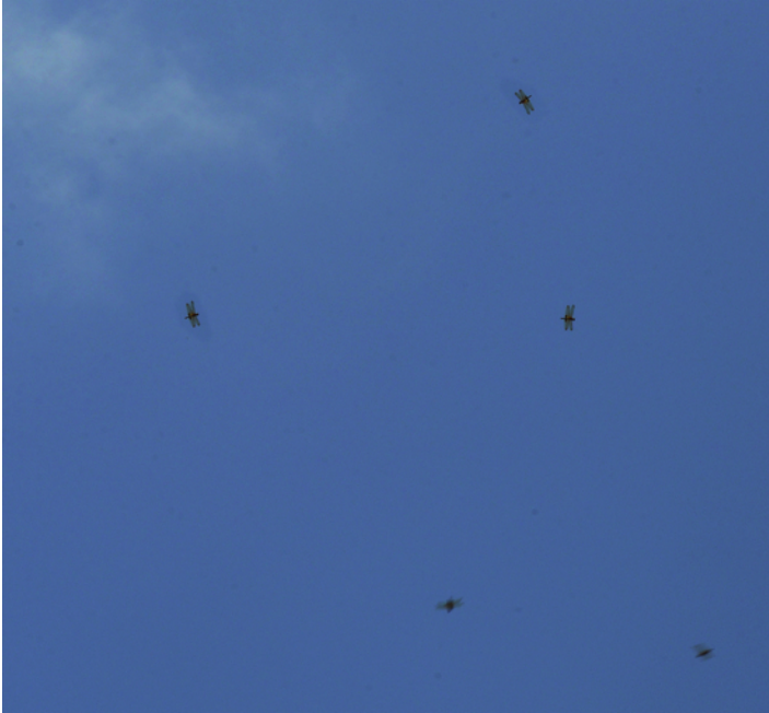
Figure 19: More than 50 Hydrobasi-leus croceus were found to swarm together at a height of about 20-25m.