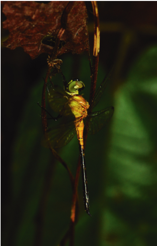
Figure 9: Teneral male of Amphithemis vacillans Selys, 1891.