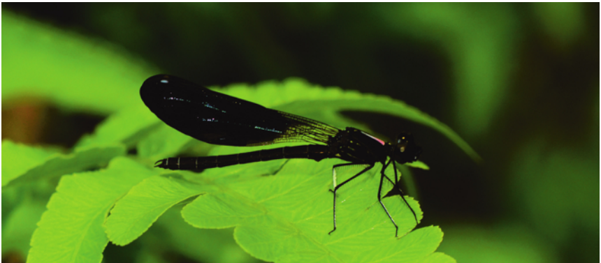
Figure 14: Aristocypha quadrimaculata Selys, 1853 male.