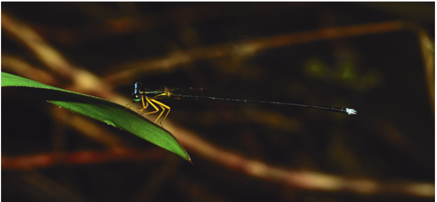
Figure 29: Coper vittata Selys, 1863 male.