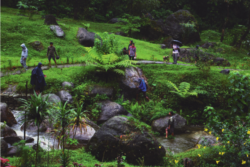
Figure 5: Participants photographing the odonates in the hilly stream at Samsing.