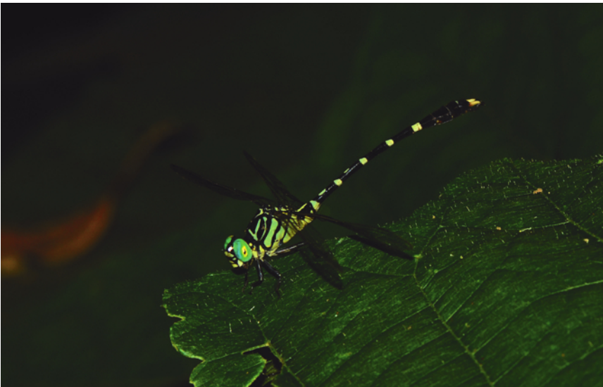
Figure 31: Nychogomphus cf. duaricus (Fraser, 1924) male.