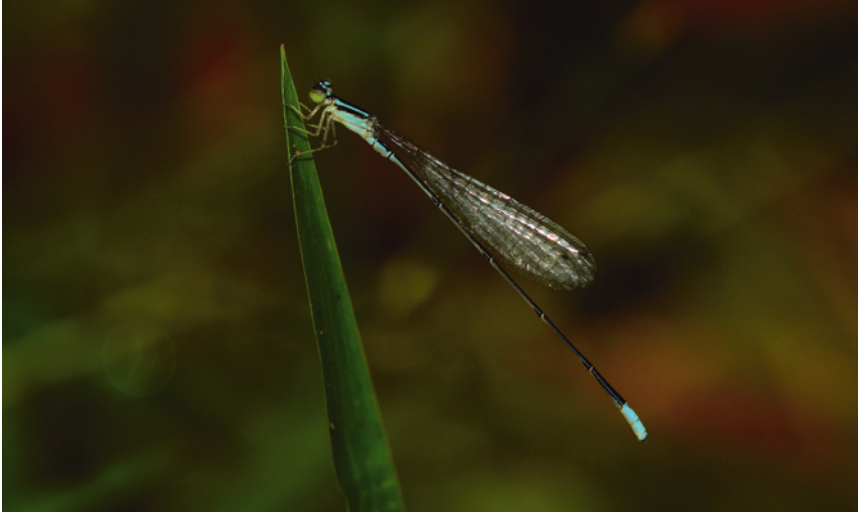
Figure 23: Aciagrion sp. male.