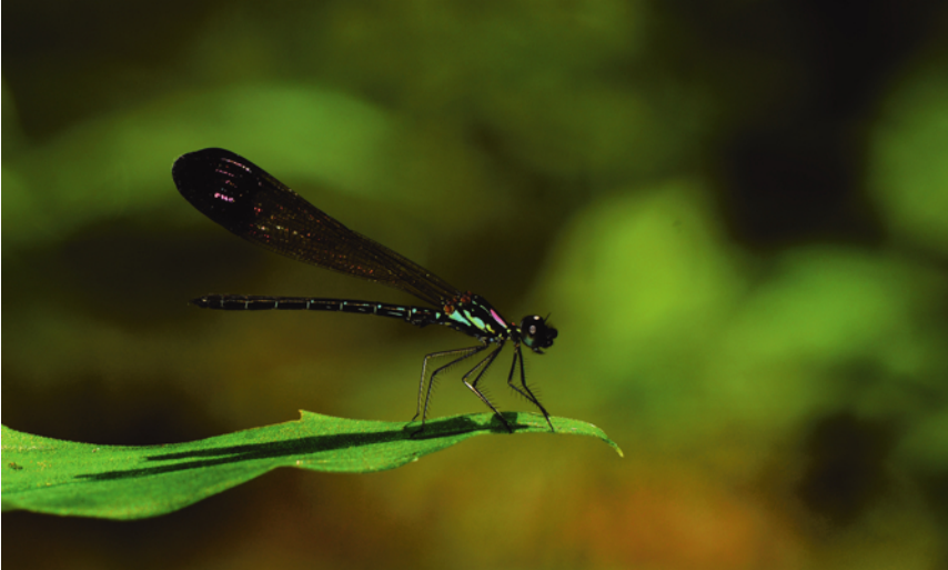
Figure 21: Heliocypha biforata Selys, 1859 male.