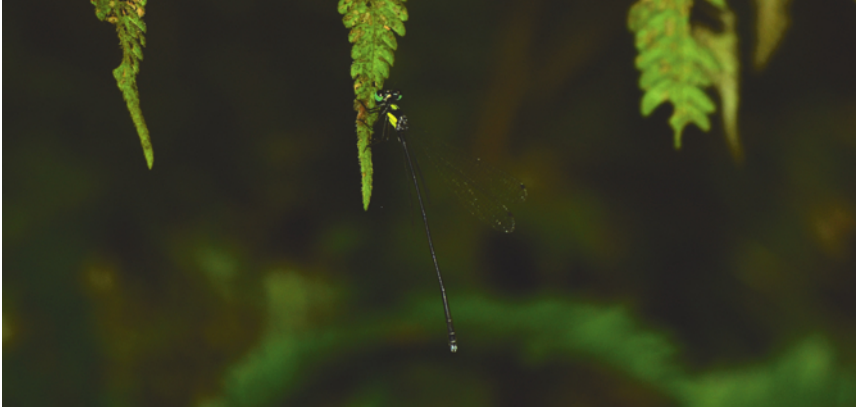
Figure 12: Coeliccia renifera (Selys, 1886) male.