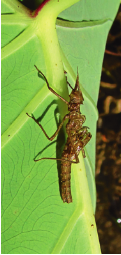
Figure 15: Exuvia of Vestalis sp.