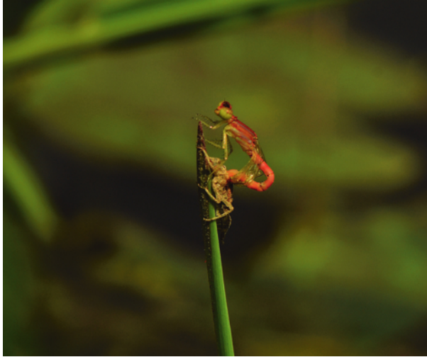
Figure 16: Emerging individual of Agriocnemis femina (Brauer, 1868) female.