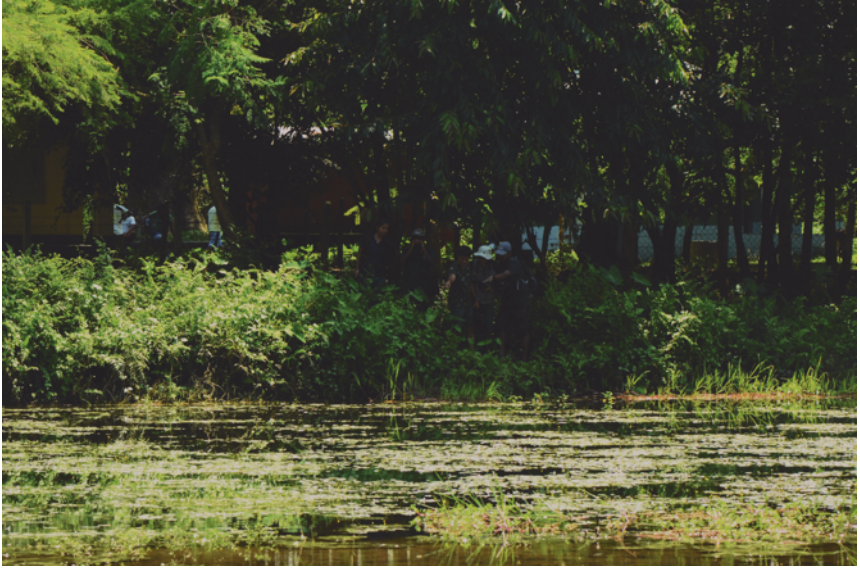
Figure 3: Perennial Pond with plenty of aquatic vegetation at Gorumara National Park.