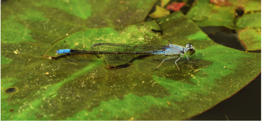
Figure 27: Paracercion calamorum (Ris, 1916) male.