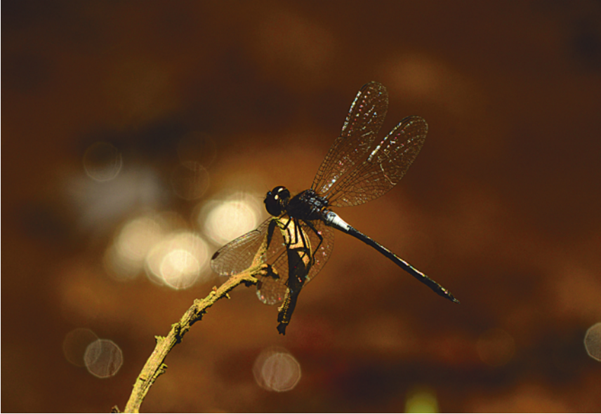
Figure 10: Amphithemis vacillans Selys, 1891 mature male.