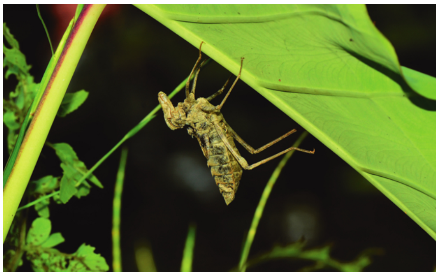
Figure 18: Exuvia of Epophthalmia vittata Burmeister, 1839.

Diagnosis: Strong backwardly directed dorsal spines, lateral spines of 9th and 10th segment very long. Eyes protruding backwards and distinctly pointed (Fig.17).