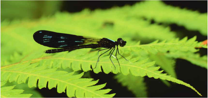
Figure 13: Aristocypha cuneata (Selys, 1853) male.