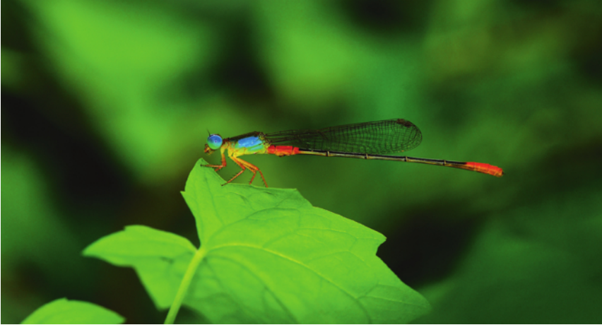
Figure 25: Ceriagrion cerinorubellum (Brauer, 1865) male.