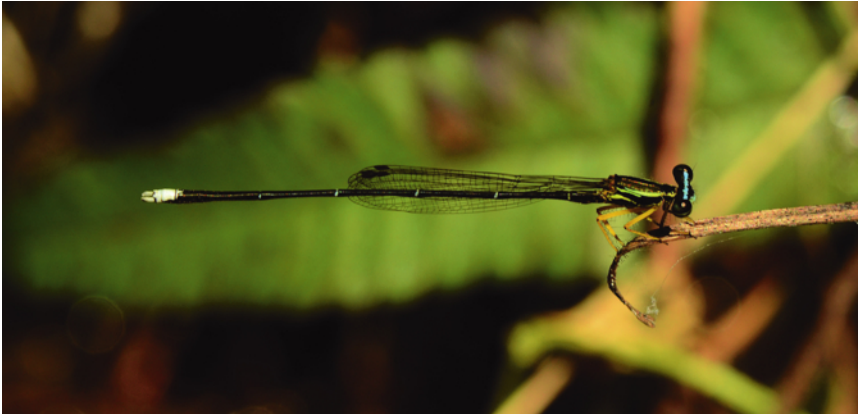
Figure 28: Coper marginipes (Rambur, 1842) male.