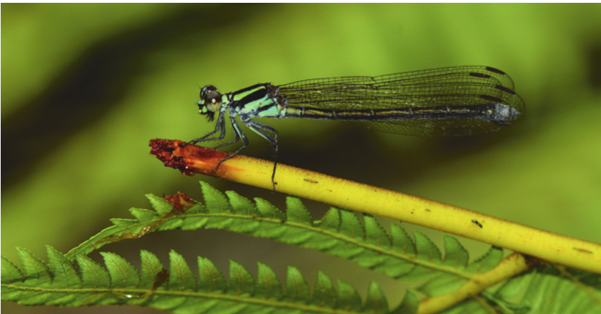
Figure 22: Anisopleura sp. female.