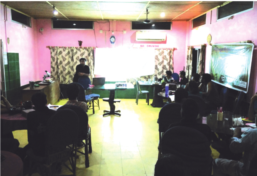
Figure 6: Presentation - Dragonflies of Gorumara National Park, West Bengal.