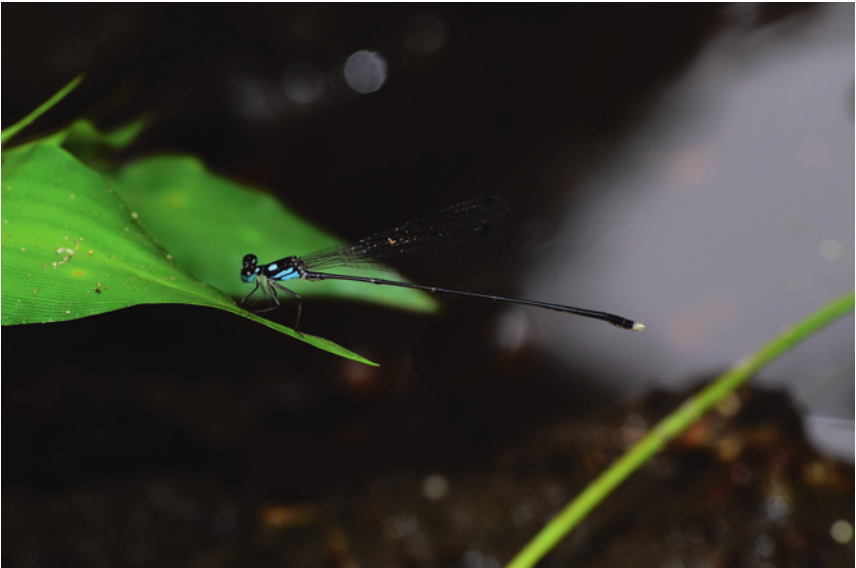
Figure 11: Coeliccia bimaculata Laidlaw, 1914 male.