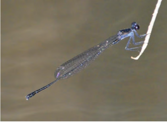
Figure 15. " Elatoneura " coomansi Liefinck, 1937 (Photo by Akbar Alfariysi).