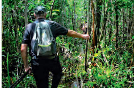
Figure 5. Swampy forest at Buluh Tumbang Village (location 4).