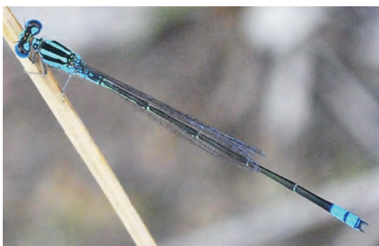
Figure 20. Pseudagrion coomansi Lieftinck, 1937.