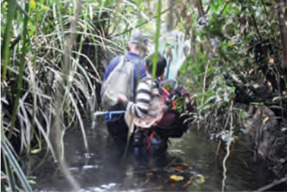
Figure 3. Habitat at Air Pute, a black water stream and surrounded by Pandanus species, located at Mempiu Village (location 1) (Photo: J. F. Bilitoni).