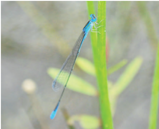
Figure 17. Aciagrion hisopa (Selys, 1876) (Photo: Akbar Alfariysi).