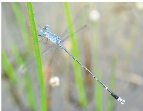
Figure 13. Lestes praemorsus decipiens Kirby, 1894.