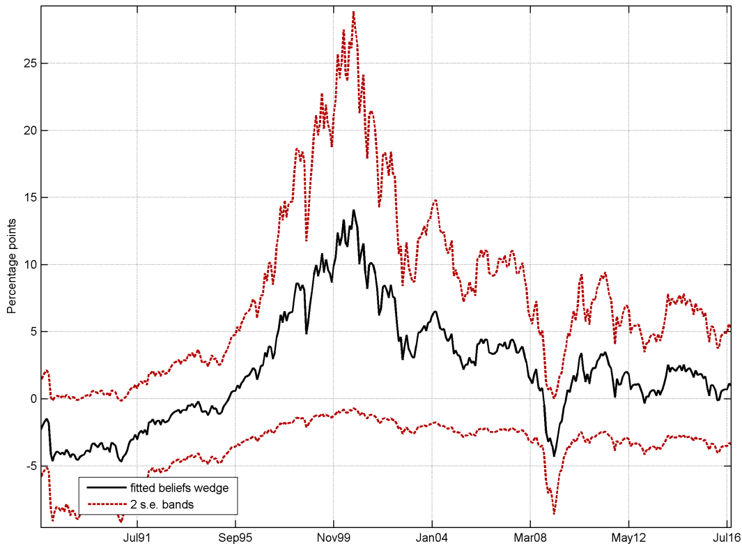
Figure 2: Fitted values from regression (18) of subjective expected returns in excess of the estimated objective expected returns on the P/D ratio in the UBS extended sample. The objective expected returns are estimated from regression (13) of realized returns on P/D ratio over a longer sample 1926-2017.

are too optimistic. Following crashes, like in early 2009, investors are too pessimistic. The UBS/Gallup survey includes observations from the late 90s, but no observations from the financial crisis and its aftermath. In contrast, the Shiller surveys include observations from the financial crisis and subsequent years. This partly explains why these other surveys on average have a lower share of optimistic observations than the UBS/Gallup survey.