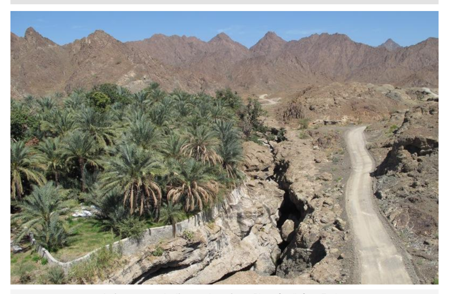
Jazira gorge and adjacent plantations.

Al-Jazira Oasis is the most remote of the mountain oases in the Mahdhah area of Oman that are accessible by car. It is approached from a ridge to the south which gives dramatic views of the plantations (mostly date palms) and the large dammed lake (sometimes washed out after heavy rains). It was here that Jodie Healy of the Al-Ain ENHG chose a superb route for an introduction and survey of the mountain flora, descending a modest gulley from the vehicle pass.