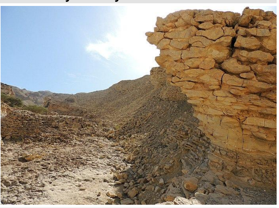
From top right corner, clockwise: Rumex limoniastrum, Wadi Nahyah, Pitted Beetle