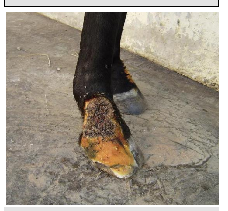
Shown above: the distal leg of a horse with a 'summer' sore. The wound above the hove is not healing because houseflies infected with nematode larvae are attracted.

On the topic: The parasite fauna in desert environments differ from that in other parts of the world. In detail we have examined the parasites of cats here in Dubai and surrounding territories. Parasites with indirect life cycles that include intermediate or paratenic hosts have advantages compared to those with a direct development. Freshwater is rare in the desert and under certain circumstances can easily become a source of infection. Muddy banks are the breeding grounds of horse flies the mechanical vector for trypanosomes of camels. Contrary to temperate climates houseflies in Arabia occur during the winter months and play a role as intermediate hosts for stomach worms in horses. Closely related worms can be found in the stomach of camels. worms utilize scarab beetles as intermediate hosts. Desert dwelling darkling beetles are the intermediate hosts for a recently described nematode that inhabits the stomach of falcons. Larval stages of this nematode are not host specific and can invade a variety of paratenic hosts (reptiles, birds and most probably also small rodents) on ticks which falcons hunt for. Camel and nasopharyngeal bots are the most successful species among parasitic arthropods in the desert.