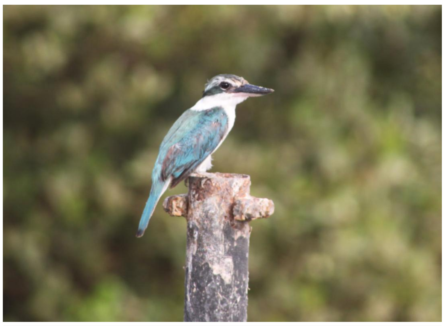
Kalba White Collared Kingfisher, Khor Kalba