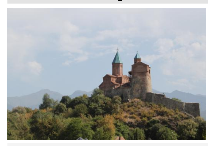
Orthodox Church in Georgia