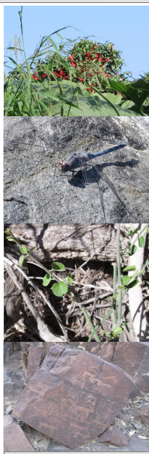
Top to Bottom: Red chilis growing in a wadi bank plantation; A close-up of Cocculus pendulus; Orthetrum ransonnetii; Rock art showing an ibex theme.