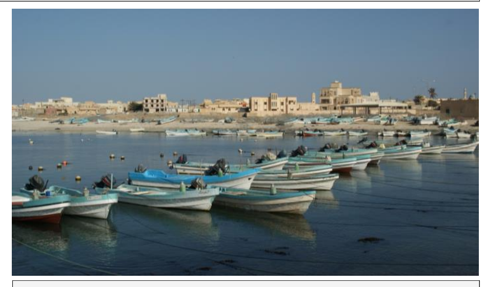
Above: Mirbat harbour. Below: View from cliff of Taqah.

We next visited Taqah Fort, one of the major forts of the Wilayat, which dates from the 19th century AD. Initially the house of the Governate's Wali (mayor), it is now a museum with decorated rooms, old artifacts and a handicrafts shop.