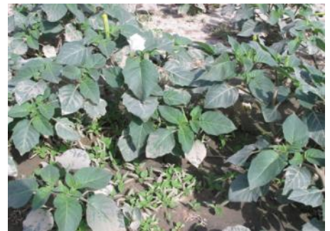
Mature Datura innoxia