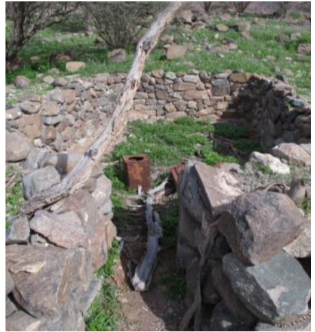
Kerosene Jugs in a sunken foundation

walls, typical of Hajar Mountain structures, are constructed of two layers of larger stones, with a central fill of gravel.