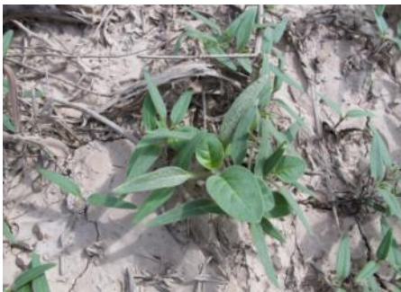
Datura innoxia seedlings showing schizophrenic leaves.