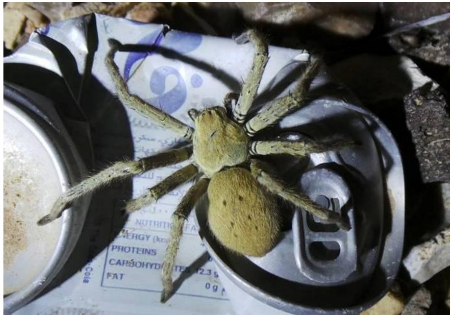
A Giant Crab Spider ( Eusparassus dufouri ?) from near Sur, Oman.

We had also discussed, initially, its resemblance to a common Asian spider often called the Huntsman,