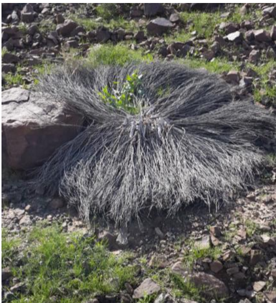
Dead Euphorbia larica

The highlight of the Wadi Sfai trip for this member was an encounter with Euphorbia larica , which is sometimes referred to, by the mountain residents, as "the donkey-sat-on-it plant".