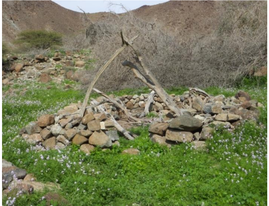
Remains of an A-frame roof