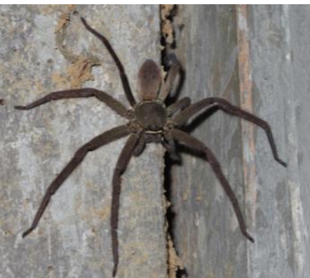
The Huntsman spider ( Heteropoda venatoria ), a common spider of Asian tropics and subtropics. The photo probably shows a male.

Heteropoda venatoria . The Giant Crab Spider and the Huntsman are similar, to be sure, but the Huntsman is much flatter overall, the abdomen is somewhat differently shaped (in both male and female), and the last pair of legs is even more distinctively held. One guide book says the Huntsman is now a cosmopolitan species in the tropics and subtropics, and is welcomed because it eats cockroaches.