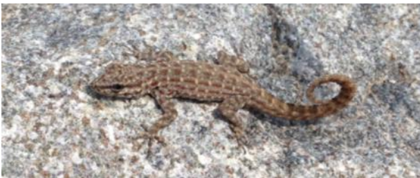
Above: Dwarf Semaphore Gecko. Right: Arabian Toad Tadpole.