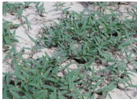
Enigmatic seedlings of Datura innoxia