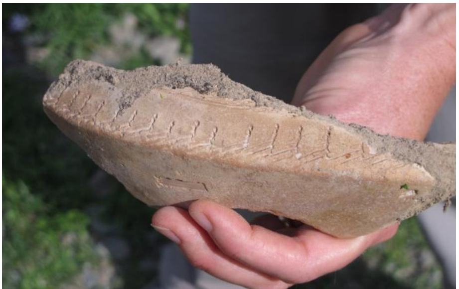
Decorated pot rim

From the heavily eroded condition of the fields we had seen, we had speculated that agriculture may have been abandoned in this area even before the modern era. However, "artifacts" found at the site – batteries, kerosene jugs and food