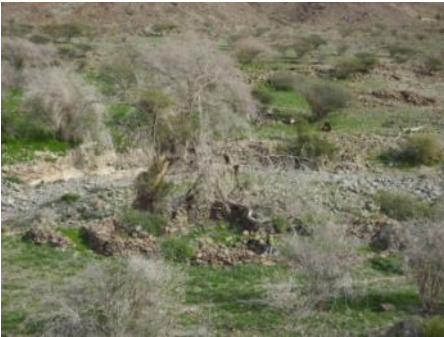
Aerial of the Lost Village

Our January 24 nature hike, a repeat visit to Wadi Sfai, in the center of the Hajar Mountains of the UAE, enjoyed an expected array of mountain plants and wildlife, but in the afternoon we also focused unex-