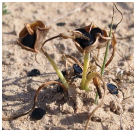
Below Left: Dipcadi biflorum , Ajman. Below: Capsella bursa-pastoris , Ajman.