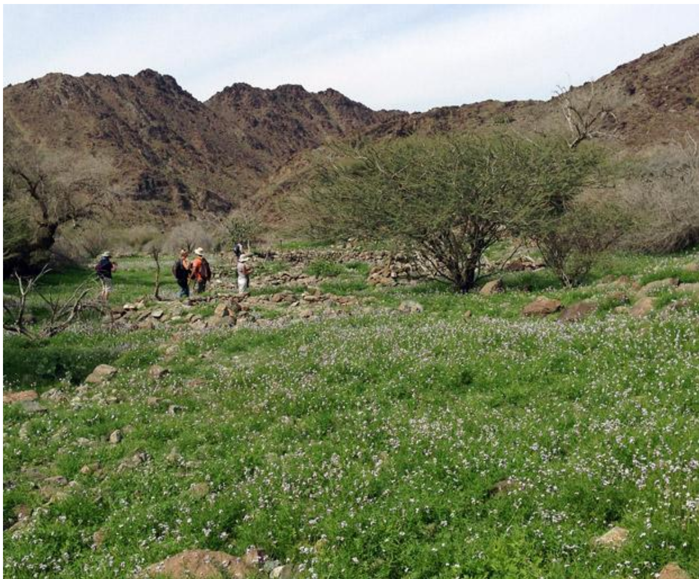
Green fields of Wadi Sfai.