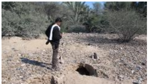
A large burrow in the silt.