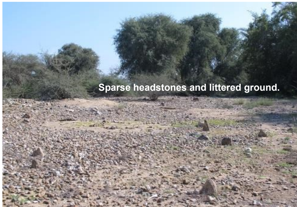
Sparse headstones and littered ground.

I looked more closely at the details. The littered appearance of the ground was enhanced by many white components. Most of these were coral; some were robust shells such as those of the rugose oyster Saccostrea cucullata and the gastropods Hexaplex kuesterianus and Conus betulinus . Still others were animal bones. How did they all come to be scattered here? Had they once formed part of the wall of the mound? Or did they originally decorate individual graves? The coral, the large shells and the wadi cobbles must all have been brought to the site from some distance away. The silt in the area of the graveyard is evidently rather deep. This was revealed by a number of excavations made by animals (red foxes?), although whether this was