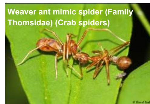
Weaver ant mimic spider (Family Thomsidae) (Crab spiders)