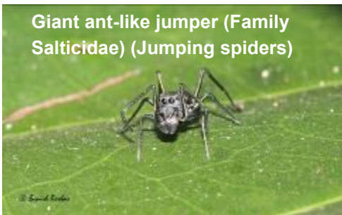
Giant ant-like jumper (Family Salticidae) (Jumping spiders)

walk on only six legs. Some ant mimic spiders modify the shape of their cephalothorax or develop more bulbous palps to give the impression of a third body segment.