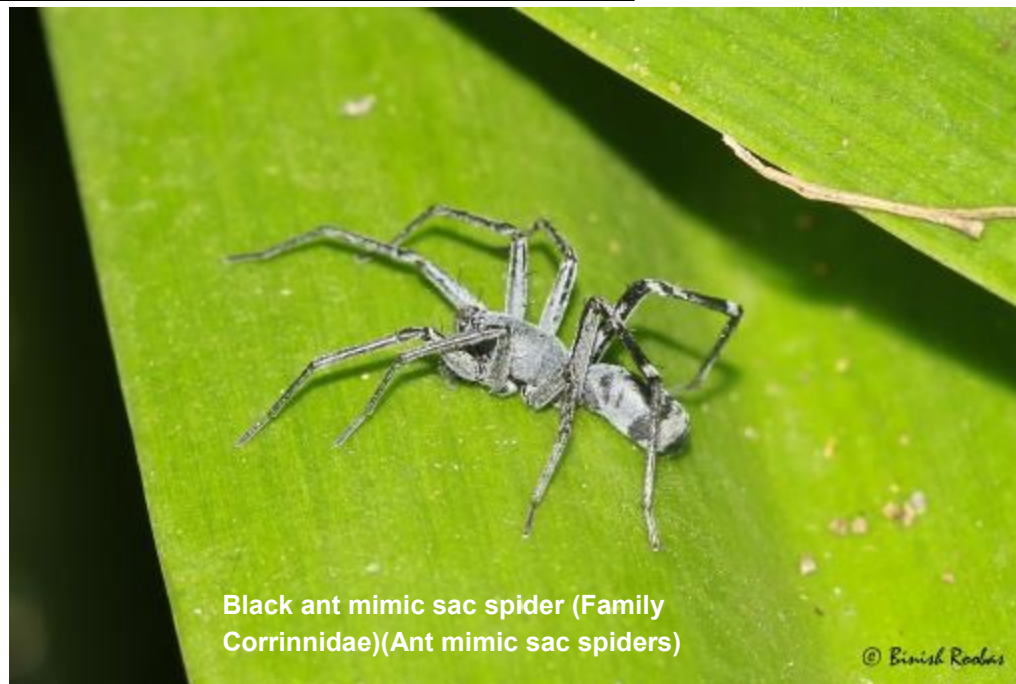
Black ant mimic sac spider (Family Corinnidae)(Ant mimic sac spiders)

Ant mimicry in spiders is a complicated phenomenon. Most ant mimic spiders prey on the ants they mimic. But their disguise is not intended to fool the ants, because ants rely on chemical and tactile clues much more than on eyesight. Instead, the disguise serves to protect