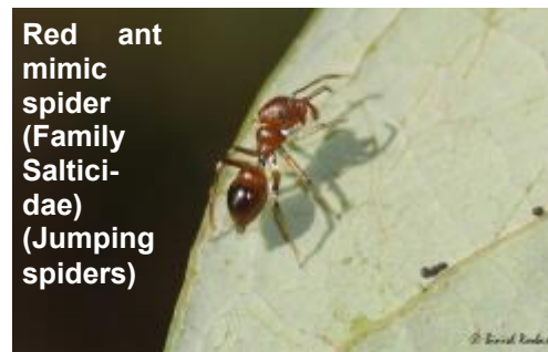
Red ant mimic spider (Family Salticidae) (Jumping spiders)

ground spider. If you watch closely in areas where ants are common, and keep in mind some of the above tricks, you could add to our knowledge of these interesting creatures.