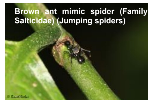
Brown ant mimic spider (Family Salticidae) (Jumping spiders)