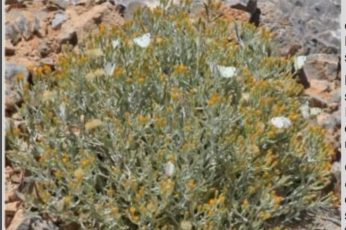
Pulicaria edmondsonii with at least a dozen Desert White butterflies feeding on the blossoms. (BR)

early morning or later afternoon to avoid the midday heat. The Desert White butterfly Pontia glauconome , an arid region specialist, was active throughout the day.