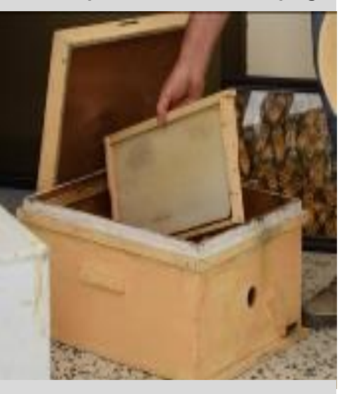
Wooden breed box—around ten of these wax cell inserts can be placed inside the box. The box lid is seen at the back.

Photos show some of the equipment used in professional bee-keeping