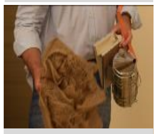
A smoker is used to calm the bees, prior to box inspection.