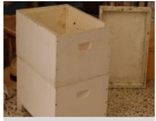
A 'double-storey' breed box.

- each follow their designated duty, communicating via Pheromones.