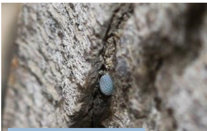
The butterfly egg on the fencepost, waiting for ants.

The ones we observed in Fujairah appeared to take matters a step further – or to their logical conclusion. We observed females laying eggs on a weathered wooden fence