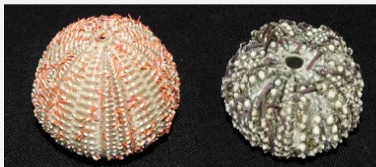
(left) Salmacis bicolor (right) Diadema setosum