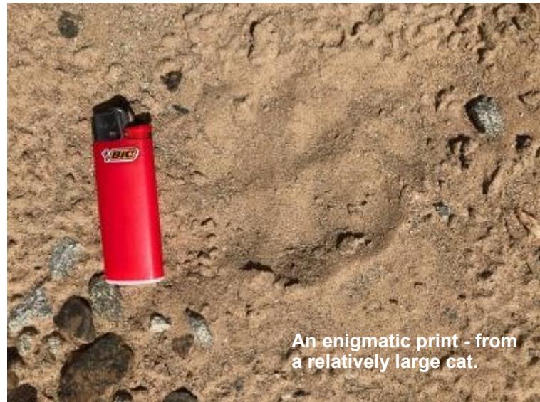
An enigmatic print - from a relatively large cat.

Due to the small size of the Gazelle, articles with four or five photographs can either be accompanied by a few sentences or a small number of paragraphs. Ideally, longer articles should be around (or less than) 600 words.