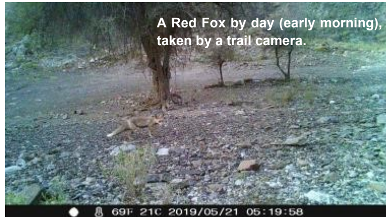
A Red Fox by day (early morning), taken by a trail camera.