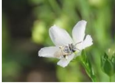
(above) female visiting a flax flower. I've also seen them visit basil, Indigofera sp., Zygophyllum , myrtle, whereas I've only seen the males visiting Zygophyllum and Heliotropum