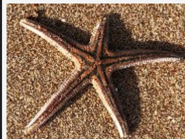
(left) Luidia maculata (right) Astropecten monacanthus