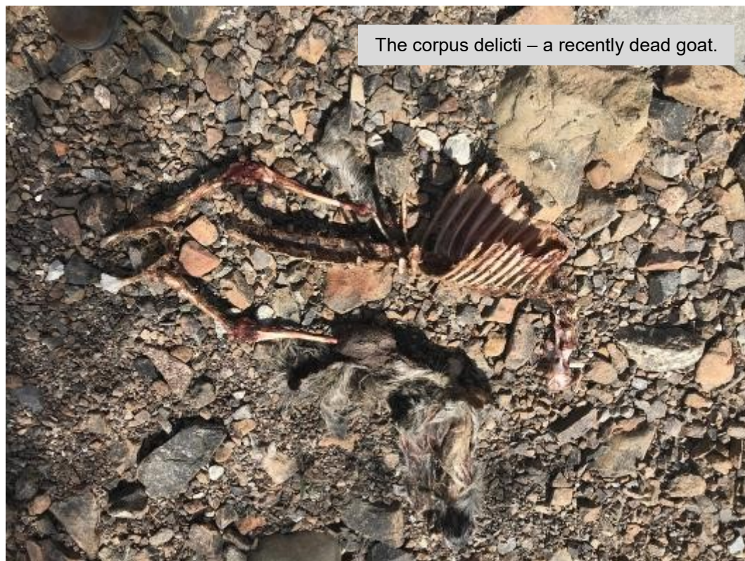
The corpus delicti – a recently dead goat.