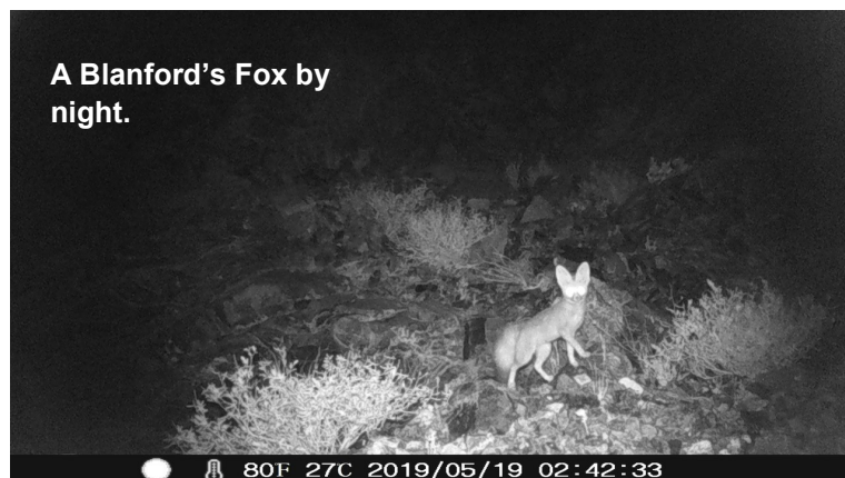
A Blanford's Fox by night.