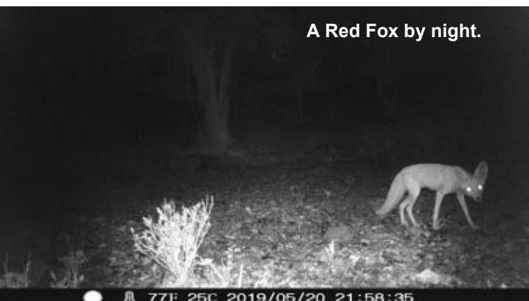
A Red Fox by night.