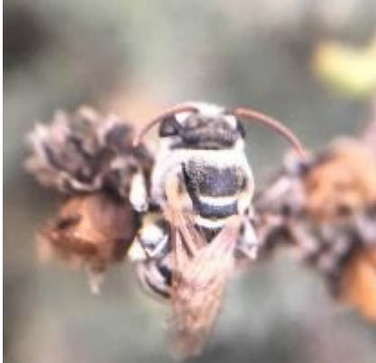
Males blend well with their surroundings (above and below)

Like most of our solitary bees they are ground nesters. I observed them from September last year until June this year.