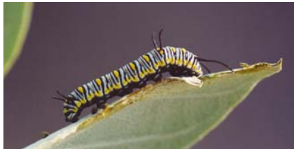
Plain tiger caterpillar

Close up accessories like extension rings and tubes, close-up lenses, macro lenses or lenses with macro facility provide the required image size. A sturdy tripod or preferably a monopod with flash is ideal to photograph butterflies. The best time to approach butterfly photography is the early morning, when the dew is still on the leaves, and the butterfly is basking and drying its wings with the first rays of the sun.