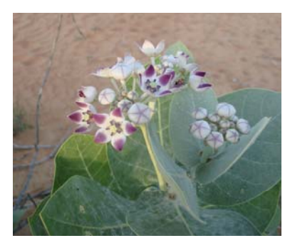
Calotropis