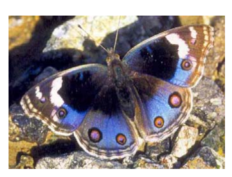
Precis orithya Blue pansy butterflies were commonly seen in Wadi Deftah after rain

possible) and to take account of what was there before, untouched, in what was called, less than 20 years ago, the "wild and almost inaccessible mountain terrain between Masafi and the East Coast" (A.R. Western, The Flora of the UAE: An Introduction (1989). Report by Gary Feulner