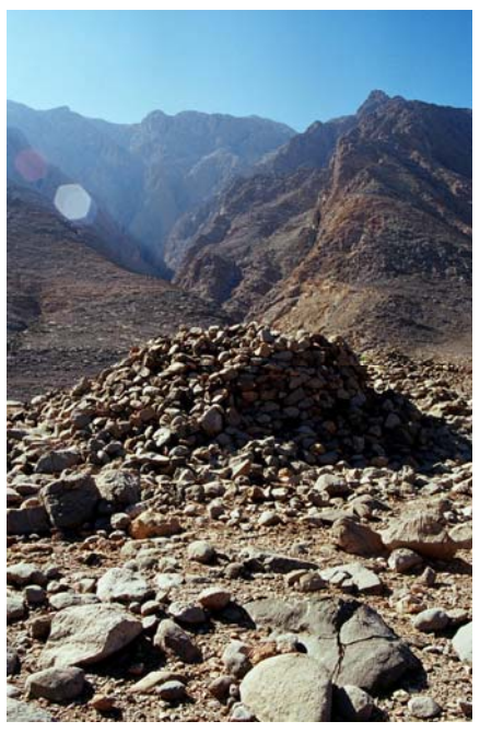
Tomb, Jebel Kawr, Oman