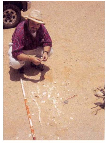
Apparently nothing much ... but in fact eight million year old elephant jaws prior to excavation (from Beech & Hellyer op cit)

materials should be left in situ . It was evident from some of Prof. Hill's photos that what looks to the amateur like just a scatter of small bits of bone could be the disintegrating remains of a diagnostic and valuable fossil, e.g., a large skull.