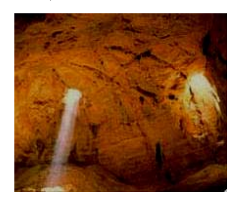
Majlis Al Jinn

impressed by what he learned about the role of the lowly termite in shaping the landscape there. The Okavango floods regularly and the tall termite mounds (they can exceed three metres) serve as nuclei for the deposition of silt in eddies, resulting in sediment accretion and the formation of islands within the swamp.