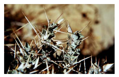
Unidentified plant, Jebel Kawr, Oman

me (an experience I seldom have any longer in the UAE and neighbouring areas of Oman); one of the latter was particularly intriguing and I speculate that it may be a kind of wild rose. I must now acquire vol. 2 of Flora of Oman .