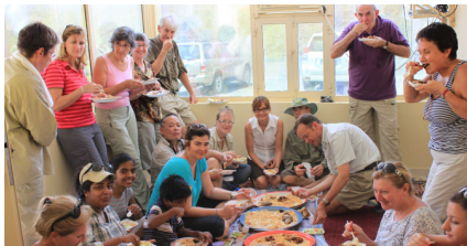
The food was very tasty

We then sought some much needed respite and found ourselves at a typical local roadside 'kitchen' offering the usual minimal fare of a raw cabbage salad, barbecued chicken, and fish tossed onto mounds of rice, served on massive platters.