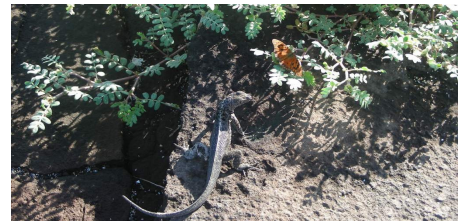
Lava lizard & (probably) Galapagos silver fritillary. Immediately after this photo, the Lizard grabbed the butterfly and ran off