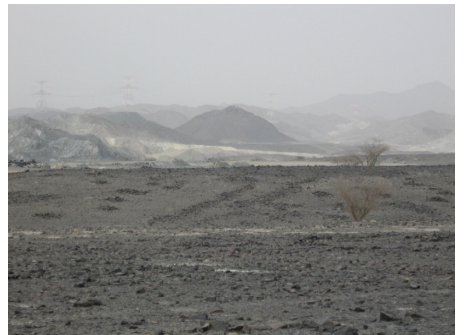
Food for thought! Stone circles and mysterious lines

Adding to the depth and excitement of the mystery was Brien's account of how he had contacted the researcher of a famous site with similar geoglyphs in Nazca, Peru, and had been told by that researcher that he had no idea what function or significance those artifacts had had.