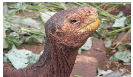
Head of a saddleback tortoise (... or ET?)