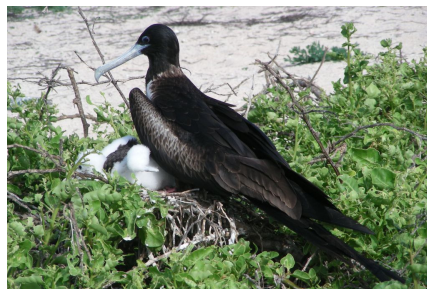
Magnificent frigate bird with chick

The creatures of the Galapagos are renowned for their lack of fear, and Colin was able to get very close to a variety of species.