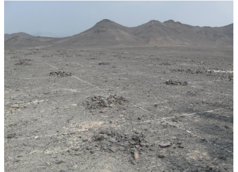
The field of undeciphered geoglyphs