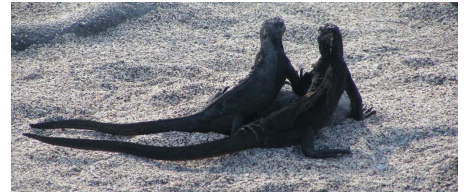
Marine iguanas, which swim & feed on algae

The creatures of the Galapagos are renowned for their lack of fear, and Colin was able to get very close to a variety of species.