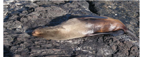
Fur seal basking