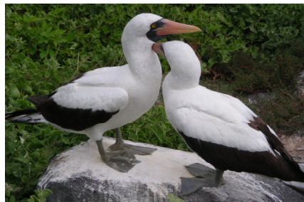
A pair of lascar boobies