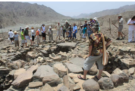
Tomb in Wadi Al Qor

The first two stops, to view a rare exposure of the "Mohorovicic Discontinuity" or "Moho" – the boundary between the earth's crust and mantle – and a 100 year old fort guarding the access to the East coast were straightforward. On our arrival at the two pre-Islamic copper mines and smelting sites in Wadi Safafir, we found thick patches of discarded slag from the ancient smelting process strewn about the ground amidst the ruins of small and humble ancient dwellings and storage units at the first site. Myriad pieces of oxidised 'refined' copper, a brilliant turquoise green, strewn about the deep shaft of a well-preserved smelting pit (and a fresh goat carcass), at the second site, confirmed my preference for this humble metal over the 'king of metals', gold.