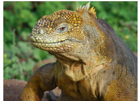
Land iguana ( Conolophus subcristatus )