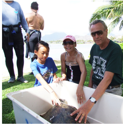
Turtle in the tub