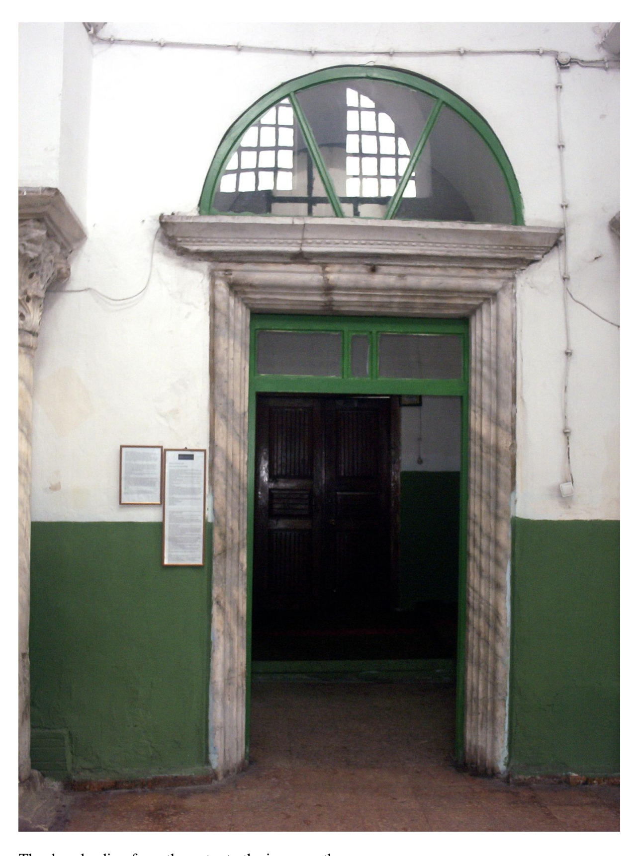
The door leading from the outer to the inner narthex