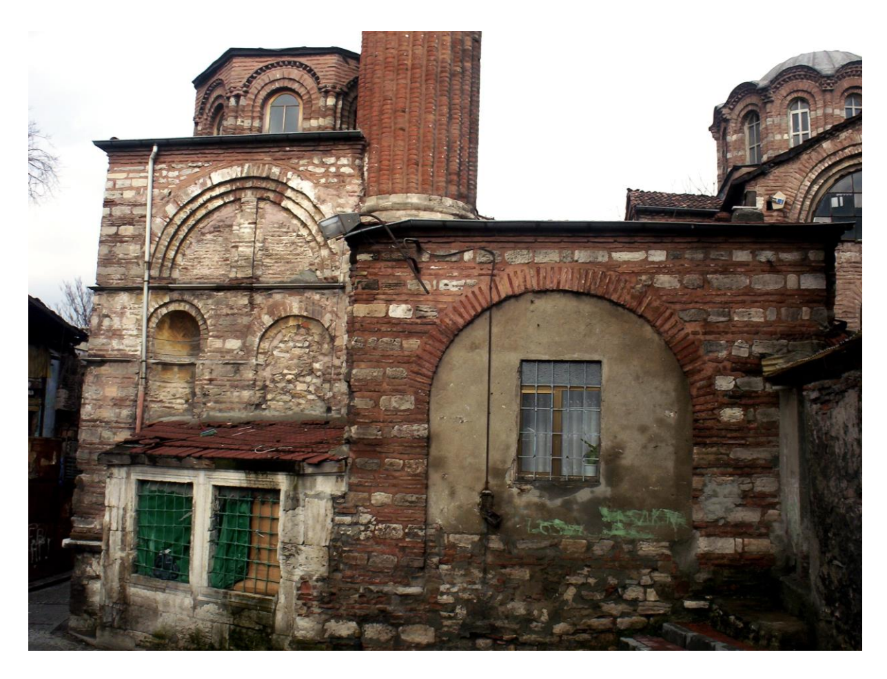
General view from the southwest

The ruins of this church stand in Vefa. Lying between and to the west of St. Sophia and St. Irene, the church had survived until the 19th century. Pierre Gilles who visited Constantinople in the sixteenth century mentioned in 1561 a church of Theodosius with a description that fits exactly with the Vefa Kilise. Paspatis and Janin mention another church of St. Theodore Sphorakiou , originally built in the 5th century. Topographical data in sources are not conclusive. The origin of the church of St. Theodore ta Karbounaria is attributed in the time of the reign of the emperor Leo I (457–74). The Patria attributes it to the patrician Hilarion, who is identified with the magister officiorum Hilarianus, whose office was held in the last years of Leo. The church bears this epithet except for the Patria in a document of 1090, a further source of the twelfth century, and in Life of a saint. The church lay on the road between the Artopoieia <sup>3</sup> and Taurus. The great fire of 1197 destroyed a domed church dedicated to Christ, which Mango