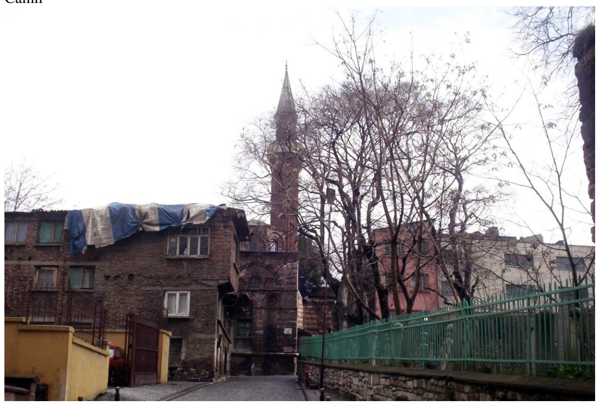
Vefa Kilise In the background