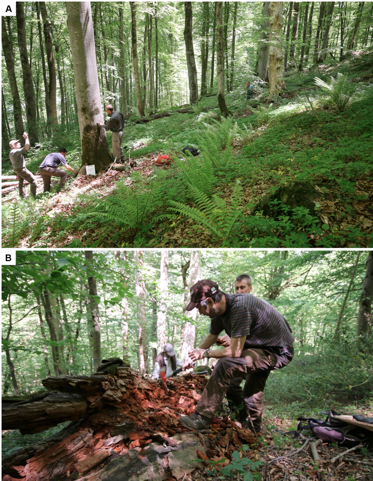
Fig. 5. Habitat of Lacon mertliki sp. nov. in Iran, Mazandaran province. A. Old-growth forest. B. Advanced brown rotten log.