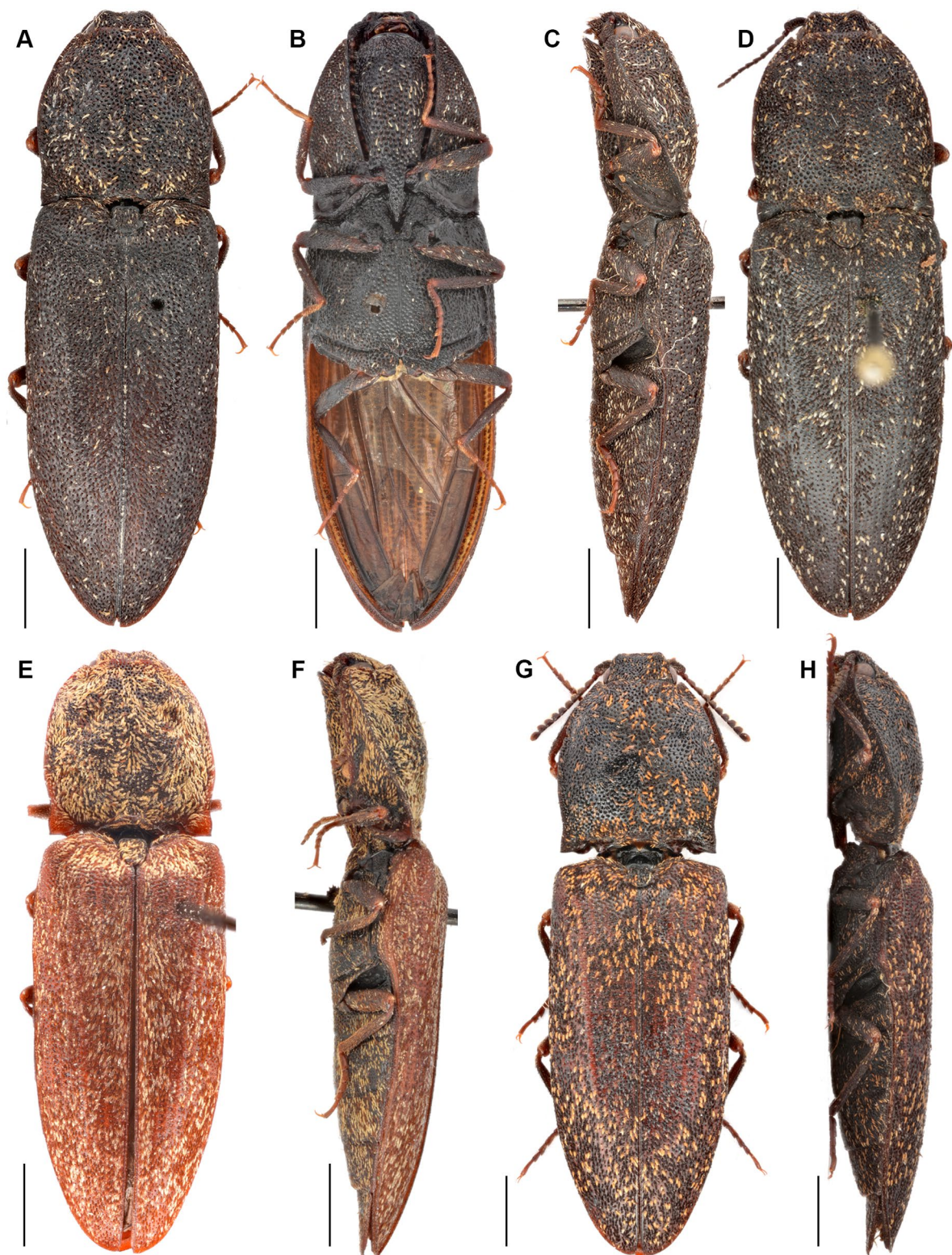
Fig. 1. Habitus images of Lacon spp. A–C. L. mertliki sp. nov, holotype, ♂, in dorsal, ventral and lateral view, respectively. D. L. mertliki sp. nov, paratype, ♀, dorsal view. E–F. L. lepidopterus (Panzer, 1801), ♂ (lectotype of L. aurosquamosus (Jagemann, 1944)) in dorsal and lateral view, respectively. G–H. L. lepidopterus , ♀ from Turkey in dorsal and lateral view, respectively. Scale bars = 2.0 mm.