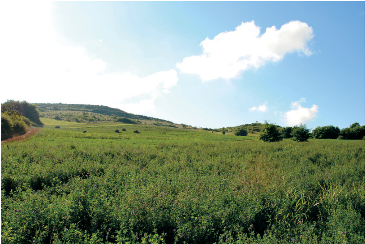
Fig. 2 View of the landscape

these were supplemented by pulses, peas and beans, and by other edible plants that were gathered wild rather than cultivated. A wide range of fruits and berries was also exploited, as evidenced by a number of well-preserved wet sites. At certain times other grains were also important, and oil plants usually played a role as well. 7