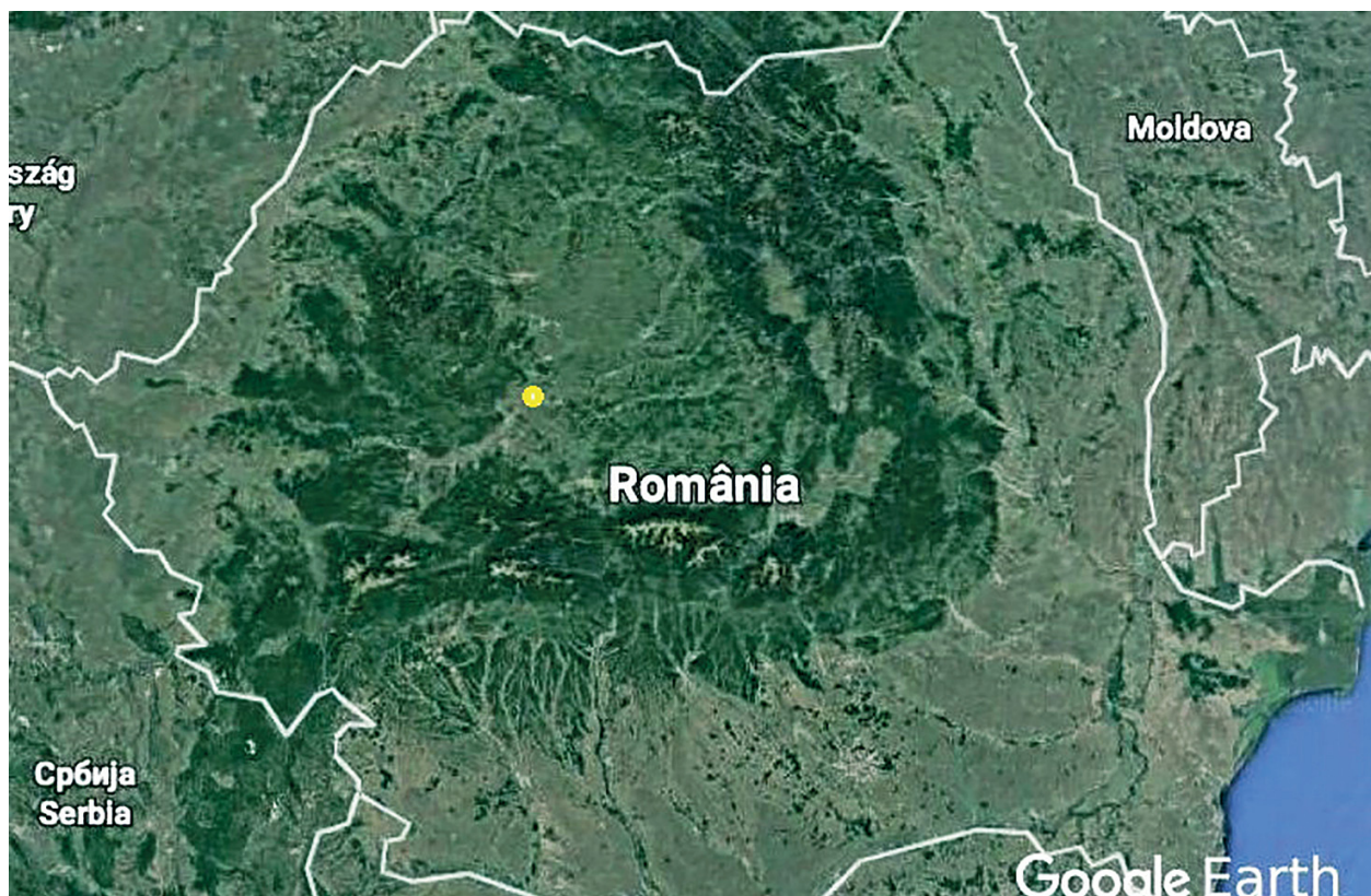
Fig. 1 Location of the site of Teleac in Romania (map based on Google Earth)

The Bronze Age is assigned to the climatic period called the Subboreal, which is between the Atlantic and the Subatlantic periods. In general, this was a warm and dry period, in contrast to the warm wet Atlantic and the cool wet Subatlantic. Nevertheless, such a mild general statement conceals a mass of small variations, both spatial and temporal. A pollen diagram shows that within the broader picture obtained by traditional pollen analysis there is a similar detailed set of fluctuations happening in the pollen record, which as a proxy climate indicator reflects changes in air temperature, precipitation and so on. 4