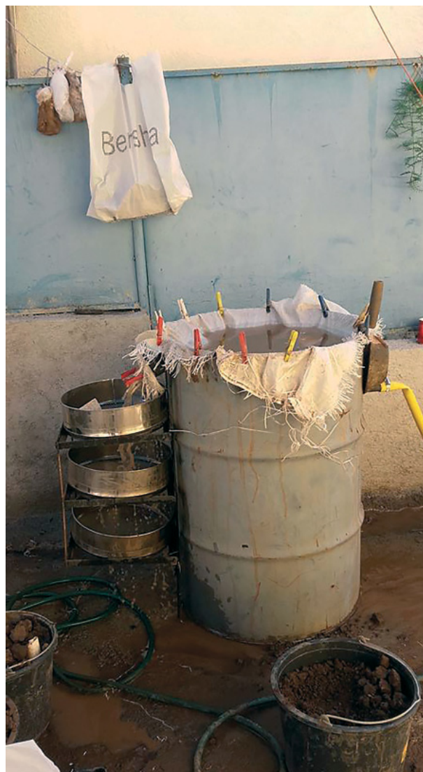
Fig. 5 Flotation barrel used in the selection process

Panicum miliaceum : The small seeds belonging to broomcorn millet were found in every Late Bronze Age context in Teleac. According to specific literature 13 domestic millet became predominant in Europe only in the Late Bronze Age, being a latecomer to the cereals category. Common millet ranks among the hardiest cereals. It is a warm-season plant, which stands up well to intense heat, poor soils and severe droughts. Moreover and very important, it completes its life cycle