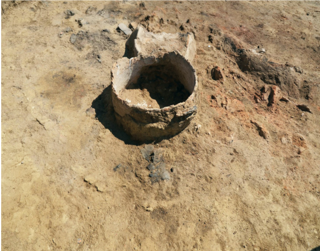
Fig. 6 Oven in Trench 1