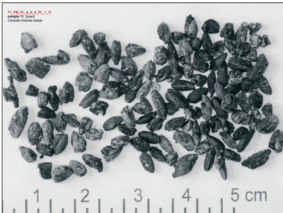
Fig. 7 Charred seeds recovered from inside the oven