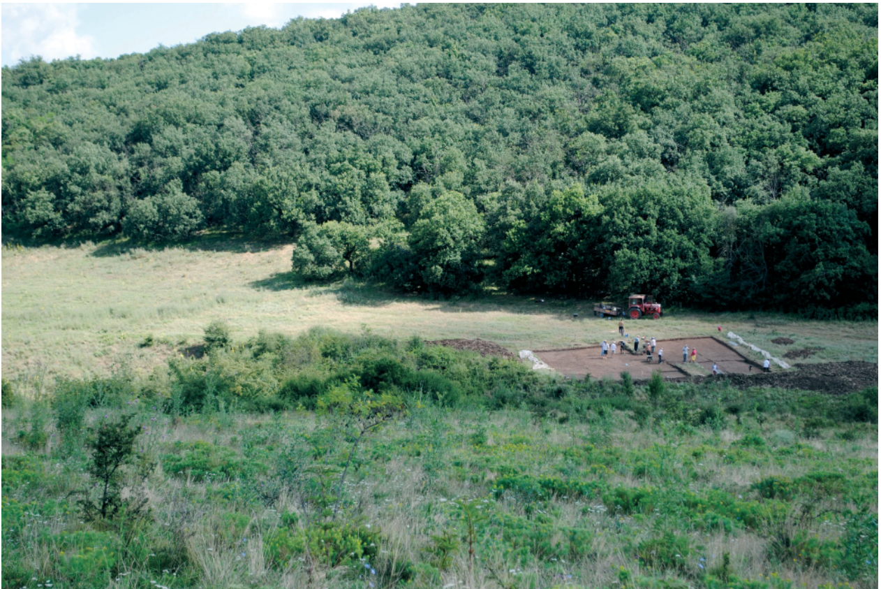
Fig. 4 View of Trench 2