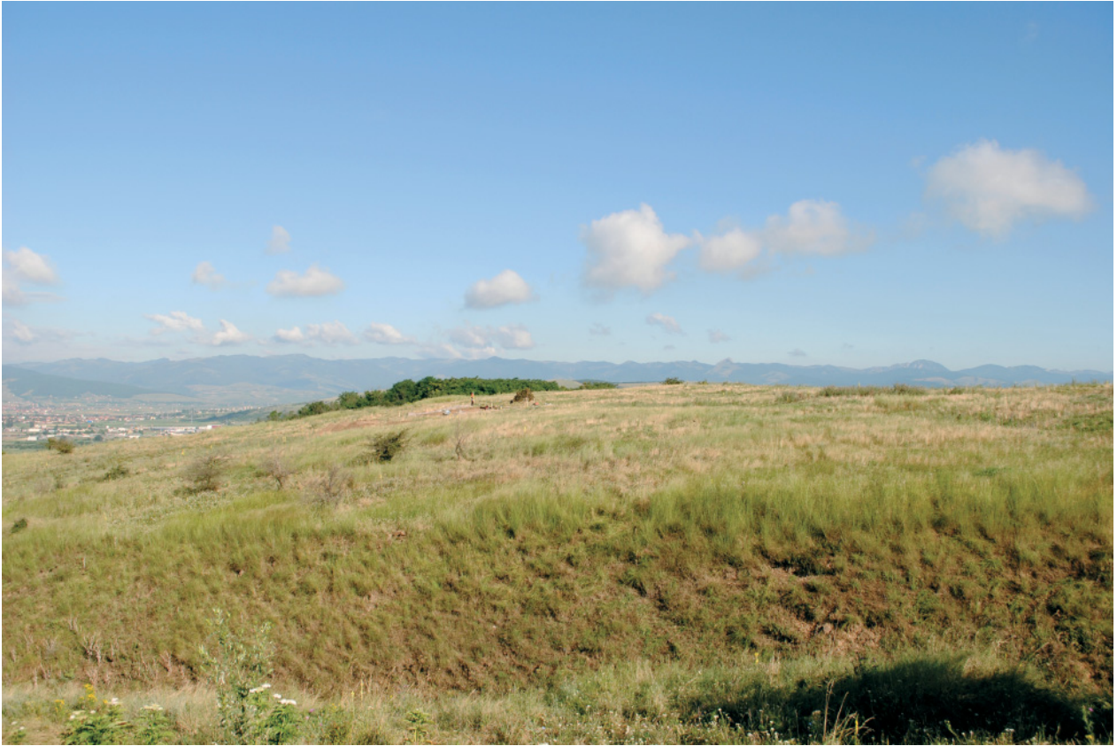
Fig. 3 View towards Trench 1