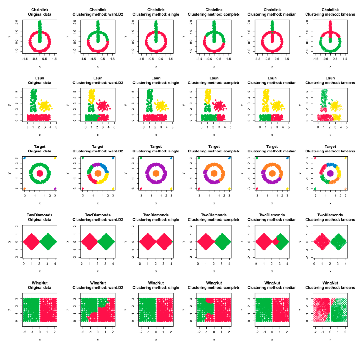
Figure 2. Examples of the resulting clusterings when applying different clustering methods to the FCPS datasets. The figure has been created on the basis of results obtained with the R library "cluster" [8] and with the "kmeans" command implemented in the base "stats" module of the R software package [9].