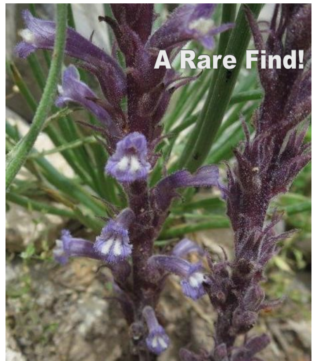
Photo: Orobanche aegyptiaca from Wadi Ghalilah. The flowers show the diagnostic pair of white stripes on the lower lip. (Photo by Angela Manthorpe)