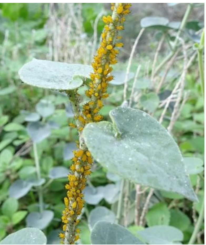
Aphis nerii on stem of Pergularia tomentosa