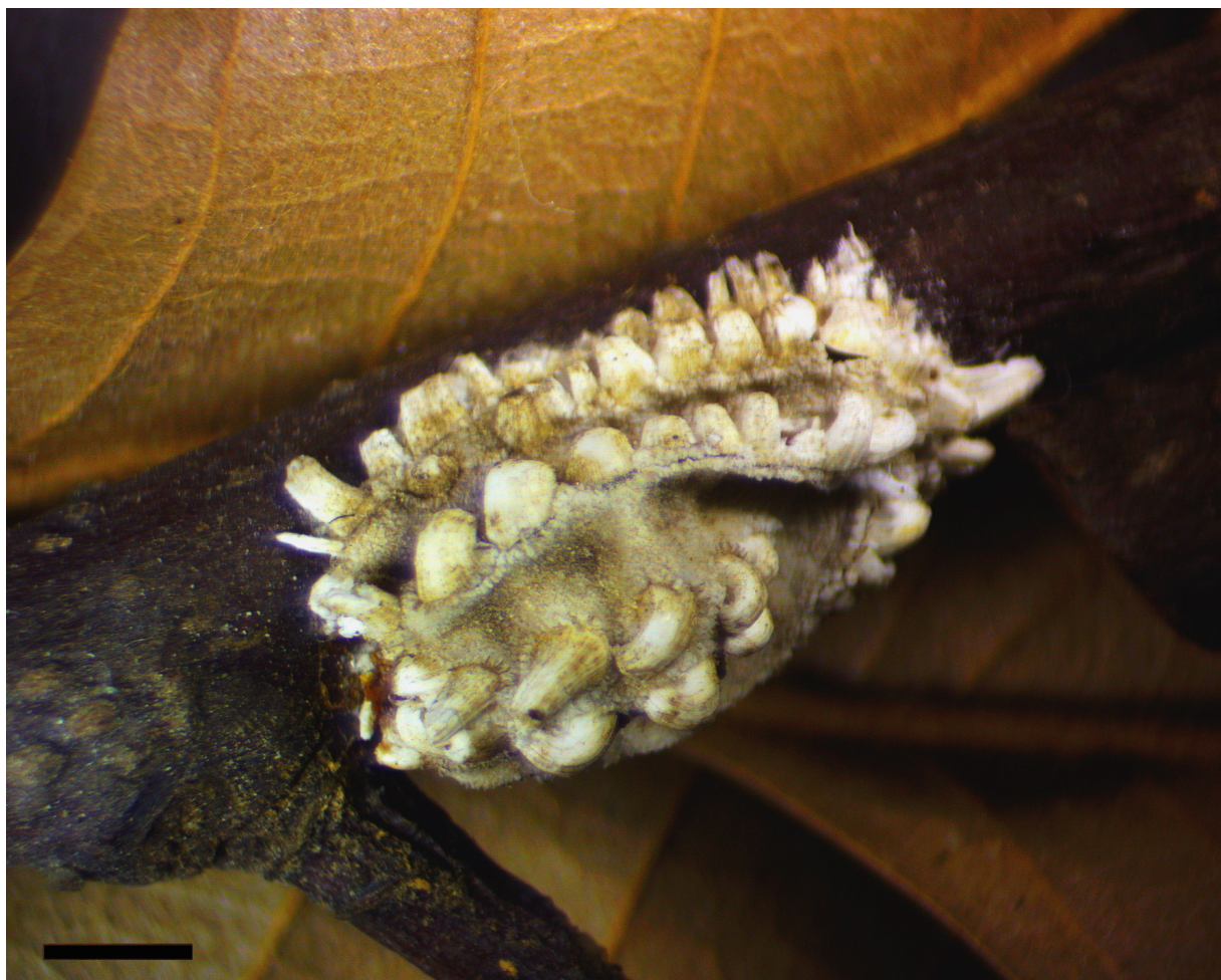
Fig. 1. Gompholopium quercicola gen et sp. nov., paratype, dry ♀ (ZIN RAS, K 1548) on twig of host plant. Scale bar = 1 mm.