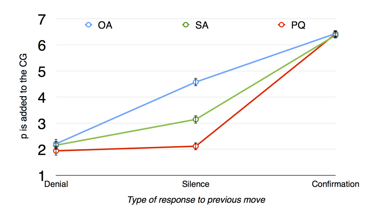
Figure 1: Average ratings for Experiment 1